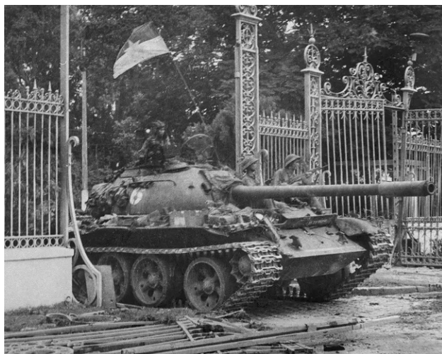
Un tanque norvietnamita derriba la puerta del palacio presidencial survietnamita el 30 de abril de 1975.

Agente Naranja, un herbicida mortal, para destruir la vegetación y defoliar los bosques en un esfuerzo por desenmascarar a los combatientes vietnamitas de liberación. El herbicida contiene la sustancia química tóxica dioxina, relacionada con el cáncer y los defectos de nacimiento. Aún hoy, tres millones de vietnamitas, incluidos niños, padecen graves y debilitantes problemas