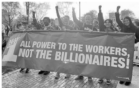
Boston, May 1, 2025.

Go to workers.org/2025/05/85451 for a round up of several U.S. May Day activities.