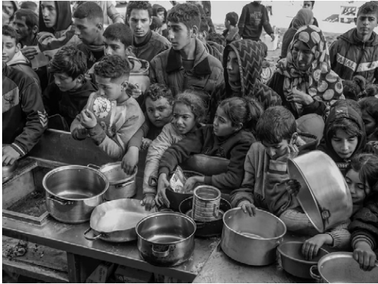
Famine in Rafah, in southern Gaza.

Coalition activists issued the following