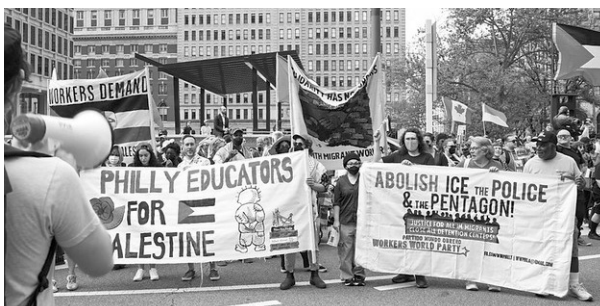
Philadelphia, May 1, 2025.