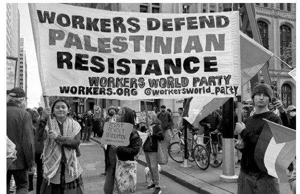
New York City, May 1, 2025.