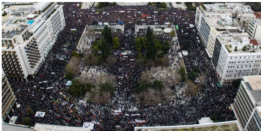
General strike in Athens, Greece, Feb. 28, 2025.