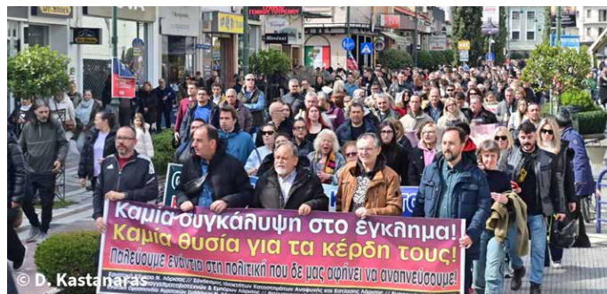
General strike in Larissa, Greece, Feb. 28, 2025, near the 2023 deadly train crash.

Long live the resistance of the workers of Greece! Solidarity forever! □