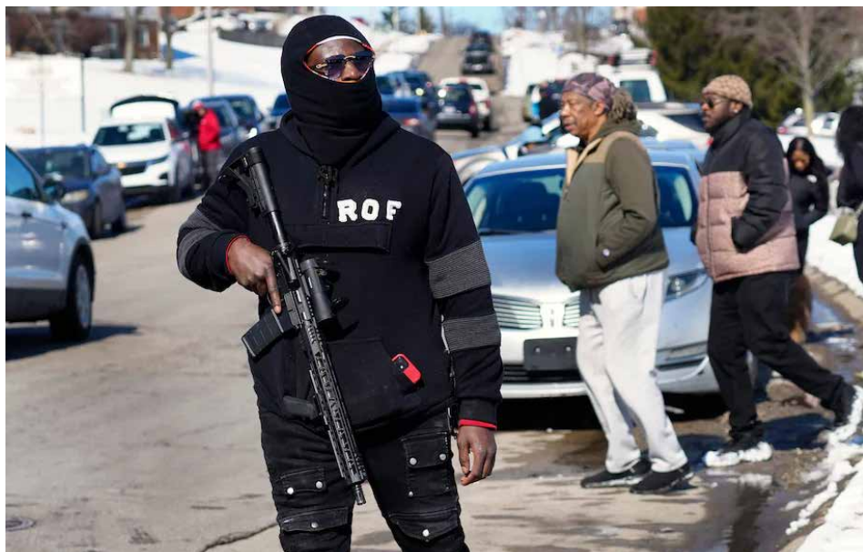
Armed resident in Lincoln Heights, Ohio, Feb. 17, 2025.