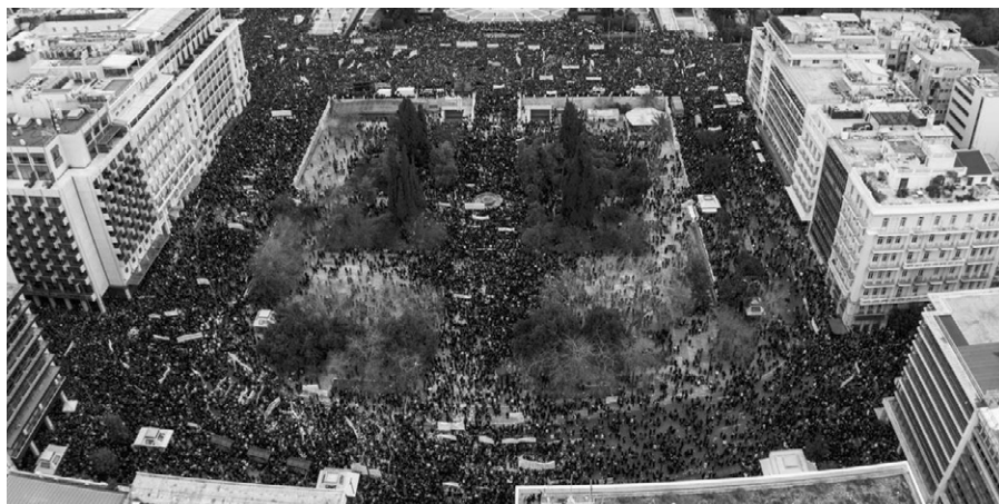
General strike in Athens, Greece, Feb. 28, 2025.