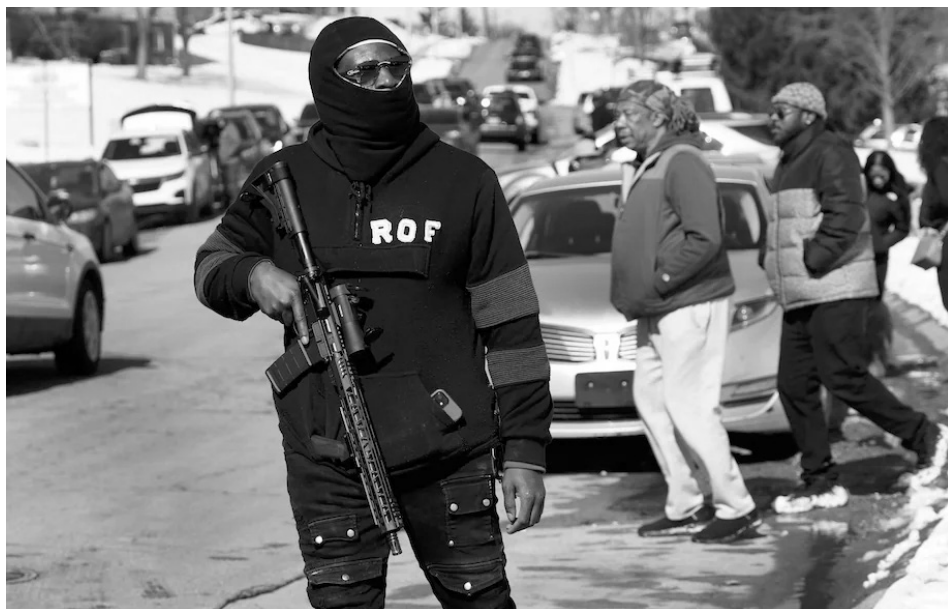
Armed resident in Lincoln Heights, Ohio, Feb. 17, 2025.