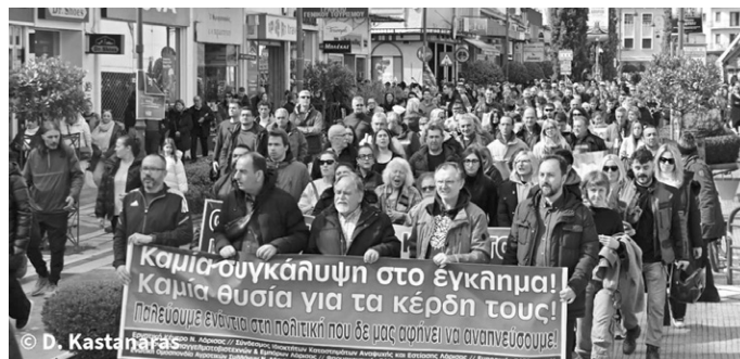
General strike in Larissa, Greece, Feb. 28, 2025, near the 2023 deadly train crash.

Long live the resistance of the workers of Greece! Solidarity forever! □