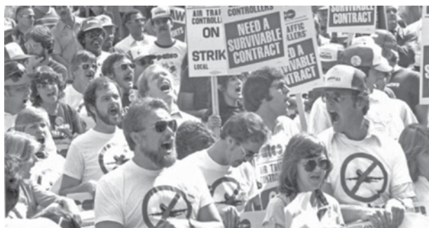
Miembros en huelga de la Organización Profesional de Controladores de Tráfico Aéreo (PATCO), que se declararon en huelga el 3 de agosto de 1981 y fueron despedidos dos días después por el entonces presidente Ronald Reagan.

Nadie debería sorprenderse cada vez que Trump se expone como el vil y repugnante intolerante ultraderechista que es.