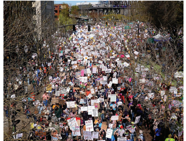
Portland, Oregon, April 5, 2025.