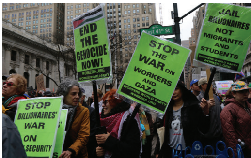
New York City, April 5, 2025.

Protest reports can be read at workers.org/2025/04/84908/