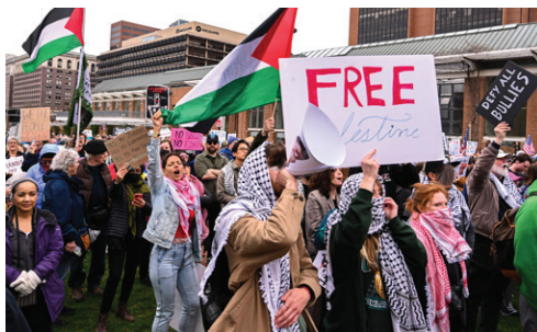
Philadelphia, April 5, 2025.

Millions of people protested across all 50 states, U.S.-occupied territories and dozens of locations around the world, showing immense anger against Trump and centibillionaire Elon Musk and their devastating attacks on workers, immigrants, people of color,