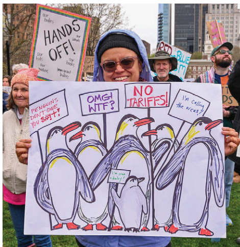
Philadelphia, April 5, 2025.

The fear among capitalists now is that the added cost of new, huge tariffs imposed by Trump will eat into their profit margins.