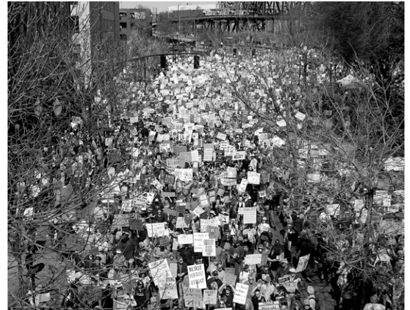
Portland, Oregon, April 5, 2025.