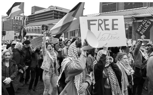
Philadelphia, April 5, 2025.

Millions of people protested across all 50 states, U.S.-occupied territories and dozens of locations around the world, showing immense anger against Trump and centibillionaire Elon Musk and their devastating attacks on workers, immigrants, people of color,