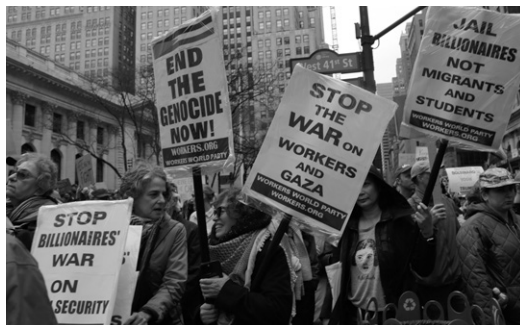
New York City, April 5, 2025.

Protest reports can be read at workers.org/2025/04/84908/