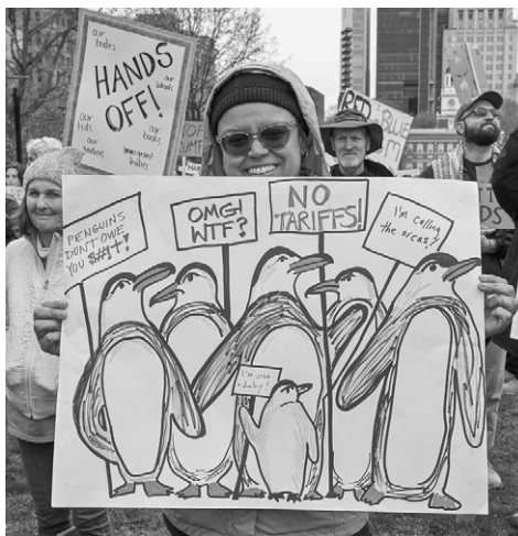
Philadelphia, April 5, 2025.

The fear among capitalists now is that the added cost of new, huge tariffs imposed by Trump will eat into their profit margins.