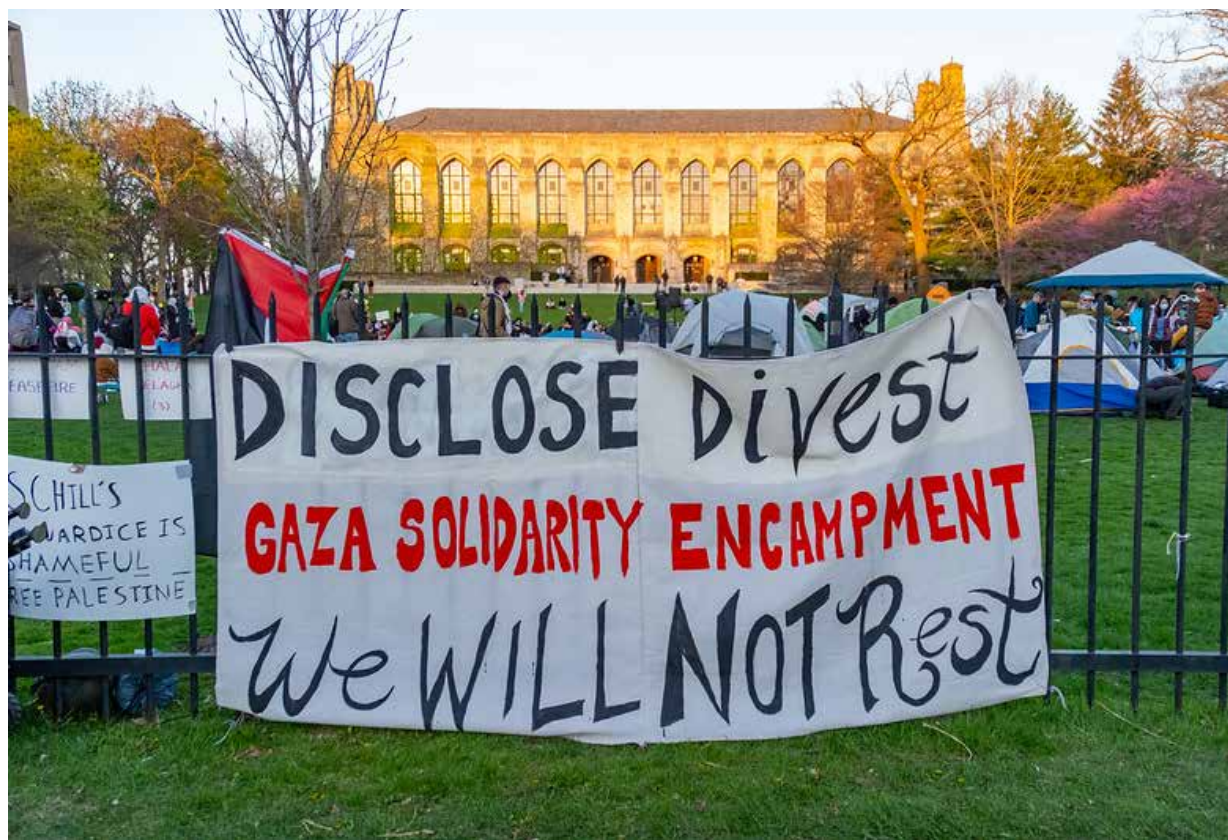
Northwestern University, Evanston, Illinois, April 2024.