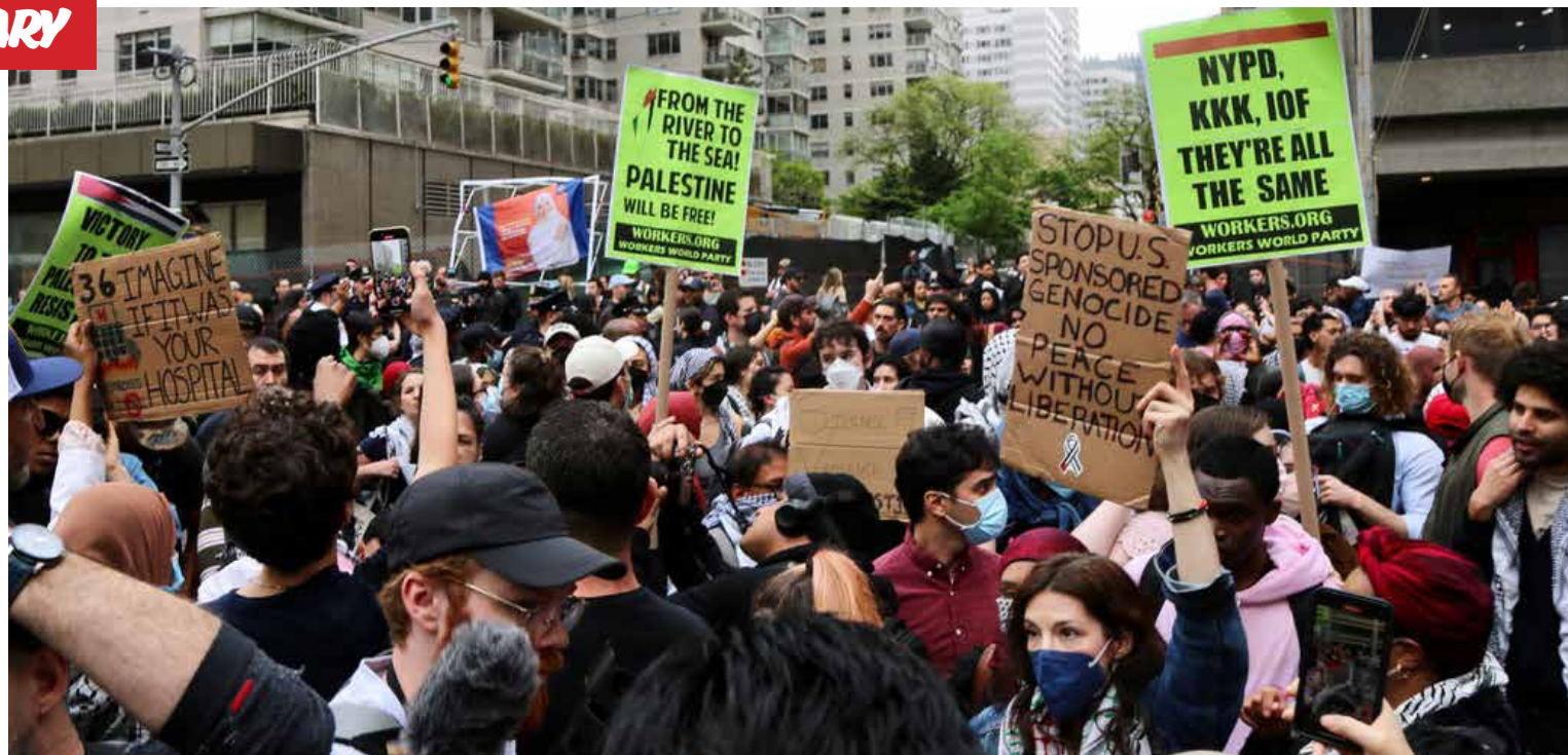
In response to the genocidal Israeli assault on Rafah, students gather at Hunter College in New York City. Despite police brutality, they take their protest to near the Met Gala, May 6, 2024.

This false claim of antisemitism provides a cover for Washington to continue its support for a regime, which,