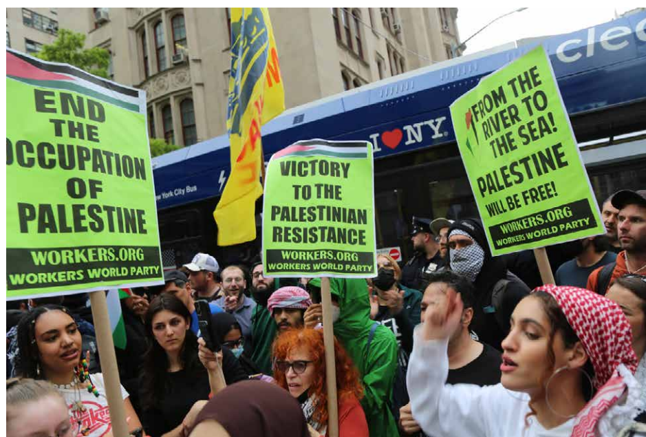
Hunter College, New York City, May 6, 2024.

Today the students are challenging U.S. support for Israel. Since Israel is a key link in imperialist domination