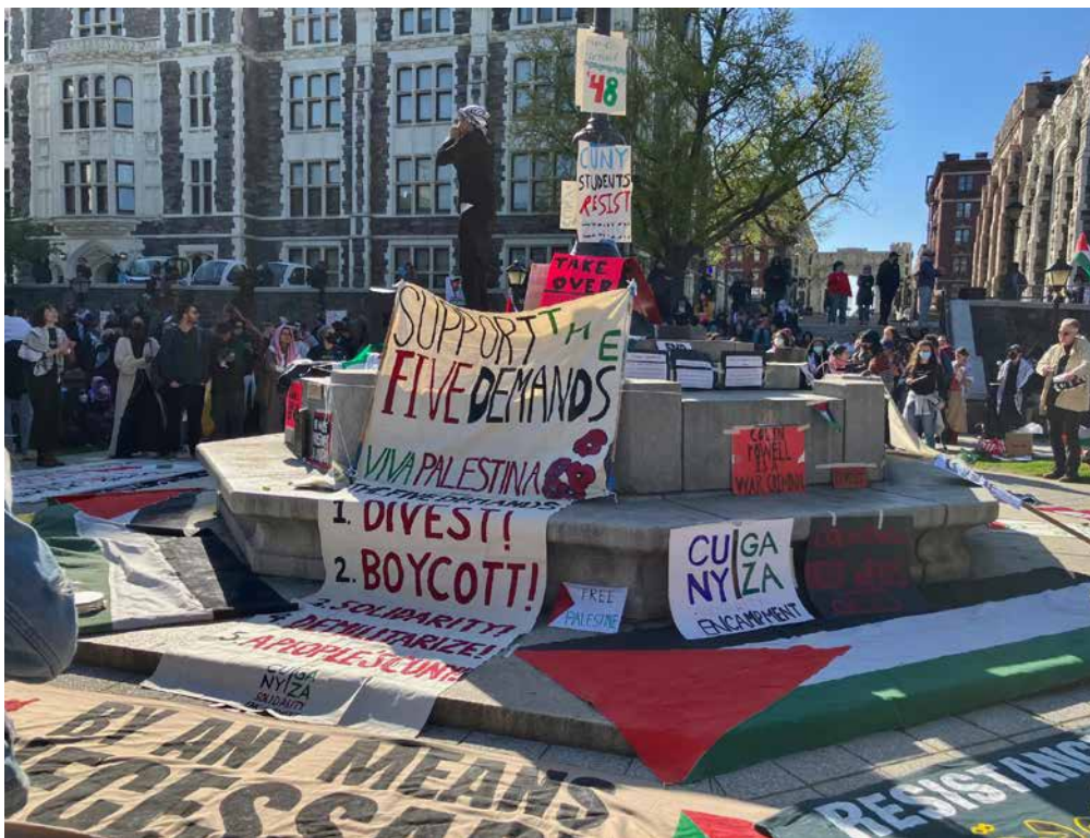
Campamento del CCNY, Nueva York, 25 de abril de 2024.

Workers World exige: ¡Que se retiren los cargos contra TODOS los estudiantes y profesores manifestantes! ¡FIN a la represión policial! ¡Victoria de la resistencia palestina! Del río al mar, ¡Palestina será libre! □