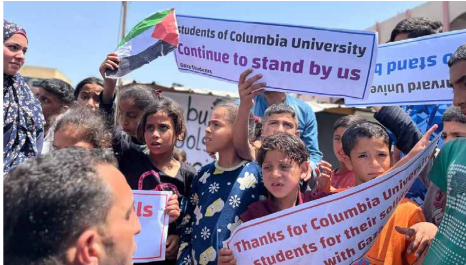
Gaza students in Rafah, Palestine, April 28, 2024.

Dozens of pro-Palestinian activists have either been suspended or expelled by pro-Israel university administrations. Faculty members seeking to physically protect their students' First Amendment rights to protest have also been brutalized and arrested. Some have