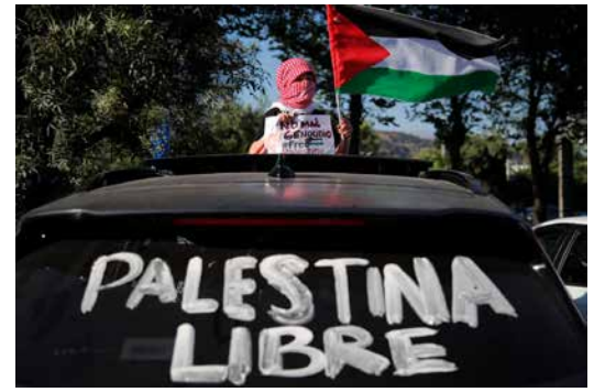
Chile, 23 de noviembre, 2023.