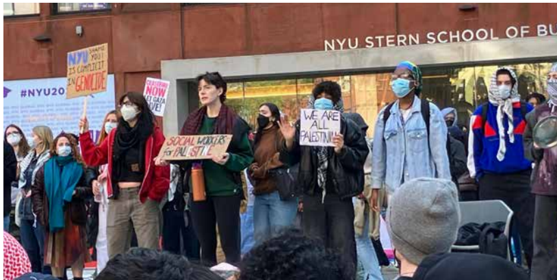
Encampment at New York University, April 22, 2024.

The working class must act in solidarity with this heroic student revolt, one that is not only taking on Zionist apartheid, but is objectively confronting the whole capitalist class that dominates U.S. society. □