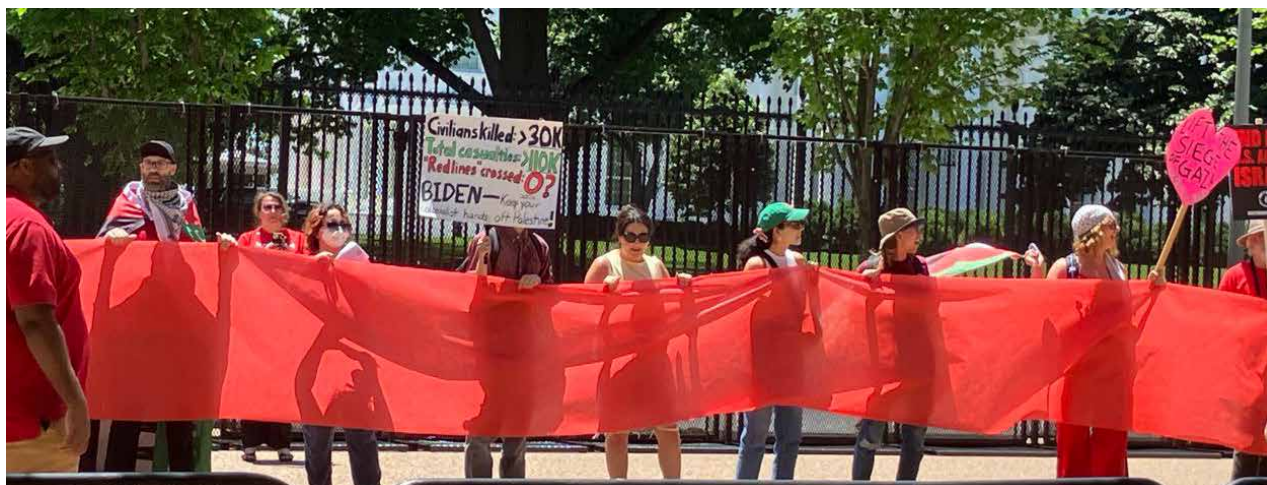
Protesters hold red banner while surrounding the White House, June 8, 2024.

Israeli Occupation Forces have been carrying out military operations in Rafah since May 27, when an airstrike killed 45 people living in tents, using bombs produced in the U.S. Other more recent airstrikes targeted a United Nations school in northern Gaza on June 7, killing three