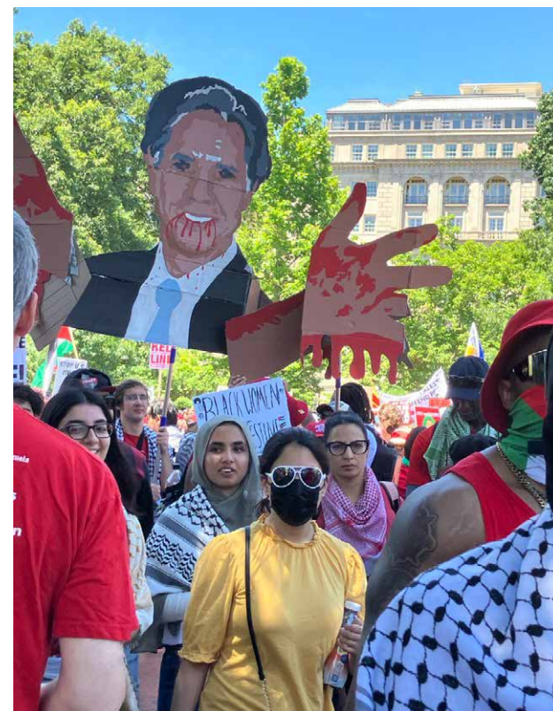
Bloody Blinken effigy in Washington, D.C., June 8, 2024.

Kanaky – turned 180 degrees from Hollande's 2014 comments.