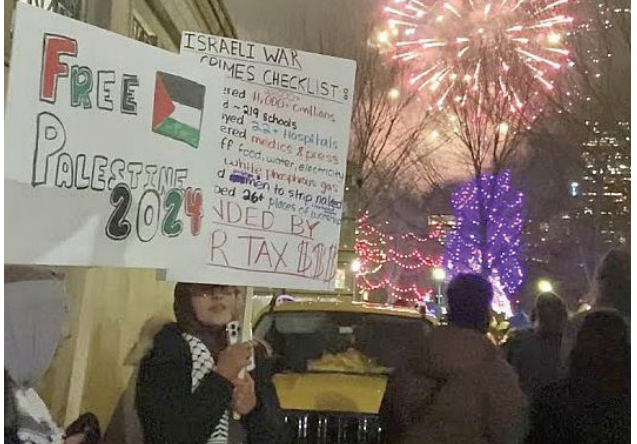
'Free Palestine in 2024' at First Night on Boston Common, Dec. 31, 2023.

Speakers representing Indigenous nations; Jewish and Muslim clergy; union, student, antiwar and socialist constituent organizations in one voice decried the ruling class's "party-as-usual" denial of 2023's televised mass slaughter of Palestinian civilians and resistance fighters