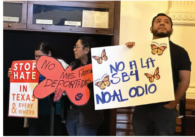
Demonstrators respond to Abbott's reactionary law.

Abbott has called four special sessions of the legislature to attempt to put into law that private and religious schools be