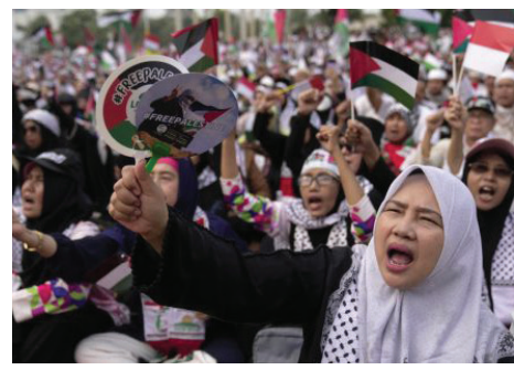
Women march for Palestine, Jakarta, Indonesia, Oct. 15, 2023.

The group Speak Up, "A feminist initiative to support victims of violence in all its forms," states: "Exploiting women's bodies and rape allegations as war propaganda carries profound and extensive implications, affecting not only the imme-