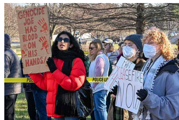
Blue Bell, Pennsylvania, Jan. 5, 2024.

Despite wind, snow and sleet, on Jan. 6, over 150 people took over Philadelphia streets, making it clear they would not stop demonstrating for Palestine. Protesters gathered at Franklin Square near the heavily trafficked entrance to the Benjamin Franklin Bridge. They marched to the Philadelphia Inquirer building at Sixth and Market streets; passed the nearby National Museum of Jewish History, where a huge Israeli flag was on display with the words "We support Israel"; and walked to the nearby Fox