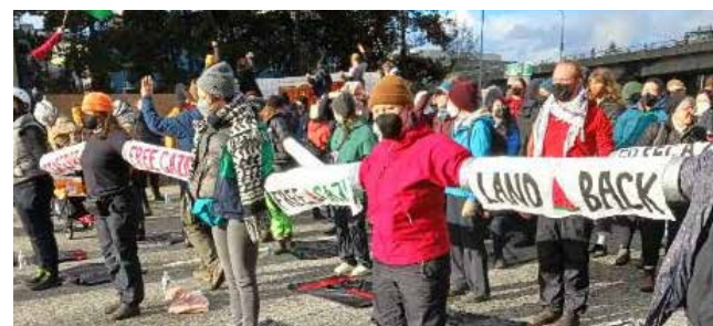
Outside Starbucks, Seattle, Jan. 6, 2024.

The second protest was a well-planned action blocking the Interstate 5 freeway with cars and several hundred pedestrians. Meanwhile, 1,000 supporters were on the overpasses; nearby there were banner drops. I-5 is the main north/south freeway on the West Coast.