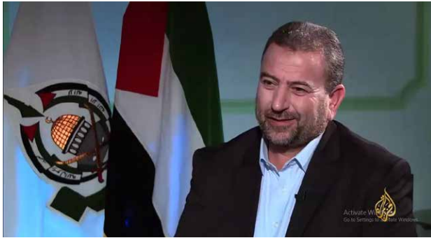
Jeque Saleh Al-Aroui

Este asesinato es, ante todo, una tremenda pérdida para el pueblo palestino, incluida la resistencia que él