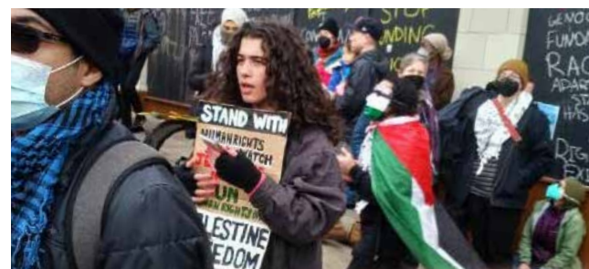
Outside Starbucks, Seattle, Jan. 6, 2024.

These were both Palestinian-led demonstrations with a number of solidarity organizations participating. □