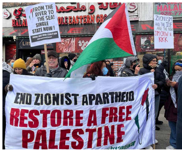
Protest for Palestine in 'Little Yemen' neighborhood, Bronx, New York, Jan. 6, 2024.

"Gaza called, Yemen answered. Now Israeli ships are canceled!" was the chant Jan. 6 as thousands marched in frigid temperatures