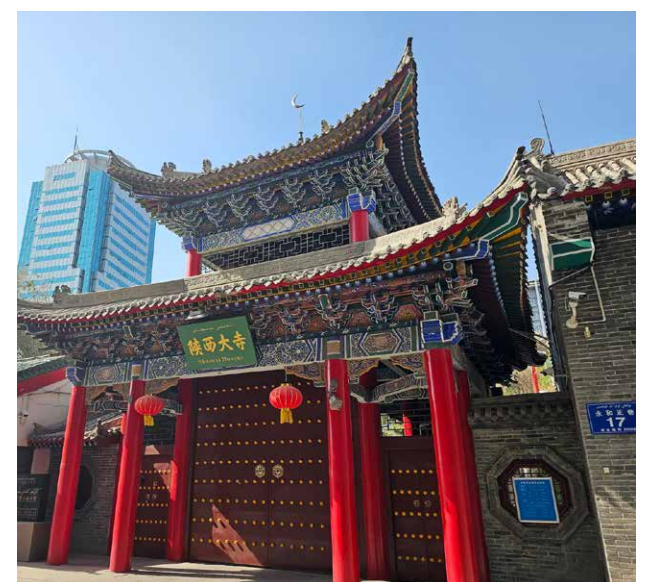
La Hui Mezquita situada en Ürümqi, Xinjiang, Región Autónoma Uygur.

(Para el artículo del autor del 9 de junio de 2023 sobre el viaje a Xinjiang, véase: workers.org/2023/06/71505 )