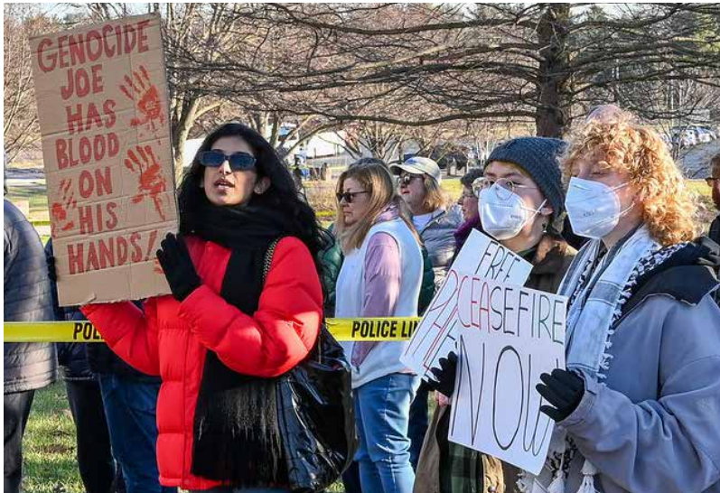
Blue Bell, Pennsylvania, Jan. 5, 2024.

For more details on the CCR case, see ccrjustice.org