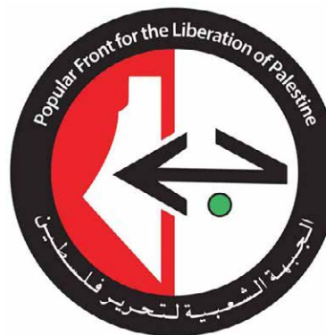
Logos of PFLP (left) and Hamas

strategy to confront occupation, settlement, Judaization and displacement, protect rights and sanctities and continuing the resistance and struggle until liberation, return and independence. □