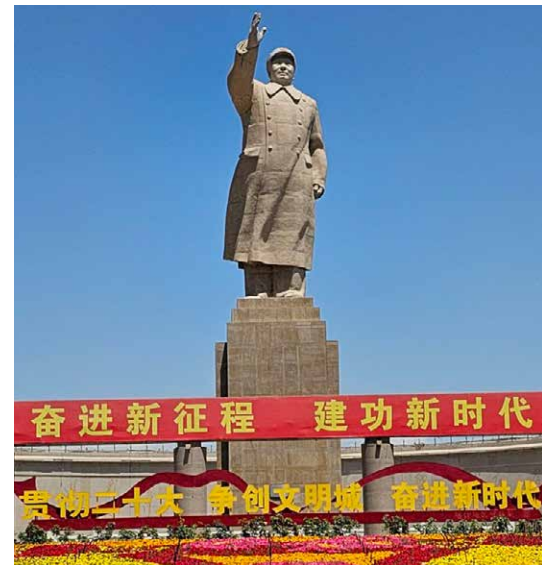
MO FOTO: ARJAE RED Estatua del Presidente Mao Zedong en Kashgar, Región Autónoma Uigur de Xinjiang.

Los uigures y otras minorías étnicas disfrutaban de subvenciones del gobierno y otros programas de acción afirmativa en educación y oportunidades laborales, que les permiten establecer sus propias empresas prósperas y participar plenamente en la vibrante economía china. Todo esto ha reducido gradualmente la brecha de riqueza y desarrollo entre la región occidental de Xinjiang y la