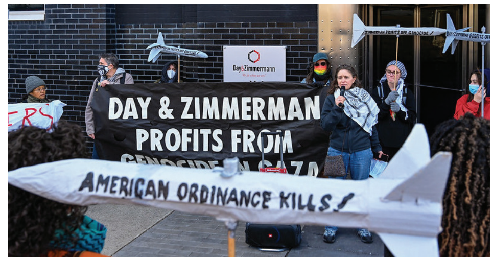
Protesters denounce weapons-maker Day & Zimmermann's support for Israeli genocide in Gaza. Philadelphia, April 5, 2024.