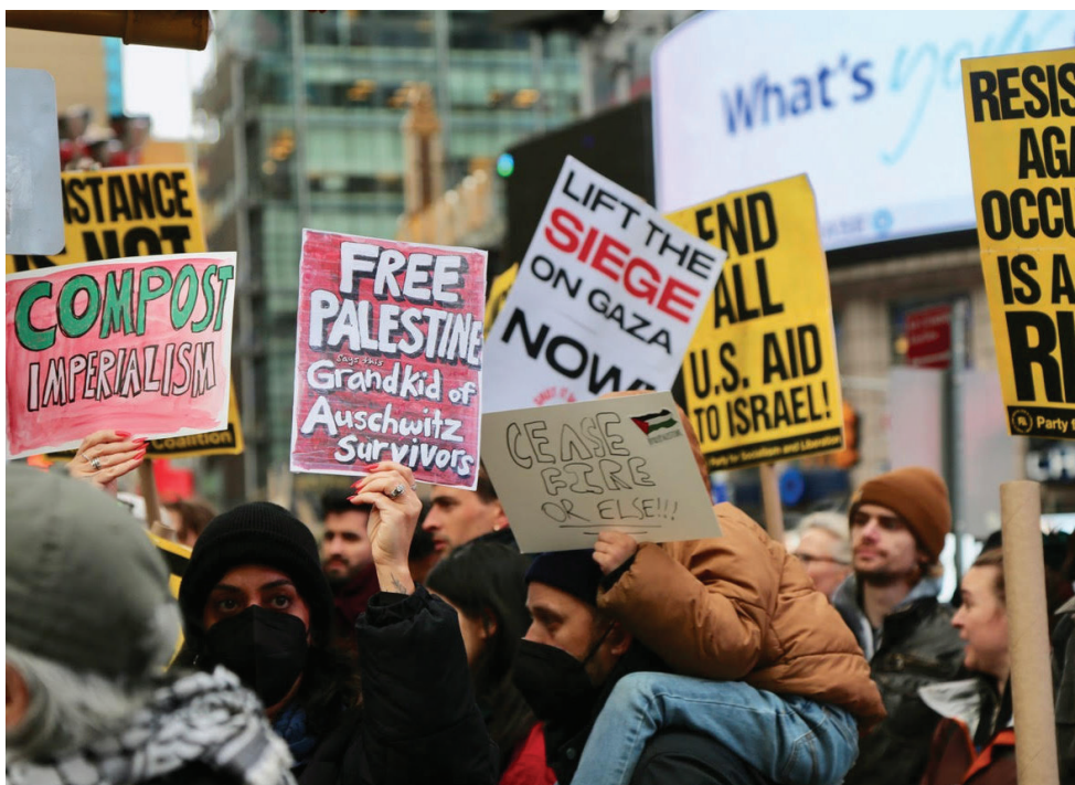
Times Square, New York City, April 5, 2024.

Protesters marched from Times Square to Herald Square chanting "Free free Palestine, Free free free Palestine!" and "From the River to the Sea, Palestine will be free!" Several times the crowd took to the streets until a large force of police pushed them back onto the sidewalk. \Box