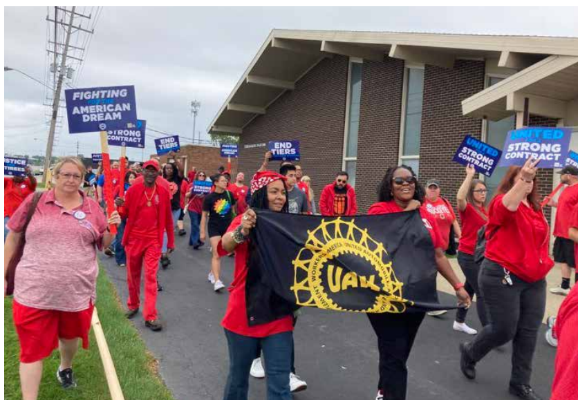
UAW practice picket, Brookpark, Ohio, Sept. 10, 2023.

The most recent contract offers from the Detroit Three have been deemed "insulting" by the UAW, as the offers fail to properly address union demands for pay increases that match the increase in CEO pay, restoration of the cost-of-living allowance, elimination of unequal pay and benefit tiers, job security, a shorter work week and more. □