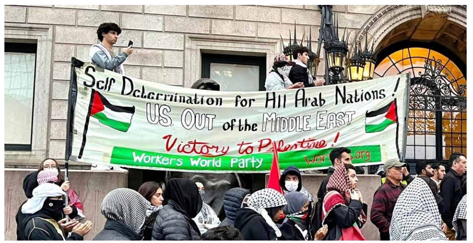
Boston protest, Oct. 17, 2023.

armed wing of the anti-apartheid struggle to fight force with force for both survival and social change. This significant decision was made with the understanding that any armed resistance would be a defensive one because the apartheid