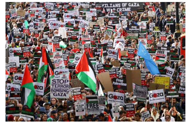
100,000 people rally in London, Oct. 21, 2023.

"After every stage in the struggle of the workers and oppressed people, there follows an ideological struggle over what methods the masses should embrace to achieve their liberation from imperialist monopoly capital. There are always those who abjure violence while minimizing the initial use of violence by the ruling class. They denounce it in words, while in deeds they really cover it up. That's precisely what's happening now.