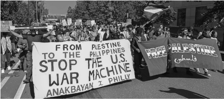
Philadelphia protest hits media coverage of Palestinian resistance, Oct. 12, 2023.

Responding to a call from the Philadelphia Palestine Coalition, hundreds of people turned out at noon on Oct. 12, outside the Philadelphia offices of local NPR/PBS affiliate WHYY TV and radio. Protesters called out the media censorship of Palestinian resistance and the media whitewashing of Israeli genocide. A flier distributed by the Coalition criticized “liberal” media like NPR for: “Portraying settler and state violence as ‘clashes’ and ‘tensions’ between two sides and failing to recognize the asymmetrical power imbalance between the U.S.-backed Israeli military apparatus and resistance movements across Palestine. “Local media outlets have historically censored pro-Palestinian organizers and used false balance journalism to create biased pro-Zionist narratives which subvert necessary context for the ongoing resistance to Zionist occupation of Palestine.” Participation in the rally was largely by Palestinian students and youth, with many supporters. Students for Justice in Palestine chapters from area universities, including Drexel, Temple, Swarthmore, University of Delaware, Bryn Mawr and Haverford, and Penn Against Occupation were in attendance and presented their combined statement.