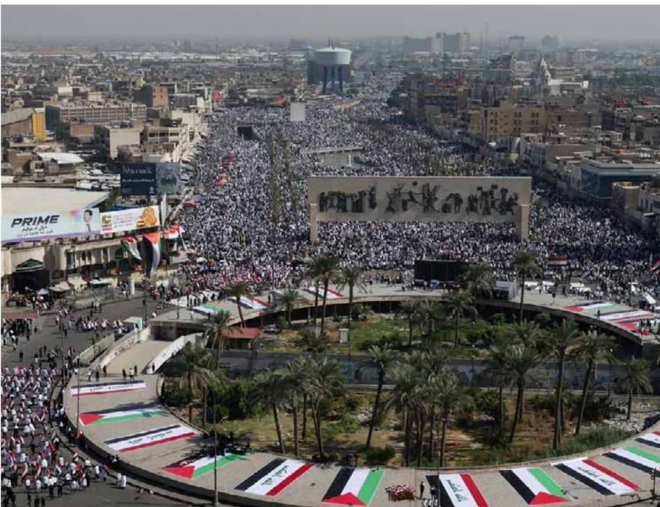
Baghdad, Iraq, Oct. 13, 2023