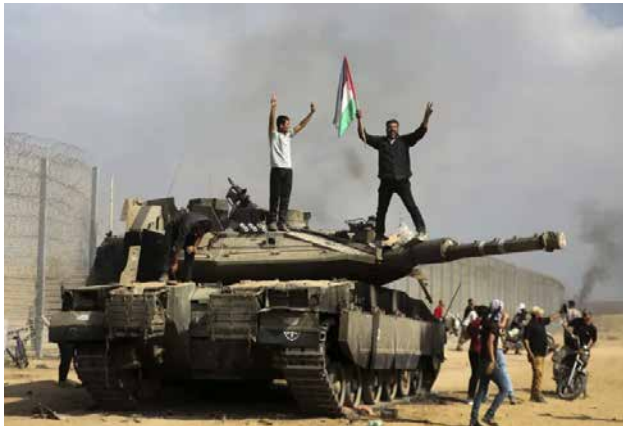
Palestinos capturan un tanque israelí, 7 de octubre de 2023.

El régimen sionista lleva bloqueando Gaza desde 2007,