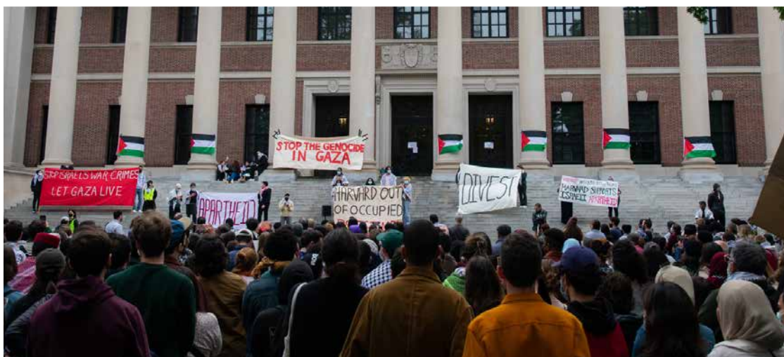
Harvard University, Cambridge, Massachusetts, Oct. 14, 2023