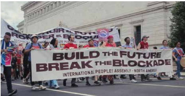
Crece el movimiento para frenar el terror económico de EE.UU. contra Cuba.

Cuba socialista sí ofrece voluntarios médicos entrenados y dedicados que han servido en todos los rincones del mundo donde han ocurrido desastres, a veces arriesgando sus propias vidas. Los trabajadores médicos cubanos han tratado envenenamientos nucleares en Chernóbil, han rescatado a víctimas de terremotos e inundaciones en Pakistán y Haití y han ayudado en la atención a pacientes del COVID-19 en muchos países, entre ellos Italia, en América Latina, el Caribe y África.