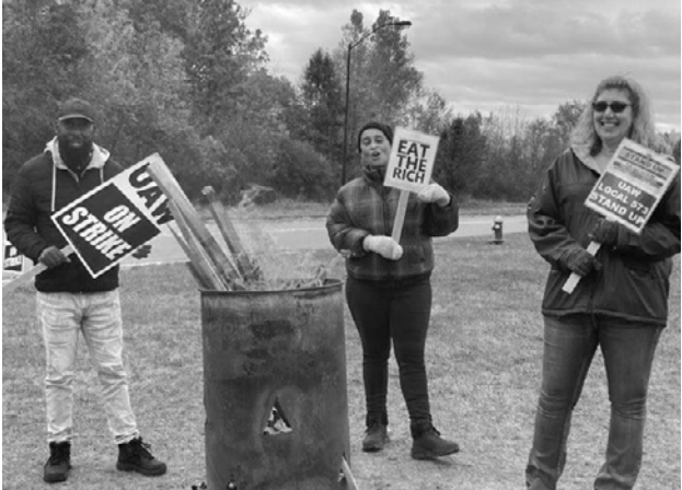
Stellantis strikers outside the parts distribution center in Streetsboro, Ohio, Oct. 15, 2023.

up picket lines. Prior to that Wednesday evening, Fain was announcing every Friday which plants or warehouses, if any, would be joining the strike. Now there is an added element of surprise, making it even harder for Big Three bosses to plan production. Workers at any facility could