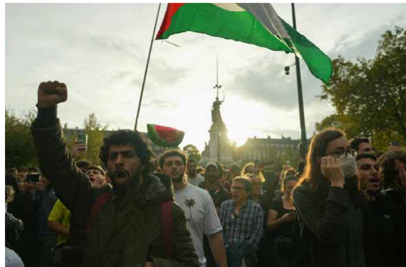
Paris, France, Oct. 12, 2023