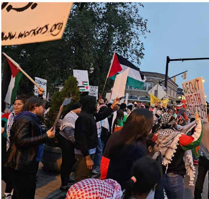
Buffalo, New York, Oct. 13, 2023