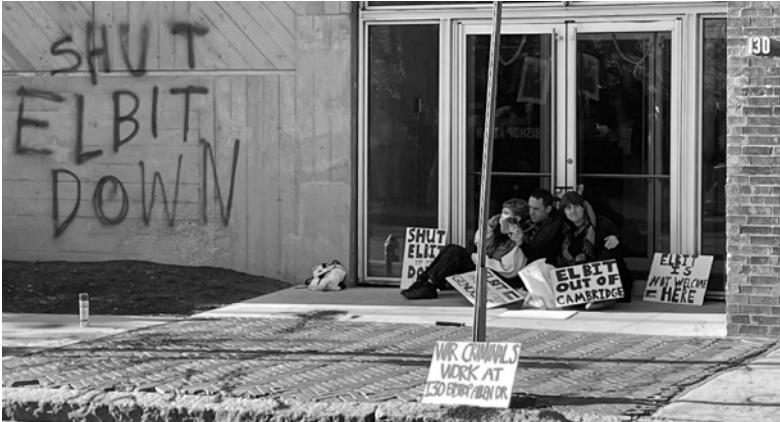
Shut Elbit Down protesters locked down at Elbit Systems’ Cambridge, Massachusetts, front door. Oct. 12, 2023.

The Shut Elbit Down press release, read aloud through a megaphone by locked-down antiwarriors, declared in part: “We are witnessing the most significant Palestinian resistance operation in 50 years. On October 7, Palestinians broke through the colonial border fence that holds 2 million people within the ‘open-air