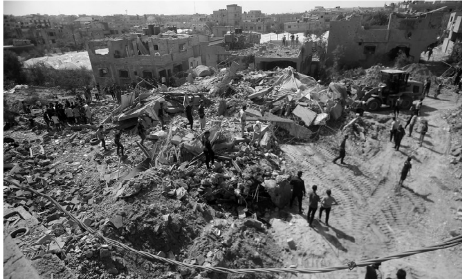
Destruction in Rafah, Gaza, killed 44 families on Oct. 7, 2023.

Israel is now going through its worn playbook, outdoing its already unfathomable cruelty. Defense Minister Yoav Gallant declared, "I have ordered a complete siege on the Gaza Strip. There will be no electricity, no food, no fuel, everything is closed. We are fighting human animals and we will act accordingly." (Times of Israel, Oct. 9)