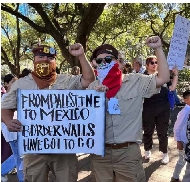
Brown Berets, Houston, Texas, Oct. 14, 2023