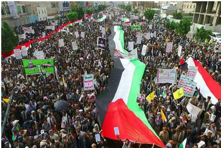
Solidaridad palestina en Sana'a, Yemen, 7 de octubre, 2023.

convirtiendo la estrecha franja en una prisión al aire libre para 2,3 millones de palestinos y en una galería de tiro donde los aviones israelíes bombardean y matan a civiles palestinos, 200 ya este año, incluidos niños.