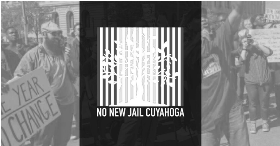
GRAPHIC: CUYAHOGA COUNTY JAIL COALITION

completed, the council has not approved the financing plan for construction costs. A 40-year extension of the sales tax after 2027 is widely unpopular. No new jail! □