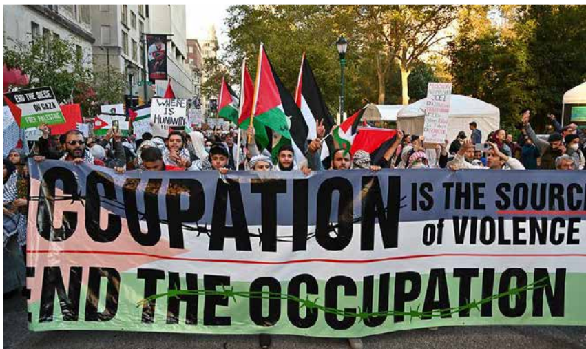
Philadelphia, Oct. 15, 2023