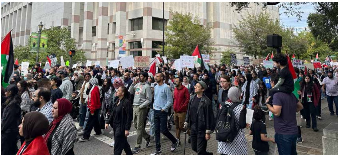
Raleigh, North Carolina, Oct. 15, 2023