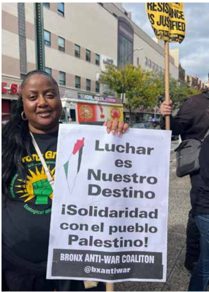
Bronx, Nueva York, 15 de octubre, 2023