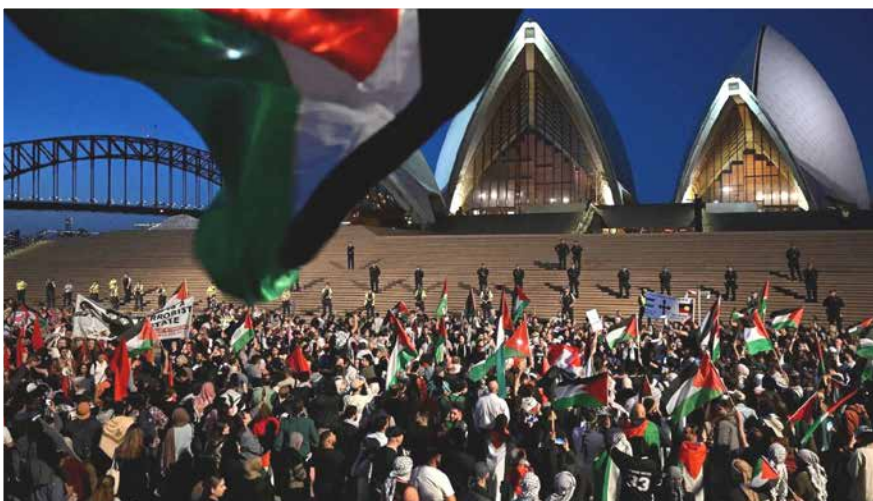
Sydney, Australia, Oct. 9, 2023