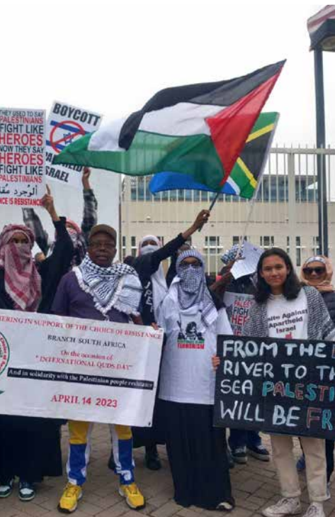
Africa, Oct. 11, 2023