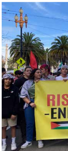
San Francisco, California, Oct. 14, 2023