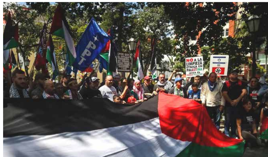
Caracas, Venezuela, Oct. 13, 2023