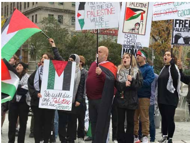
Cleveland, Oct. 13, 2023