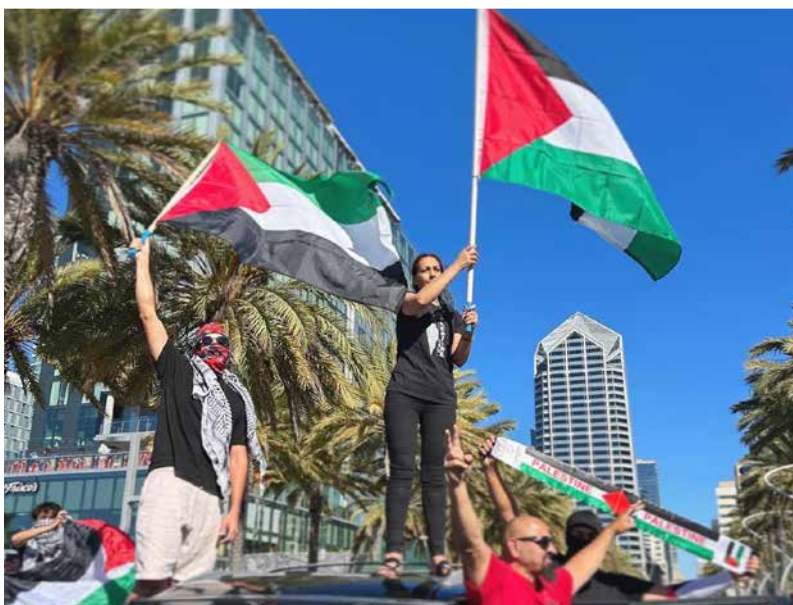
San Diego, Oct. 15, 2023