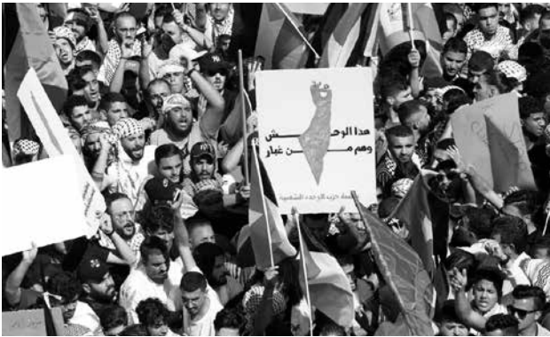
Amman, Jordan, Oct. 13, 2023

This blatant aggression against our people in Gaza resulted in the deaths of more than 770 martyrs, most of them women and children, and the displacement of more than 73,000 people from their homes. The women have lost their children and cannot find their bodies or give them