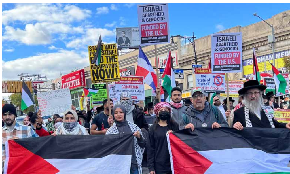
Bronx, New York, Oct. 15, 2023.

Instead of opening talks for the possible exchange of captured Israelis for some of the 5,500 Palestinians held in Israeli prisons, the Israeli regime launched a vicious bombing of civilian targets in Gaza. In just its first week, this assault killed more than 2,300 people — including at least 1,000 children. The air invasion displaced nearly a million people and was in preparation