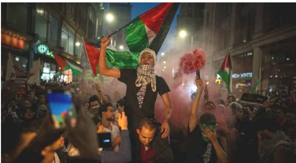
London, England march to U.S. Embassy, Oct. 9