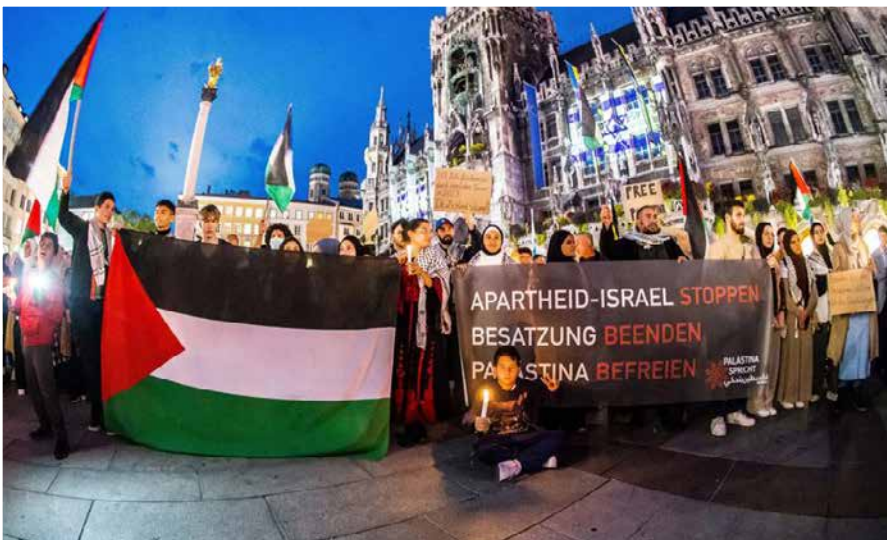
Munich, Germany, Oct. 9, 2023