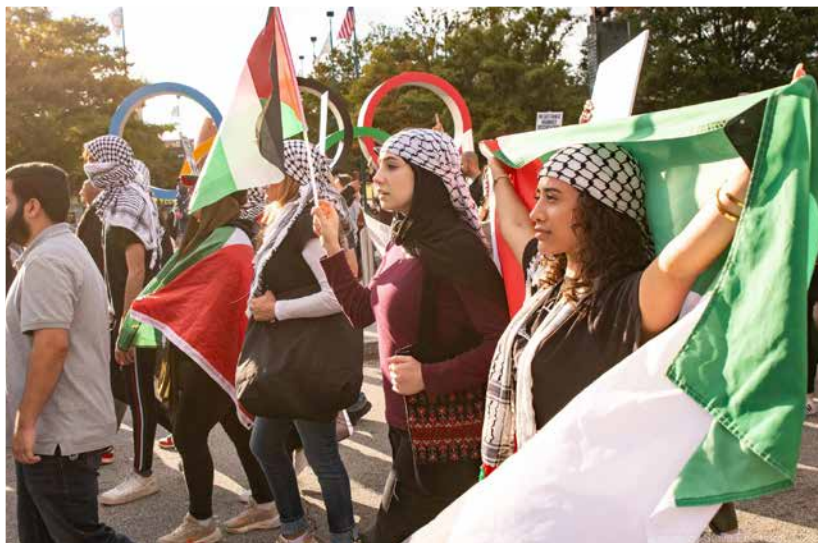
Protesting CNN headquarters in Atlanta, Oct. 14, 2023