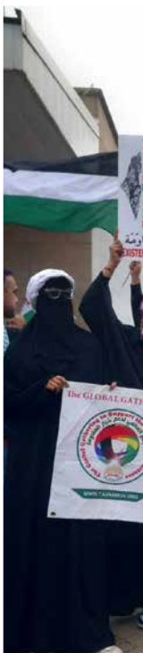
Pretoria, South Africa, Oct. 13, 2023