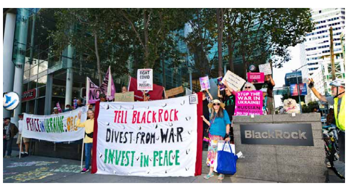
San Francisco, Oct. 4.