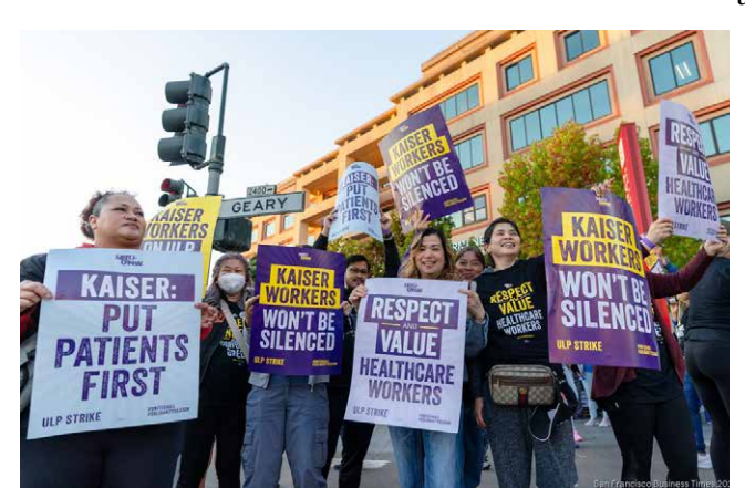
Healthcare workers strike Kaiser Permanente San Francisco Medical Center, Oct. 4, 2023.

However, this current generation of student workers is not standing for it. Across the country, grad students are organizing and forming unions to demand adequate compensation and improved working conditions. Last week, the University of Maine got their wake-up call when the National Labor Relations Board certified that the Maine Graduate Workers Union, part of the United Auto Workers (UAW), won their union election. The union represents 1,000 graduate assistants, research assistants and teaching assistants at the university.