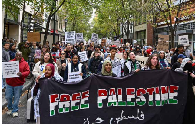
Philadelphia march, Oct. 8, 2023.

from Gaza, it will use the looming bat- ity movement, as much as possible, for tles to attempt to stabilize its hold on what we may face, for what questions we power regarding the struggle internal to the white supremacist Zionist state. world who want justice in It already has begun striking multiple people! □