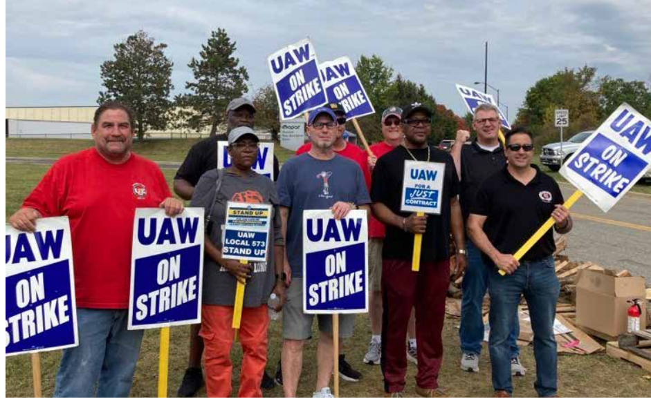
UAW strike, Streetsboro, Ohio, Oct. 5, 2023