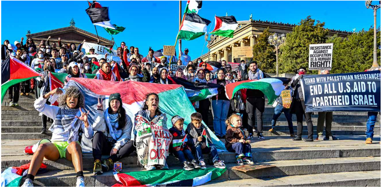
Pro-Palestine protest at Philadelphia marathon, Nov. 19, 2023.

Hamas considers every one of its fighters, along with every adult and child — including the premature babies who died at the hands of the Israeli occupying forces — a martyr. Being Palestinian means that since birth, the Israeli state has viewed every Palestinian, even children,