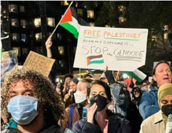
Columbus Circle, New York City, Nov. 10, 2023.