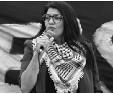
Rep. Rashida Tlaib.

That is deemed irrelevant by a capitalist