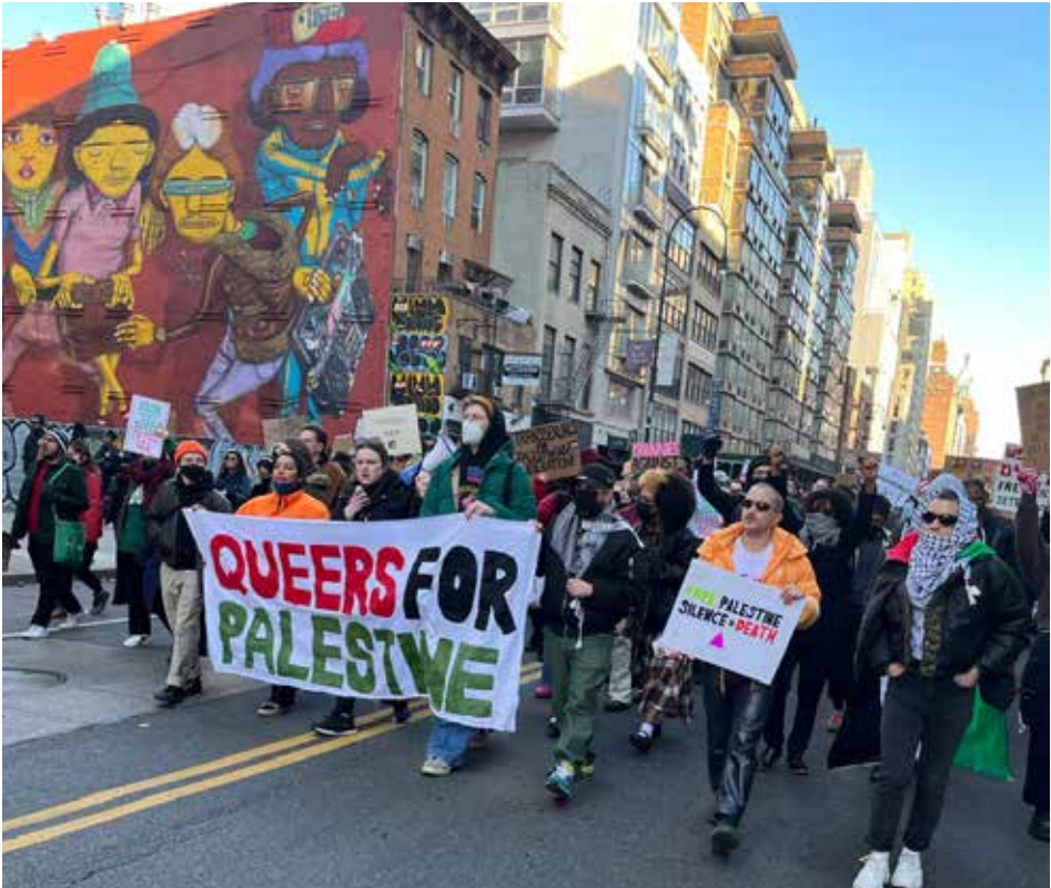
Queers for Palestine march, Nov. 12, 2023.