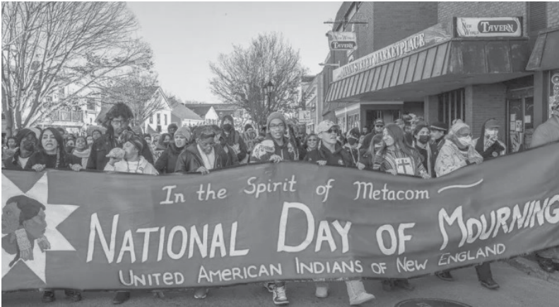
National Day of Mourning lead banner, November 2022

Since the early 1990s, the fund has sponsored workers.org, where news and analysis of global and domestic