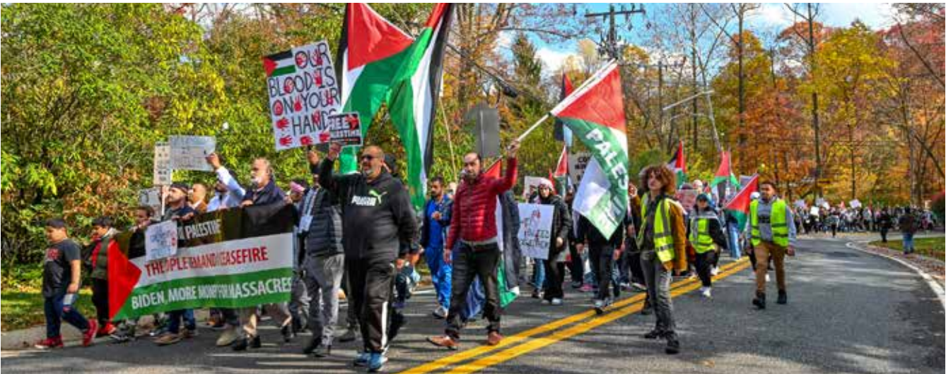
Wilmington, Delaware, Nov. 11, 2023.