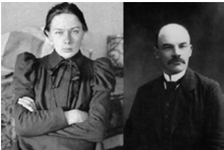
Nadezhda Krupskaya and Vladimir Lenin

Lenin called for the complete equality of men and women to be written into the Bolshevik Party’s program, and it was. The Soviet government codified laws that established the full equality of rights for women and men.