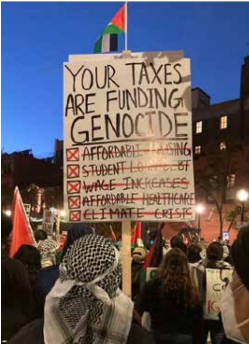
Cleveland, Nov. 9, 2023.

the genocide!” “End the occupation!” and “Free Palestine!”