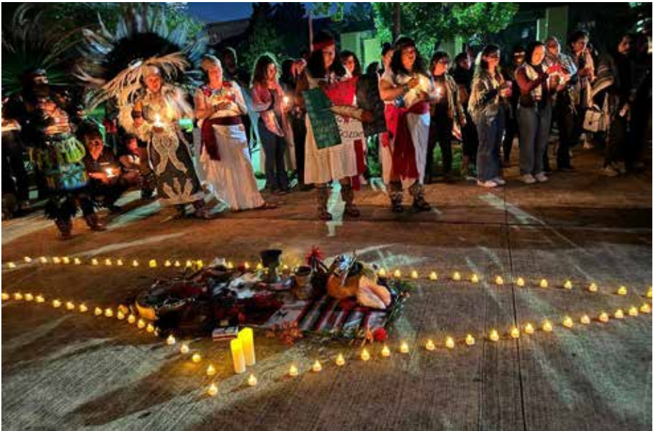
Houston, Nov. 8, 2023.

On Nov. 11, Over 1,000 people — Palestinian, Arab, Jewish, Black and Brown, old and young, of every gender — marched to President Joe Biden’s home in Wilmington, Delaware , to say “Cease-fire now!” “End