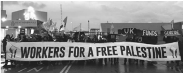
Workers block entrances of a subsidiary of Elbit Systems in Kent, England.

“We fully support these decisions and encourage the government to suspend shipments of Colombian coal and all metals and minerals to Israel as leverage for an immediate cease-fire, as demanded by civil society,