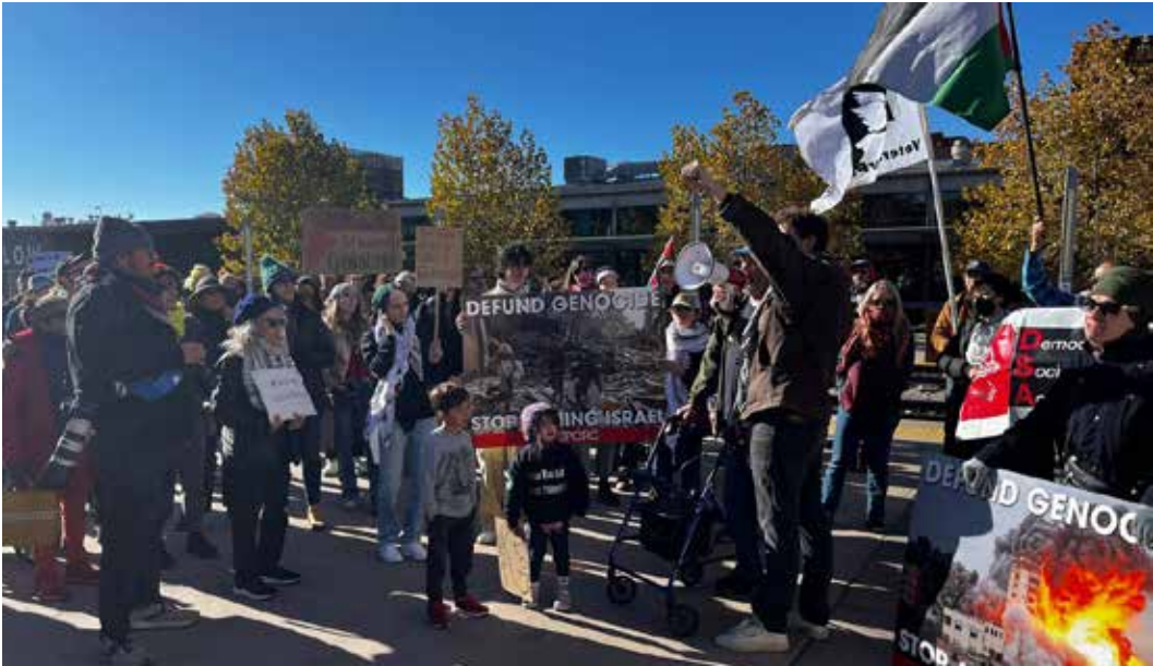
Santa Fe, New Mexico, Nov. 11, 2023.