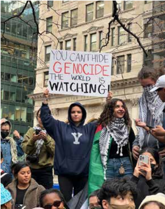
Bryant Park, New York City, Nov. 9, 2023.

oppressed and displaced. (theDP.com, Nov 9) The Palestinian Youth Movement and Indigenous and Chicano activists in Houston organized a joint event for the Day of the Dead Nov. 8 entitled “Pray for Palestine: Indigenous Solidarity / Raza Con Gaza.” A candle-light vigil at Guadalupe Plaza was filled with Palestinian flags, singers and poets. Prayers were said in English, Spanish, Hebrew and Arabic.