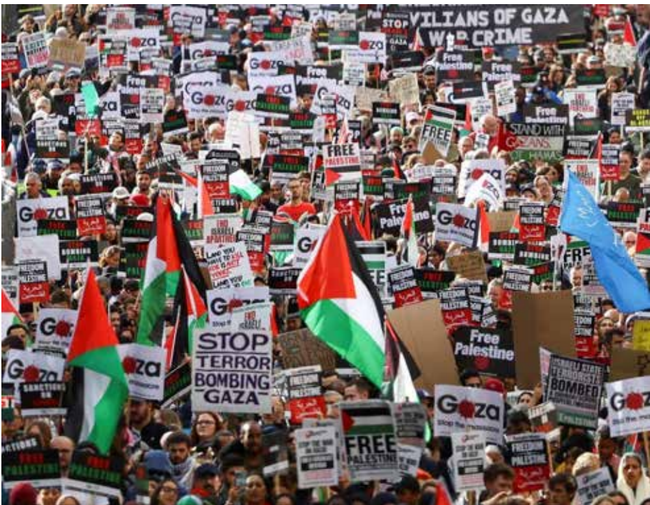
100.000 manifestantes a Londres, el 21 de octubre de 2023.

Estos ataques terroristas provocaron un cambio en la táctica de las fuerzas de liberación, que consideraron que no tenían otra opción que organizar un brazo armado de la lucha contra el apartheid para combatir con la fuerza tanto por la supervivencia como por el cambio social. Esta importante decisión se tomó en el entendimiento de que cualquier