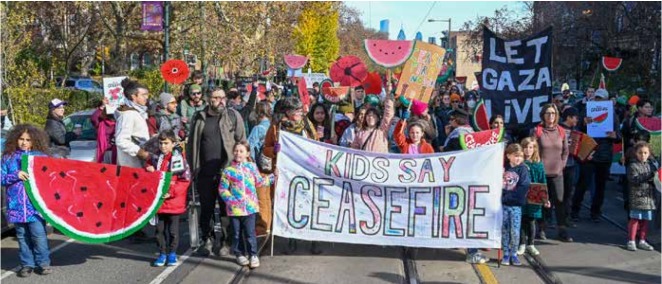
Philadelphia, Nov. 12, 2023.