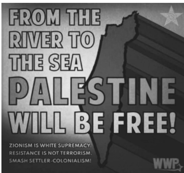
WW GRAPHIC: ARJAE RED

From the river to the sea, Palestine will be free! □