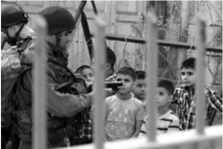
Imprisoned Palestinian youth

of prisoners in jails by the occupation authorities continues with international cover and silence. The insistence of the International Red Cross and many international organizations concerned ignore the reality of these conditions and their excuse that the occupation prevents them from visiting the prisoners and learning about their conditions is an argument against them, not for them, confirming