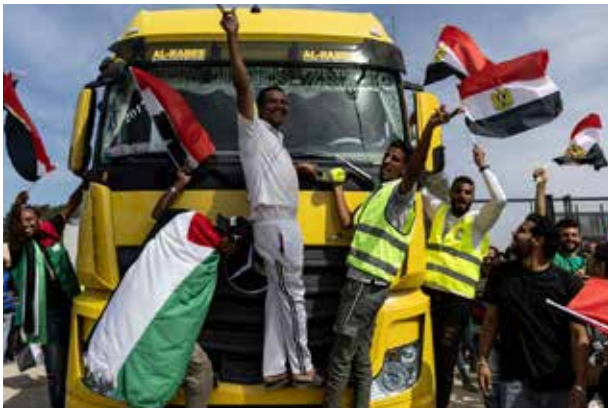
A truck with humanitarian aid destined for Palestine at the Rafah border.

Water, food, fuel and medical supplies have been cut off, with only a trickle of aid trucks making it through the Rafah crossing. The healthcare sector has completely collapsed, either through direct Israeli bombing or from lack of medicine and electricity to treat patients. Israel's targeting of civilians