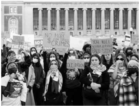
Columbia Univ. students rally for Palestine, NYC, Oct. 12, 2023.

Simply because the university allowed the Festival to proceed, a big donor from the Estée Lauder corporation and a private equity billionaire have tried to use their money’s power to punish the university and determine its policy, even about which professors are hired. Estée Lauder, by the way,