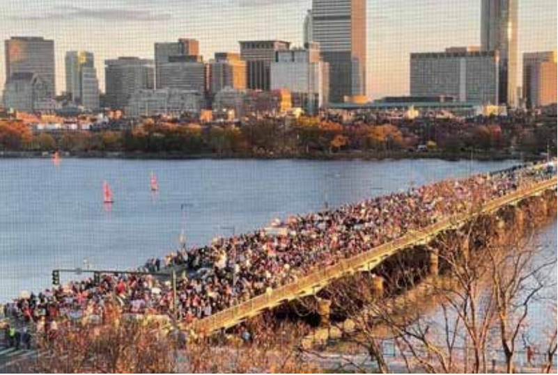
Occupying the Massachusetts Avenue Bridge, Nov. 12, 2023.