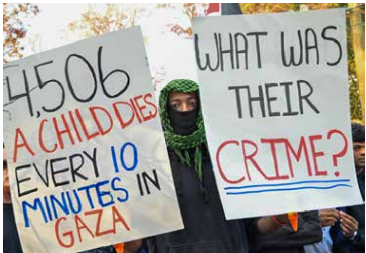
Protest at the residence of President Biden, Wilmington, Delaware, Nov. 11, 2023.

Stop Israel's genocidal war on Gaza Now! Open the Rafah border Now! □