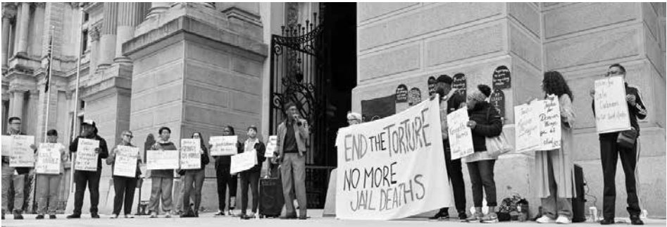
Philadelphia rally, Sept. 28, 2023.

of those incarcerated, as well as public defenders, community members, and prisoners’ rights advocates. It has also caused a series of uprisings by prisoners themselves.”