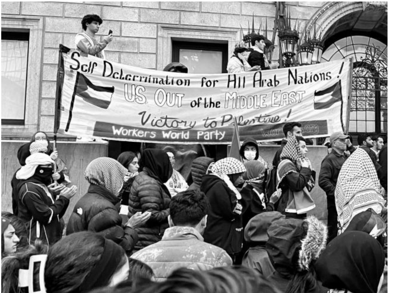
Boston, Oct. 17, 2023

At this moment, the heroic uprising in Gaza, the West Bank, including Jenin and other areas in the Occupied Territories in Zionist Israel that began on Oct. 7 has taken the global center stage on the question of violence. This righteous struggle is on the front lines of challenging imperialism in the region and the world. It has been over 75 years since the settler colonial state of Israel was