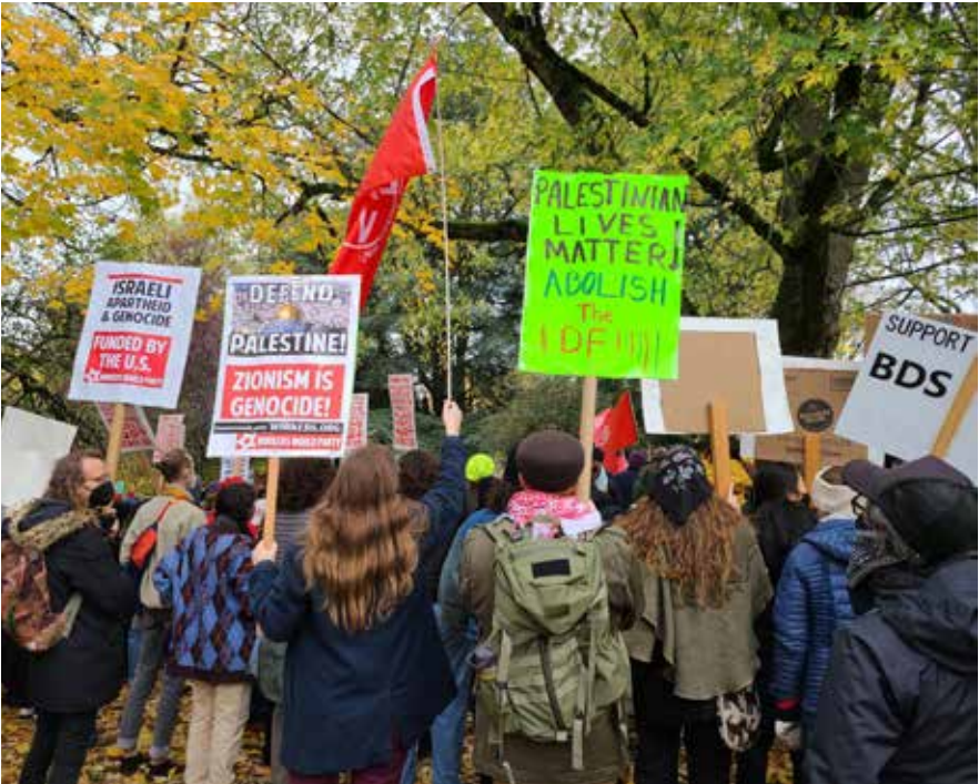
Portland, Oregon, Nov. 11, 2023.