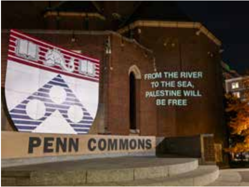
Philadelphia, Nov. 8, 2023.

There has been no letup in the mass movement to stop the Zionist genocide in Palestine. Here are but a few examples of the explosion of mass protest which have taken place since Oct. 7. On Nov. 8 at UPenn Commons in Philadelphia , light projection of pro-Palestine slogans raised a critical question that University of Pennsylvania President Liz Magill had to answer. Which side is she on — genocide and Zionist apartheid or cease-fire and an end to the occupation of Palestine?