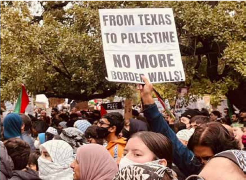
Austin, Texas, Nov. 12, 2023.