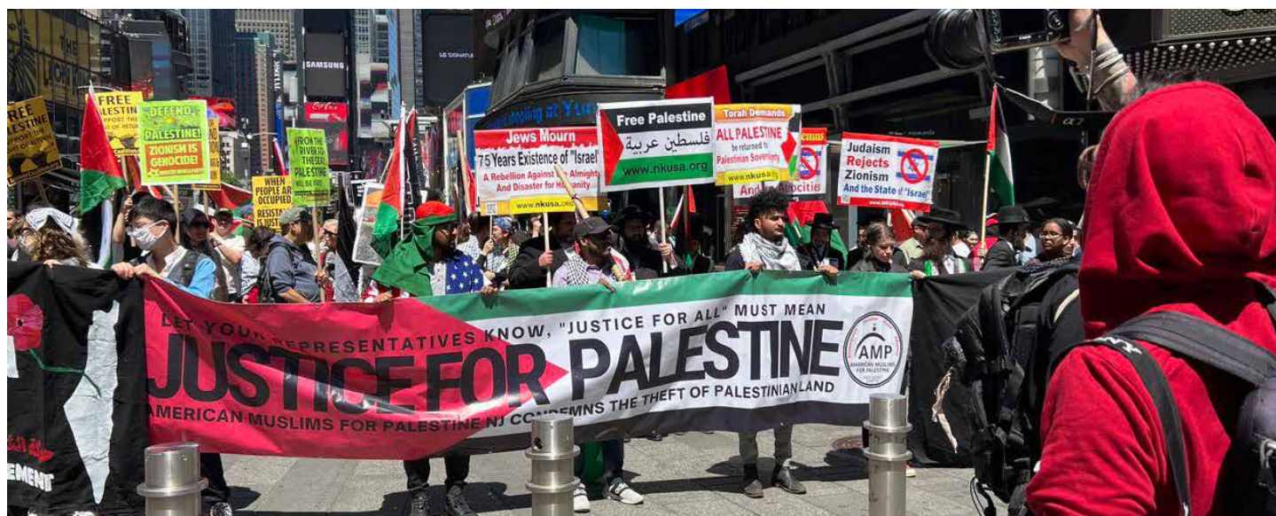
New York City, May 14, 2023.