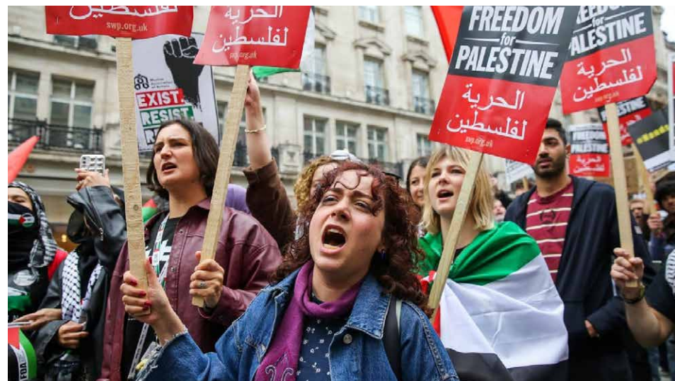
London, May 13, 2023.

In London on May 13, thousands of people were in the streets demanding an end to apartheid and occupation in Palestine. The march began in front of BBC headquarters and ended at the office