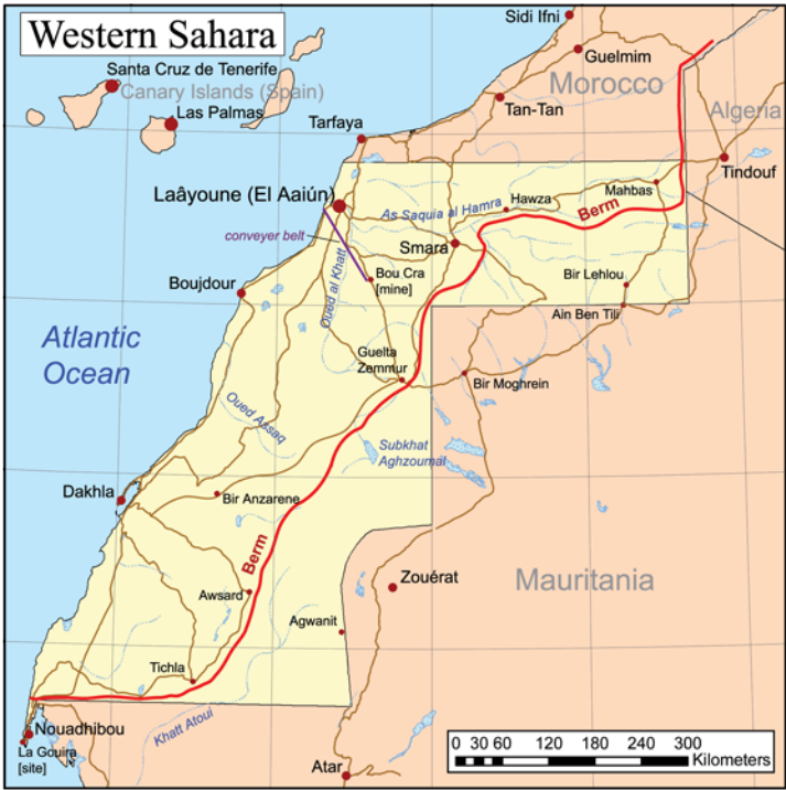
MAPA: KMUSSE (COMMONS.WIKIMEDIA.ORG/W/INDEX.PHP?CURID=1621025)

Los fuertes golpes armados sufridos por el ejército de ocupación español fueron mostrando la justeza de la lucha emprendida. En esas condiciones, la delirante dictadura franquista comenzó a buscar una “salida honrosa” a la situación creada. En esa medida, -con la actitud propia de las potencias coloniales- España se dio a la tarea de crear un gobierno autóctono “independiente” que funcionara bajo control de Madrid.