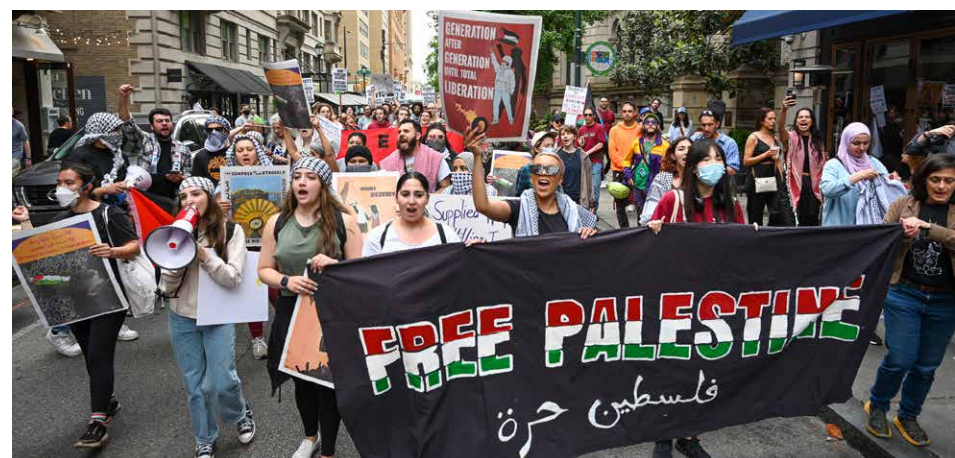
Philadelphia, May 13, 2023.