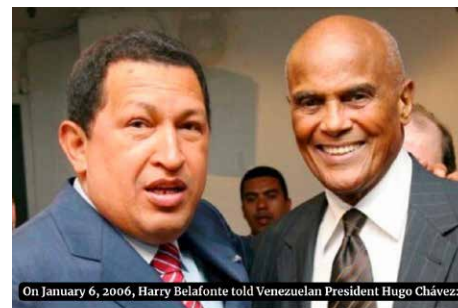
On January 6, 2006, Harry Belafonte told Venezuelan President Hugo Chávez:

Belafonte told Chávez during a TV and radio broadcast: “No matter what the greatest tyrant in the world, the greatest