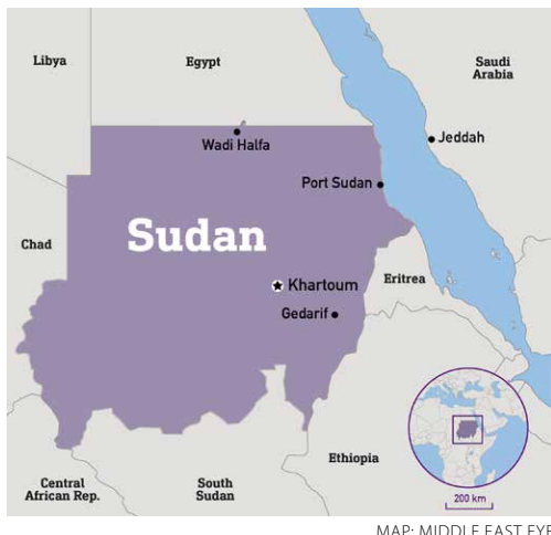
Sudan borders seven other African countries and the Red Sea.

These analyses omit the role of the major imperialist powers in the region and their local client states. Involved up to their necks are U.S. imperialism and its junior partner Britain, which was once