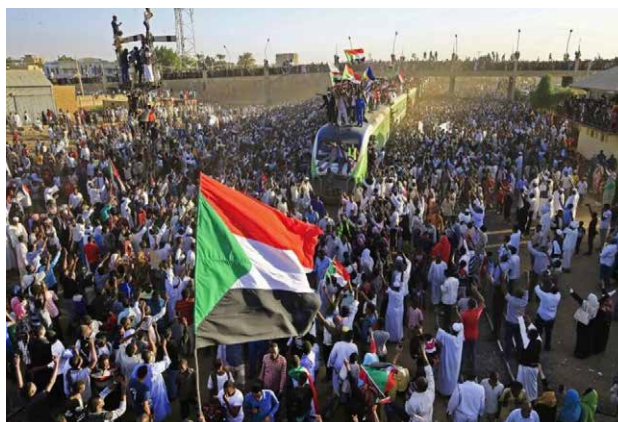
Jartum, Sudán, diciembre de 2022. Grandes manifestaciones conmemoran el cuarto aniversario de la revolución de 2018. El movimiento popular vive.

En este sentido, tenemos la intención de acordar un mecanismo común para seguir la evolución de la