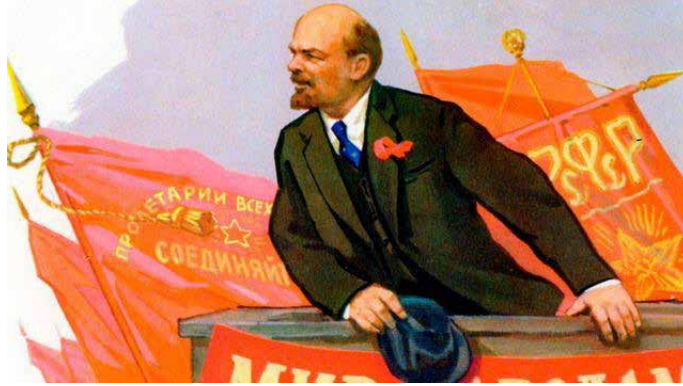
Vladimir Ilich Lenin

Los que sobreviven sólo vendiendo su trabajo son trabajadores, incluso en las industrias en las que es difícil nombrar a tu jefe. Pero la cosa no acaba ahí. Las trabajadoras del sexo, los trabajadores encarcelados y las personas con discapacidad pertenecen a la clase trabajadora, al igual que quienes crían niños o cuidan de familiares