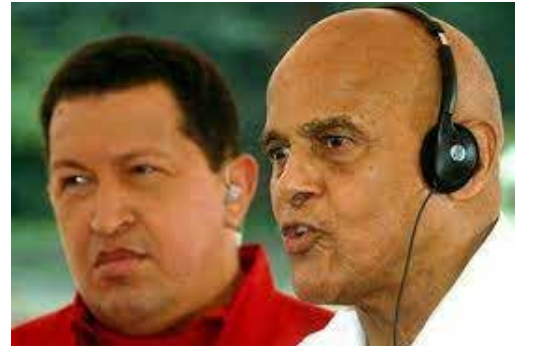
Hugo Chávez y Harry Belafonte, ¡presente!