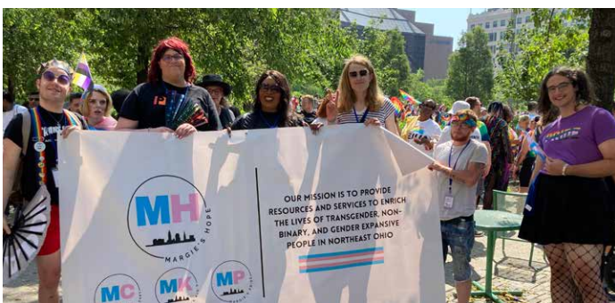
Cleveland Pride, June 3, 2023.

Many marchers carried pro-abortion access signs that called on marchers to