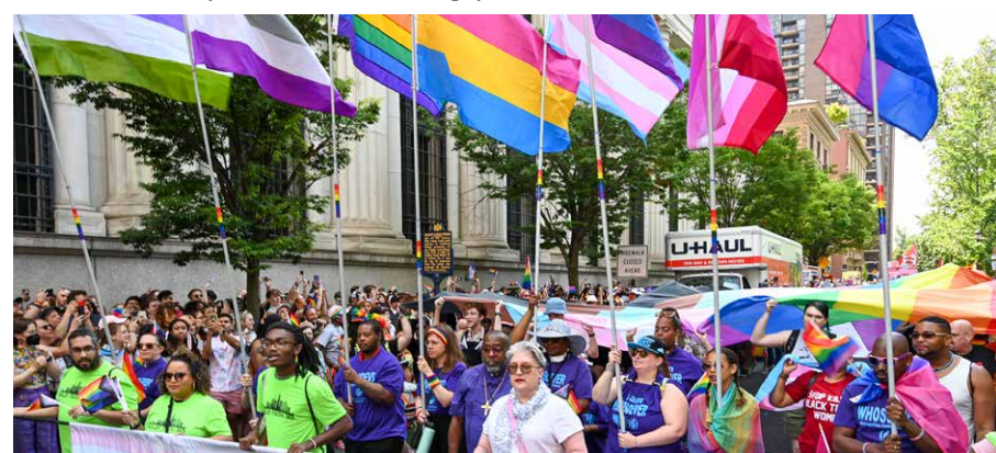
Philly Pride 2023.

While celebrating Pride, rally speakers addressed the continued attacks on LGBTQ2S+ people and their rights by right-wing groups across the country. Rally organizers urged solidarity and attendance at protests denouncing a scheduled gathering of the national bigoted, anti-LGBTQ2S+ group “Moms for Liberty” in Philadelphia at the end of June. □