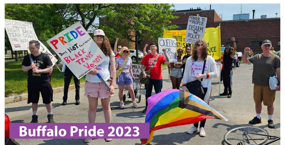
People's Pride Bloc marched in the Buffalo, New York, Pride Parade June 4, demanding no more cops or banks at Pride, smash rainbow capitalism and defend trans youth by any means necessary. □

They have reason to worry. Stop Cop City! □