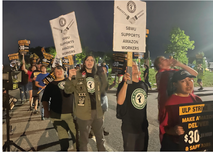
Starbucks Workers United solidarity delegation leads chants at daybreak in Norwood, Massachusetts, July 8, 2023.

Instead of bargaining with the workers, Amazon CEO Jeff Bezos — on and off the top of lists of the world's wealthiest capitalists — canceled the contract with BTS. The company is one of 3,000 sub-contracted "Delivery Service Partners" which