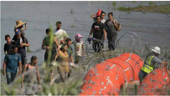
Migrants trying to enter the U.S. from Mexico are confronted by large razor-wired buoys used as a border barrier along the banks of the Rio Grande in Eagle Pass, Texas, July 11, 2023.

Under pressure from 800,000 young undocumented