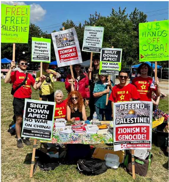
Workers World delegation opposes APEC summit.

On the second day, the Summit mobilized people for a rally in Cal Anderson Park and then marched to the Seattle Convention Center Summit building to confront