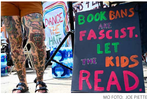
Protesta contra la llamada ‘Madres por la Libertad’ en Filadelfia, 2 de julio de 2023. La pancarta: ‘La censura de libros es fascista. Dejen leer a los niños.’