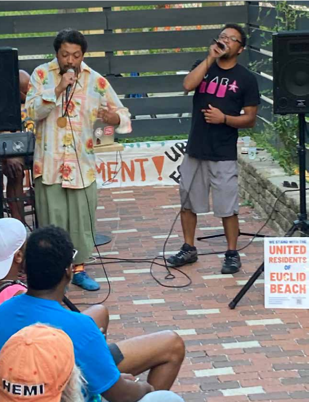
Muamin Collective, Aug. 4, 2023

With love, not fear, this is Mumia Abu-Jamal. □