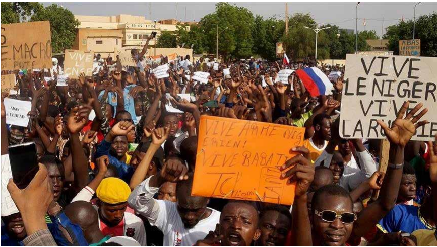
Thousands of Nigeriens demand the withdrawal of French and other foreign troops, Niamey, Niger, Aug. 3, 2023.

In addition to 1,500 French troops, there are over 1,000 U.S. troops stationed in Niger, which the U.S. government now refuses to withdraw, despite the security agreements between the U.S. and Niger being suspended