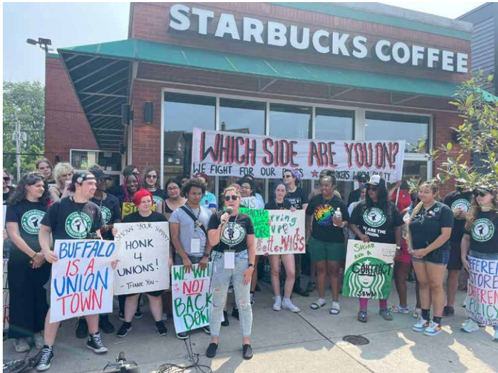
Starbucks workers and community members picket outside the first union store in Buffalo, N.Y., July 26, 2023.

A genuine desire for decent compensation and security will invariably be opposed by corporation owners and those of the ruling strata. Members of the working class must join together and support this strong drive by organized labor. □