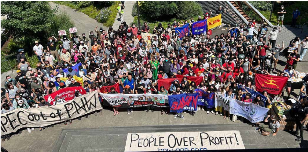
People's Summit delegation, July 29.

The People’s Summit had over 350 people in attendance and was sponsored by nearly two dozen groups. Organizers included Anakbayan USA, BAYAN Seattle, Oregon People Organizing for Philippines Solidarity, International Women’s Alliance and more. One of the major themes that emerged from the conference was the need for a united front amongst those fighting injustices created by capitalism and imperialism.