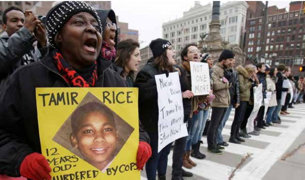
Clevelanders protest Nov. 25, 2014, three days after police murder of Tamir Rice.

The program drew activists from around Cleveland