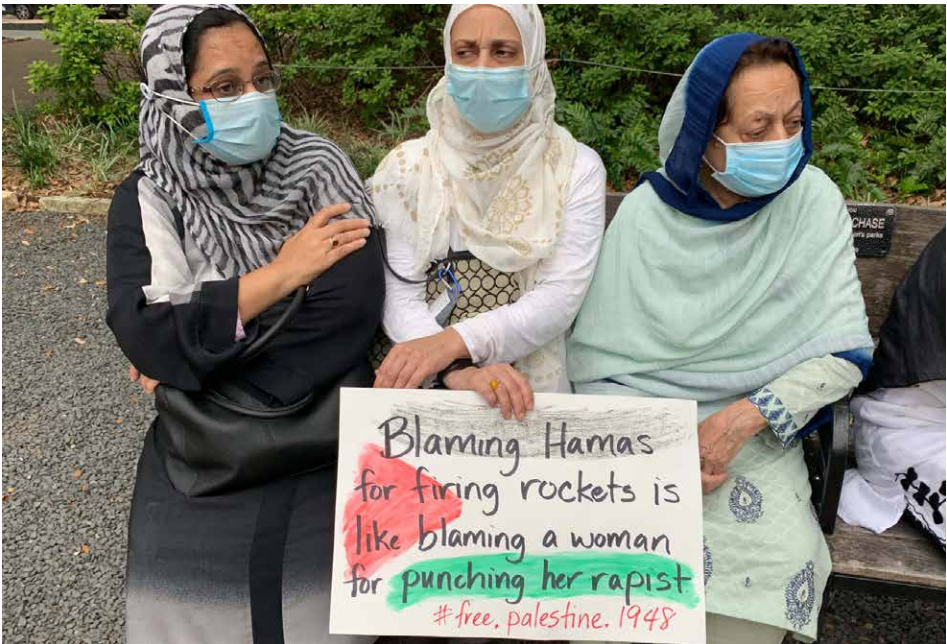
Thousands gather in Houston in support of Palestinians, May 15.