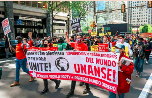
May Day, Philadelphia, 2021.

Our newspaper is partisan. Our coverage lauds struggles by the global working class against capitalist exploiters. WW sides with the multinational,