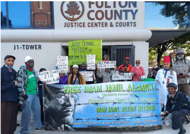
In front of Fulton County Courthouse, May 7.