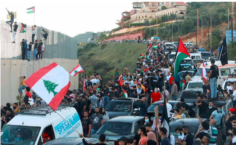
At the Lebanese-Israeli border.