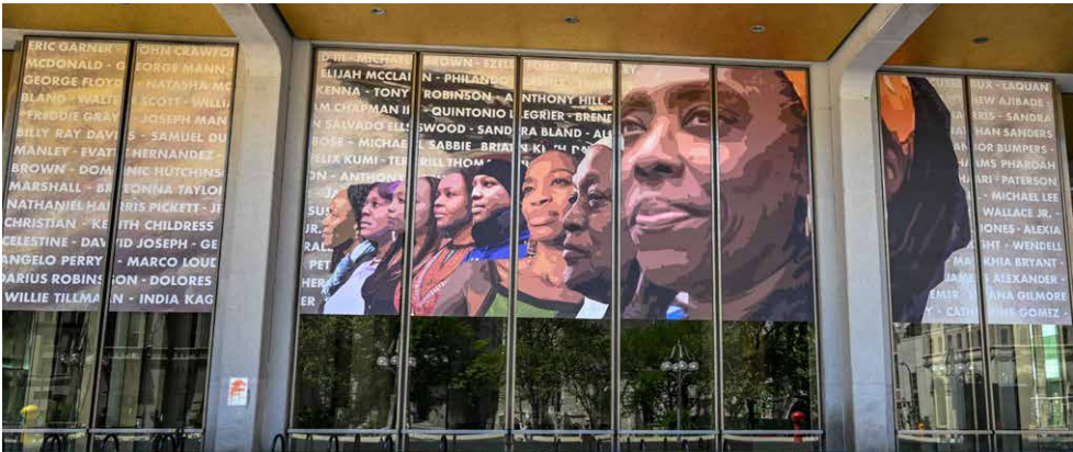
“Crown: Freedom” adorns wall of Municipal Services Building in Philadelphia.

Artist Russell Craig designed “Crown” as a response to last summer’s protests against police brutality. It is a tribute to the ongoing fight to end systemic racism and inequality. The first mural in the series was dedicated in August 2020. It is a photomontage of people of all ages, nationalities and genders, with their fists raised and masks on their faces arranged