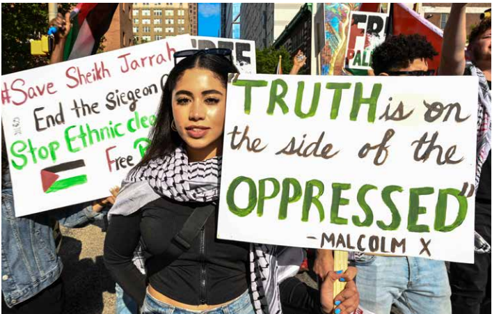
Palestinian solidarity protest in Philadelphia, May 15.