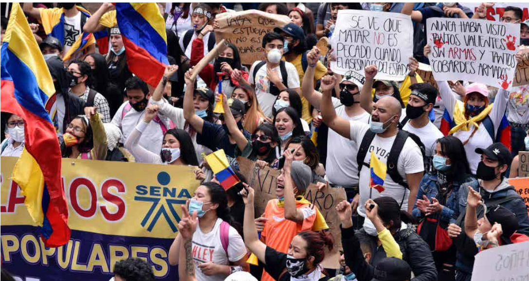
Demonstrators in Bogotá, Colombia participate in the national strike that began April 28.

We call on all the military and police forces to stop massacring their people — do not let yourselves be used