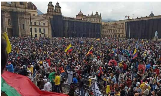
Primer día de huelga general en Colombia, Bogotá, 28 de abril