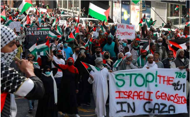
Capetown, South Africa.