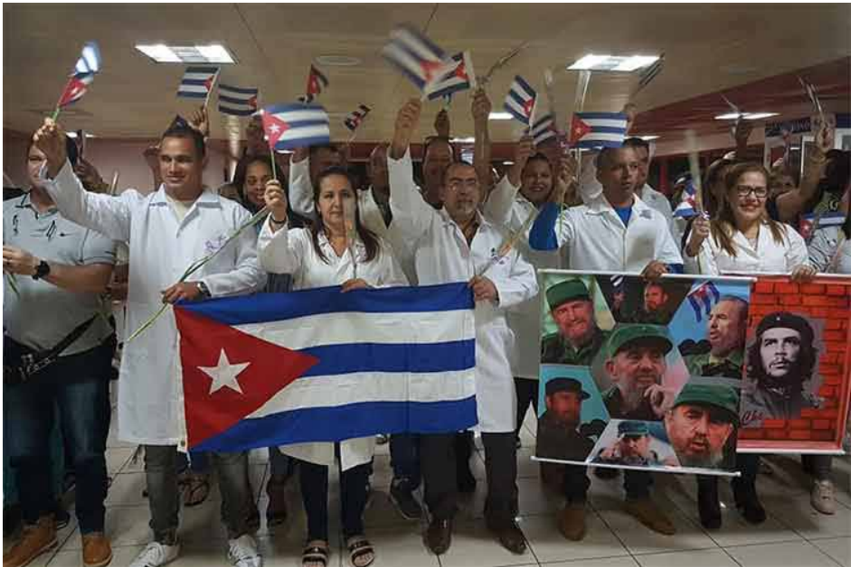
Cuba dispatches doctors to coronavirus-ravaged Italy.