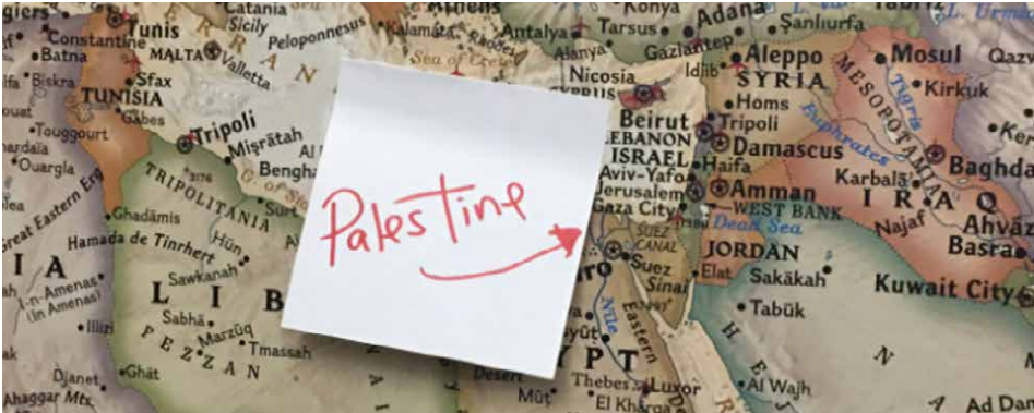
A post-it on the map in Rep. Rashida Tlaib's Washington office.

Rep. Tlaib, a daughter of Palestinian immigrants whose grandmother still lives in occupied Palestine, was joined by nine other House members. “It is a conflict where one country, funded and supported by the United States government, continues an illegal military occupation over another group of people,” said Rep. Ilhan Omar of Minnesota. Reps. Omar and