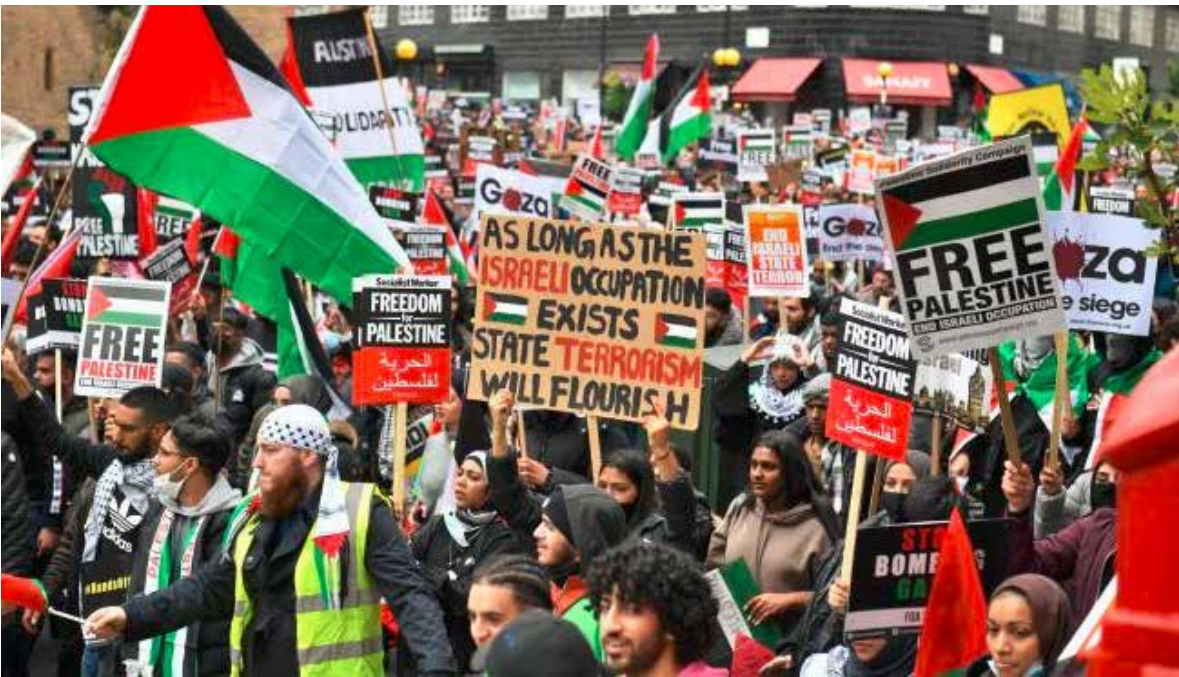
Solidarity protests took place around the world. Here in Scotland, May 15. More on pages 6, 8.