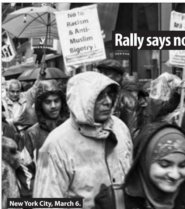
New York City, March 6.

There is great resistance to making even cosmetic concessions to the mass movement, not only from the rulers of Yemen and Bahrain, but also from those in Saudi Arabia. The royal family there has already banned any manifestation whatsoever of opposition forces. □