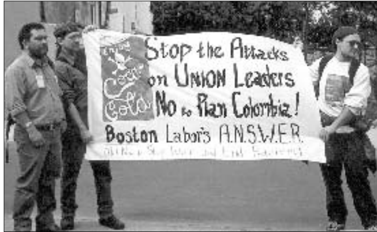
Boston unionists on solidarity delegation.

International delegates who addressed the tribunal said what impressed them