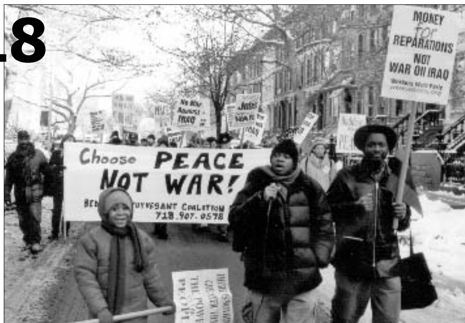
Anti-war march through Brooklyn's Bedford-Stuyvesant community.