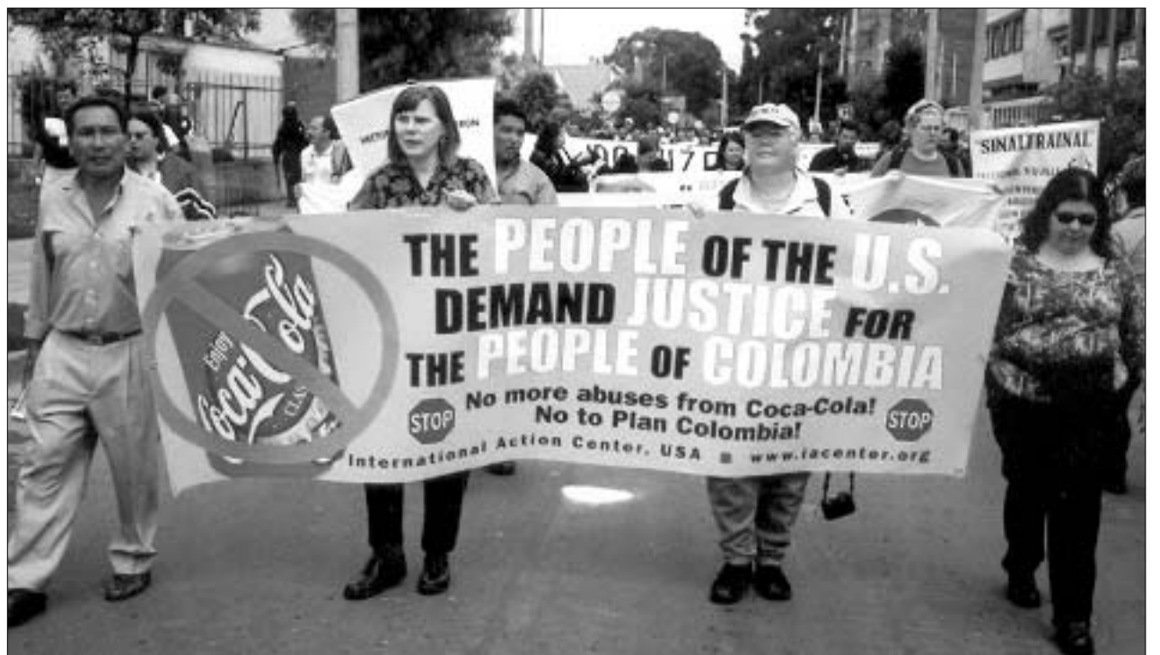
Solidarity delegation marches with Coca-Cola workers in Bogotá.