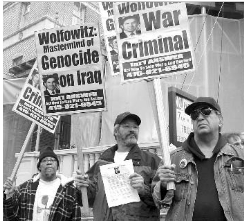
San Francisco protest against visit of warhawk Paul Wolfowitz

An important initiative took place in a predominately African American and Caribbean community in the heart of Brooklyn when local residents formed the Bedford-Stuyvesant Coalition for Peace and held their first march and rally on Dec. 7. Anti-war marchers carried signs that