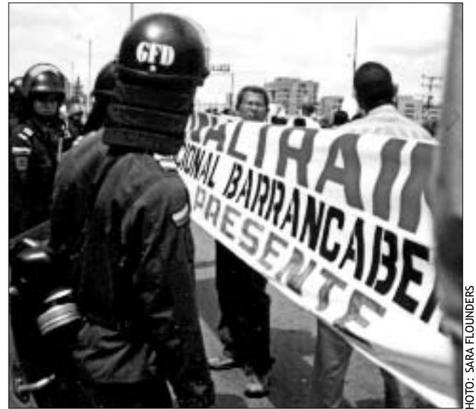
Colombian police try to surround Sinaltrainal members.

One union leader was arrested along with two others in a Coca-Cola plant and accused of terrorism. The three were held for six months; no charges were ever filed