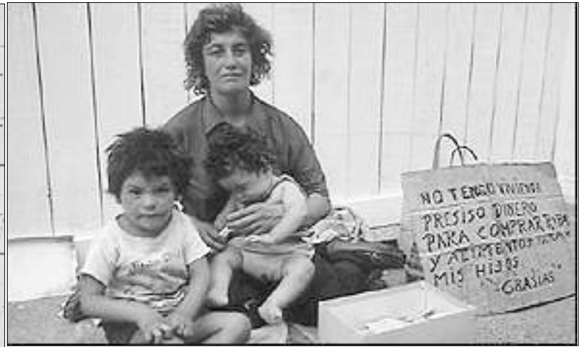
Sign reads: "I don't have enough money to buy clothing and food for my children"

And what was all this pain supposed to accomplish? It was supposed to get capitalist exploitation going again.