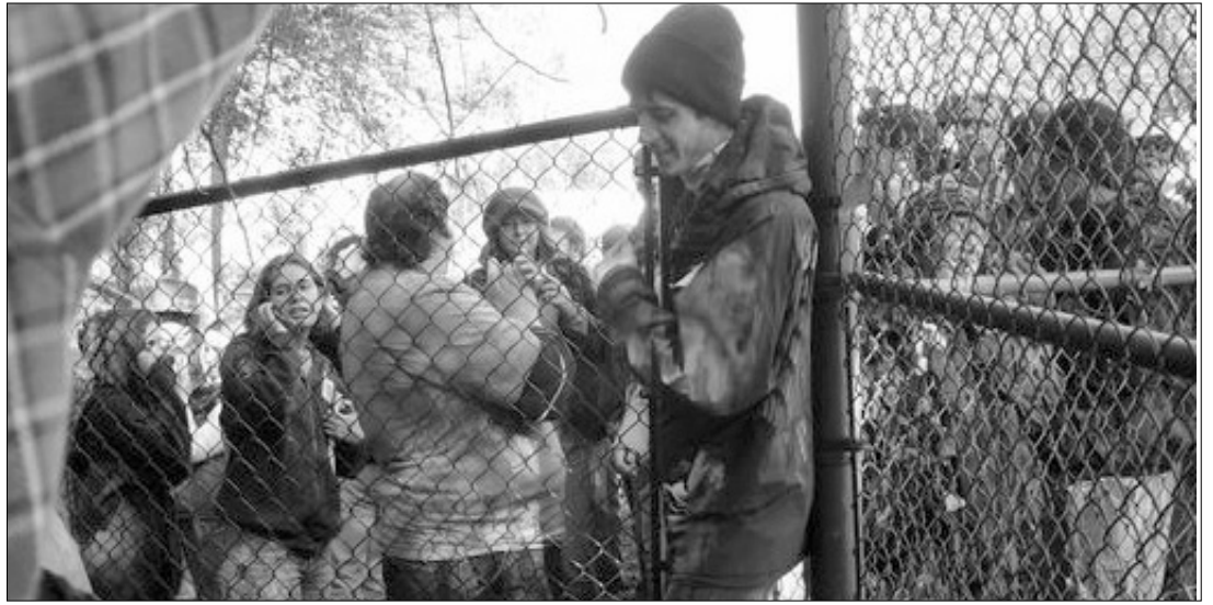
At Fort Benning, 95 got past fence and were arrested.