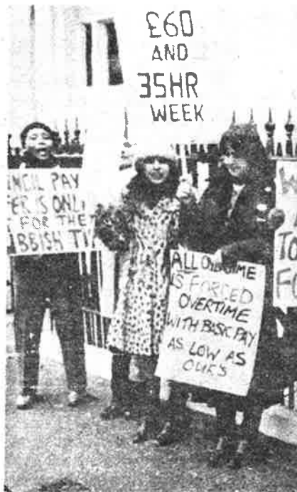
"Low pay is robbery," say British workers.