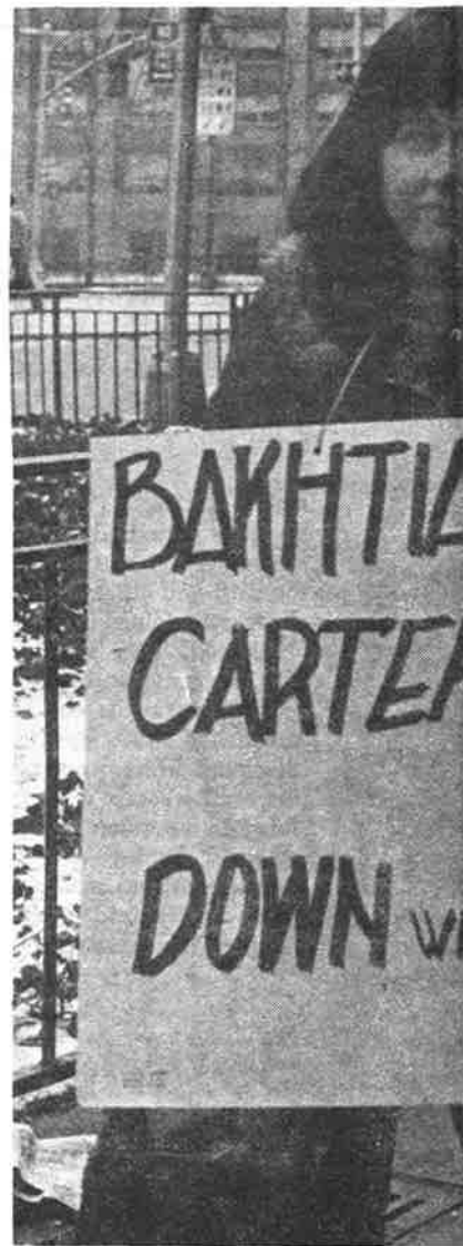
Iranian Students demonstrate against the Shah on Jan. 19 in New York City.