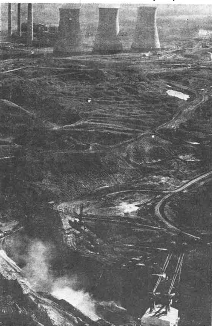
This is stripmining. Missouri Indians are fighting federal plans to hand over even more of their lands and resources to the corporations for industrial use.

COLORADO SPRINGS, Jan. 13—Over 200 people marched in sub-freezing weather here to protest the recruiting drive in Colorado of David Duke, Imperial Wizard of the Knights of the Ku Klux Klan. Even though the bourgeois media repeated his public relations garbage of building a "new image" of the Klan, the marchers in Colorado Springs were not fooled. They recognized his calls for "voluntary separatism" and his attacks on affirmative action as the same vicious racism the Klan has always been noted for.