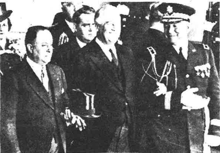
The Somoza regime in Nicaragua has been kept in power by its friends in the White House. Above, Anastasio Somoza, Sr., father of the current dictator, with Roosevelt and Eisenhower.

Though many lives have been lost in the decades of struggle to rid Nicaragua of the Somozas and of U.S. domination, these lives will not have been lost in vain as the Sandinista guerrillas step up the struggle against Somoza's tyranny. Reports in the Jan. 17 New York Times quote FSLN guerrillas as saying that their organization has recently successfully expropriated several military arsenals of Somoza's National Guard and is "distributing arms to the people."