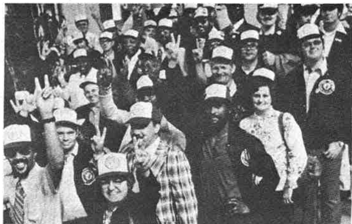
Newport News shipyard workers celebrate their union election victory last year.

In a blatant attempt to prolong this intolerable state of affairs, the company has gone into federal court to appeal charges made by the NLRB that it has refused to bargain in good faith. Such a