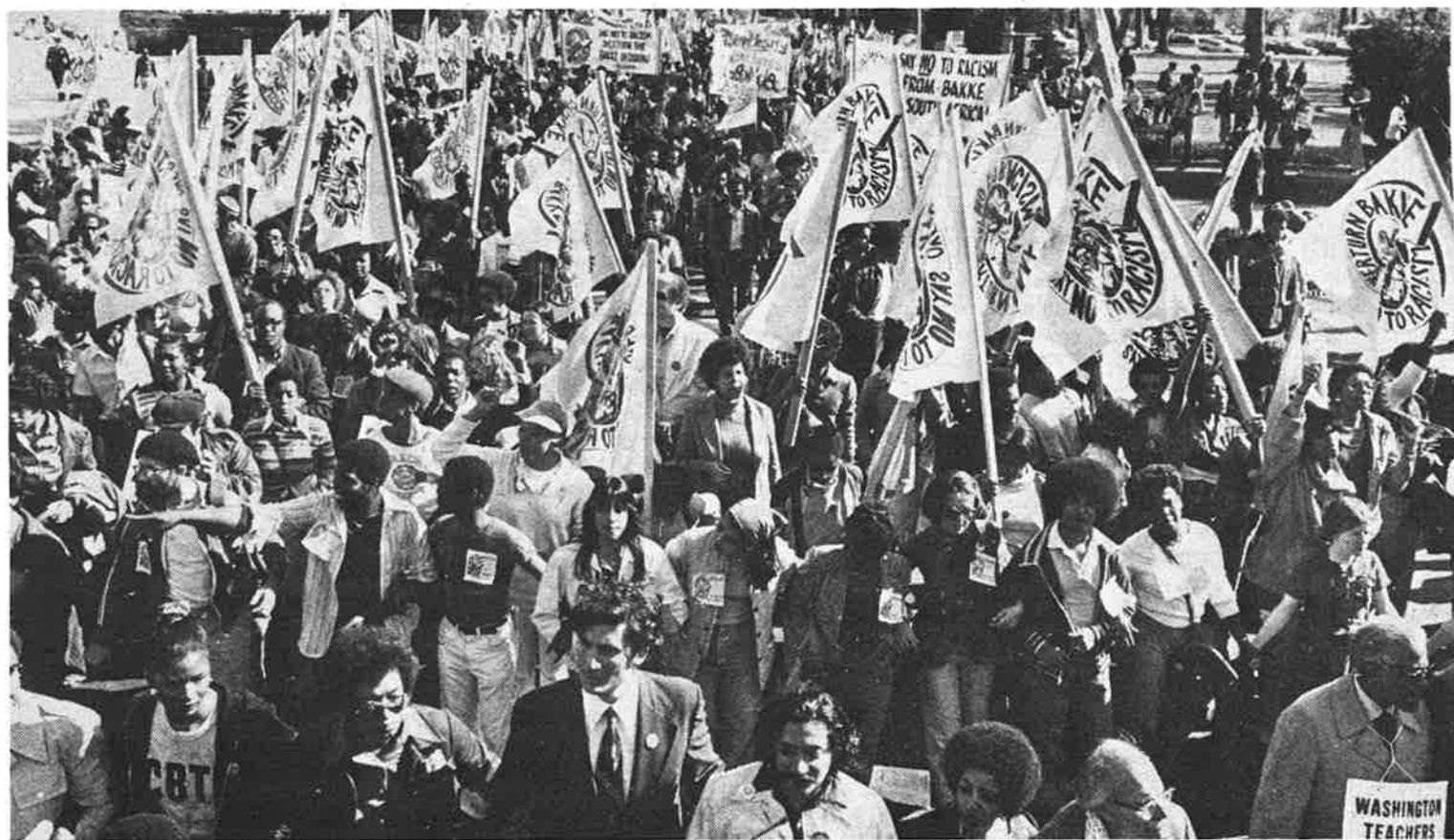
"Beat back Bakke!" Participants in the historic April 15, 1978, march in Washington, D.C., in defense of affirmative action.

Through the suit, which the U.S. News & World Report called "the most massive assault to date on federal regulations," Sears bosses seek to enjoin the government from enforcing equal employment guidelines. Sears is concealing its racist motives