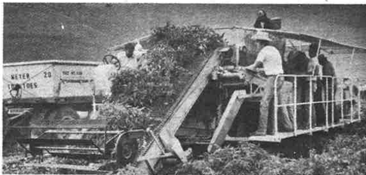
Mechanized tomato harvester. Business Week [Jan. 30] reports that "with a $55,000 harvester, a grape grower cuts his crew from 40 men to 2."

Of course with greater productivity bosses can pay fewer workers to produce the same or even more. And that is why they are so attached to the idea of