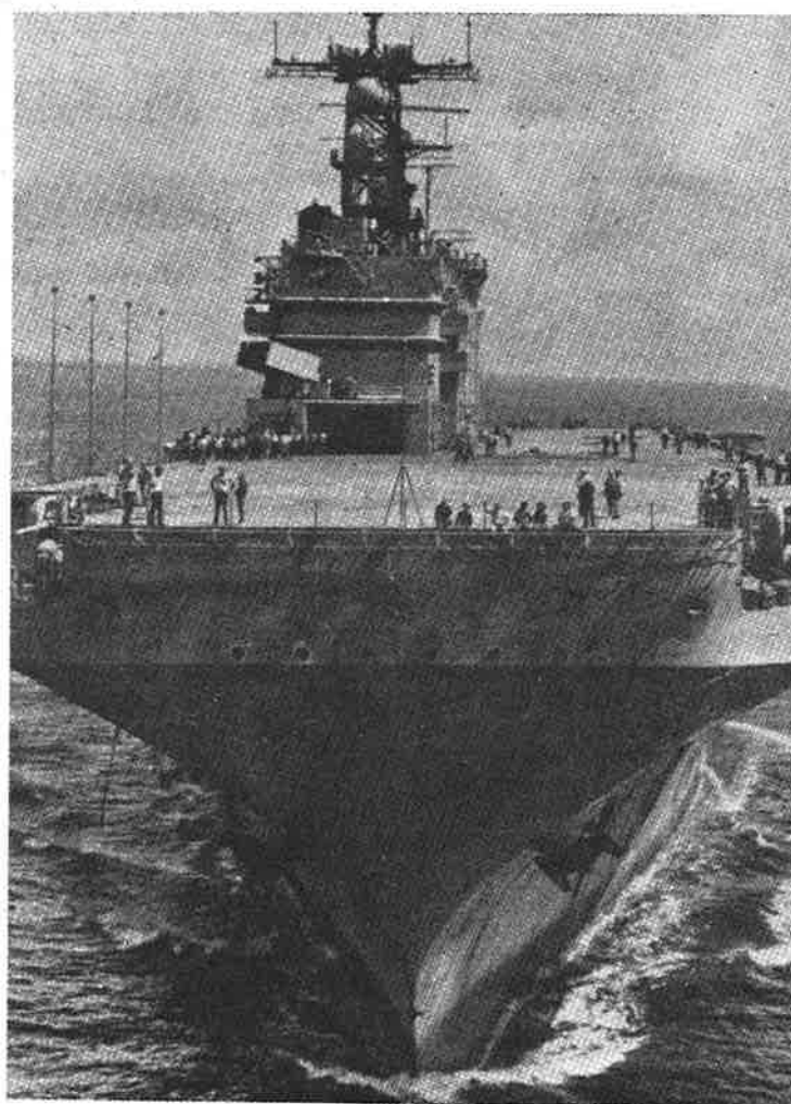
Ships like the new LHA-1 Tarawa, newly built at a cost of over $200 million, are an important part of the Pentagon's arsenal against the neo-colonial countries in Africa, Latin America, the Arab world, and East Asia.

But it will take more than graphs and statistics and ominous speeches on Soviet military strength to erase the memory in the minds of the people of the tragedy and suffering caused by the Viet Nam War.