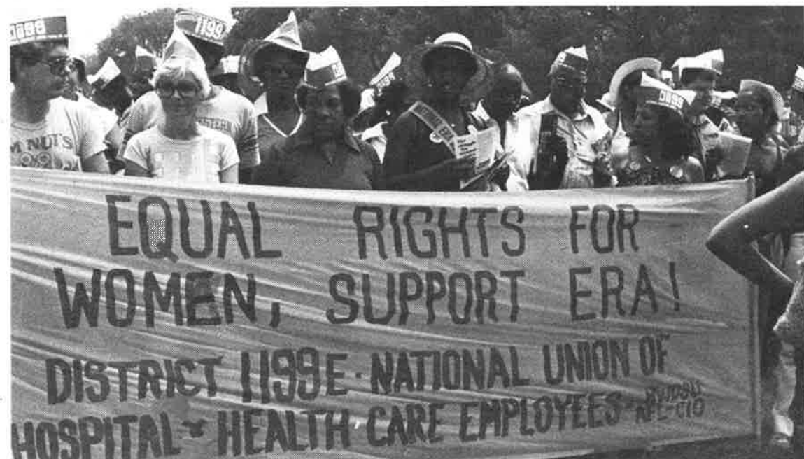
Thousands of labor union members were a part of the 100,000-strong march for equal rights for women in Washington, D.C., on July 9.

As thousands of tired and sunburned women boarded the chartered buses to return to their far-away cities, many expressed pride in having participated in this historic demonstration, the largest march for women's rights ever held in this country.