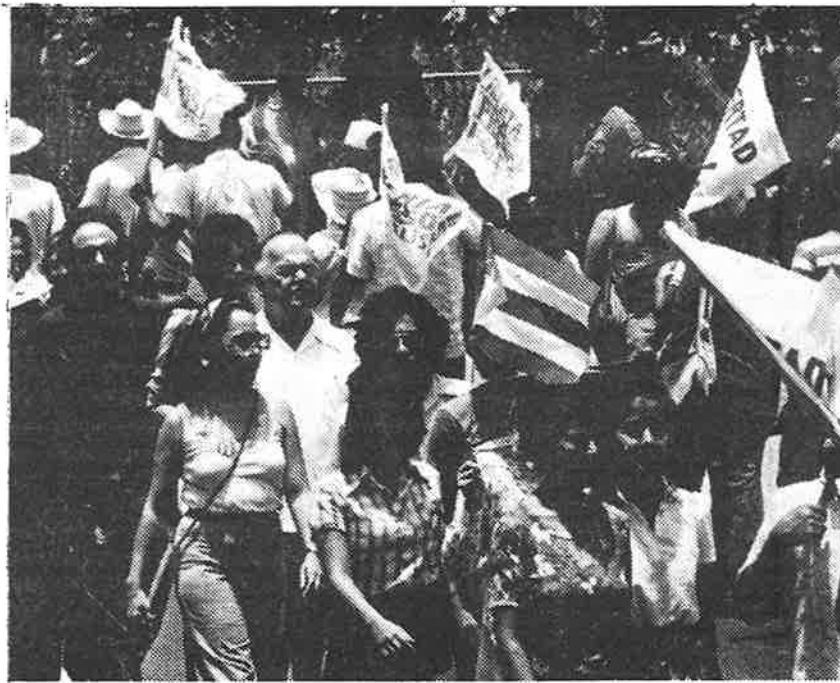
Protestors outside a U.S. government building in Puerto Rico demand political prisoners still in U.S. jails.

This statement of support for Vietnam is particularly significant, especially since Albania has been a longtime friend of China, and in fact in 1971 was the sponsor in the UN General Assembly of the resolution that won recognition for China against the Taiwan fascists.