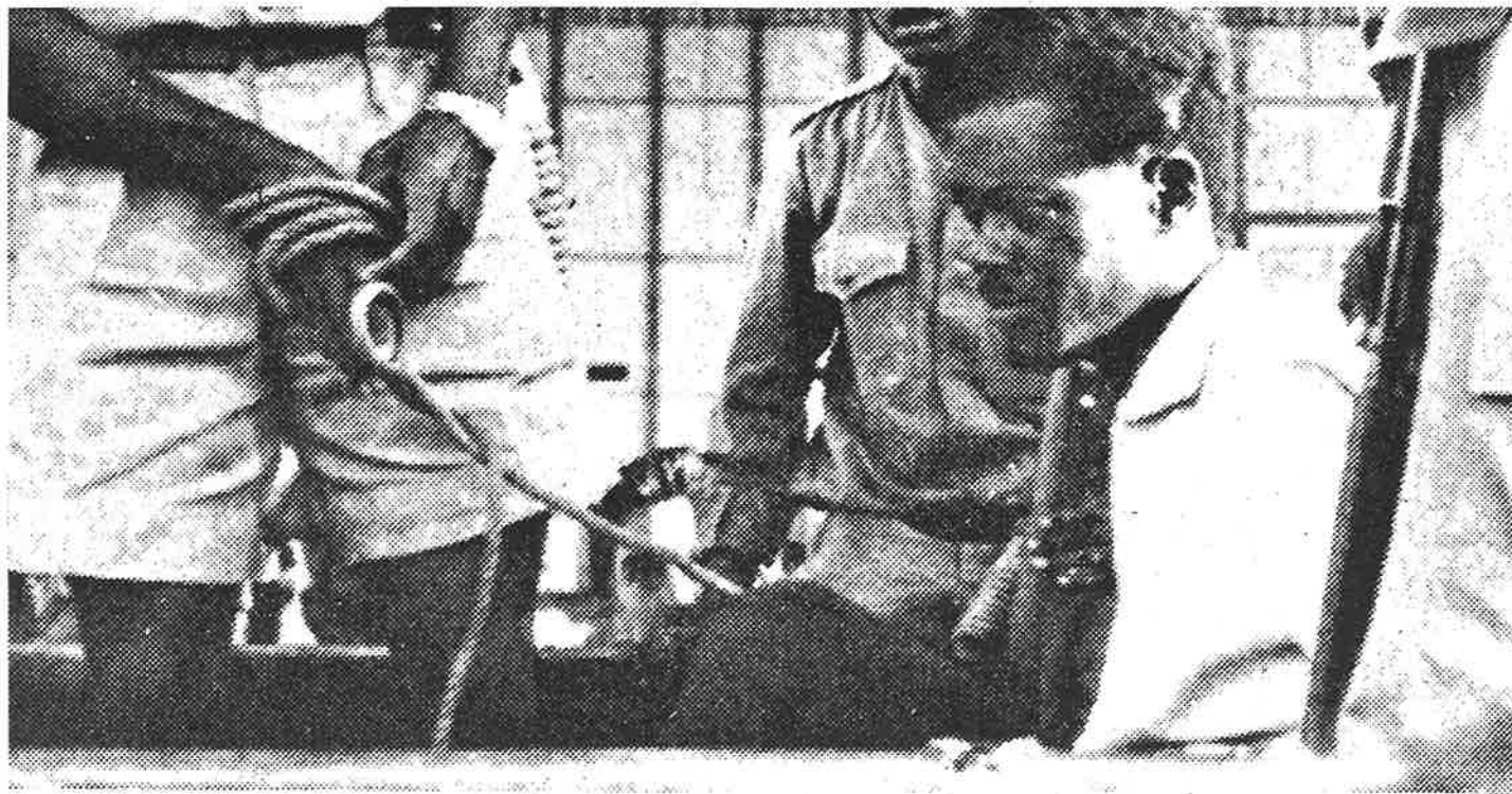
Patricio Lumumba, mártir Primer Ministro del Congo, antes de su asesinato a manos de la CIA, en 1961. En ese entonces, China comprendía bien que, los movimientos de liberación nacional en el Congo eran reprimidos por los imperialistas británicos, franceses y belgas. Pero hoy, los líderes chinos han adoptado—acerca del Congo (Zaire)—una línea idéntica a la de los imperialistas y están ayudándoles a engañar a la opinión pública mundial.

Unión Soviética y otros países socialistas, que desmintieron la retórica pacifista de la política exterior de su administración. Porque, aún cuando el presidente estaba hablando en Notre Dame, la bomba de neutrones ya se estaba construyendo y los planes para el fortalecimiento militar de la OTAN se llevaban a cabo. Soldados norteamericanos todavía estaban en bases diseminadas por todo el mundo y el vigor de las fuerzas armadas se estaba incrementando, no disminuyéndose, en Corea del Sur, y más aún en Europa. Pero, la posición militarista de Carter