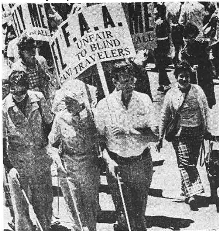
JULY 6—Long obstructed from obtaining full human and civil rights, disabled people have been forced to demonstrate again and again in their struggle to obtain access to such necessities as jobs, education, housing, travel rights, and even basic life-supporting services. Yesterday over 1,000 very angry visually impaired people demonstrated in Washington, D.C. in protest of a Federal regulation that forces them to give up their canes during flights on commercial airlines.