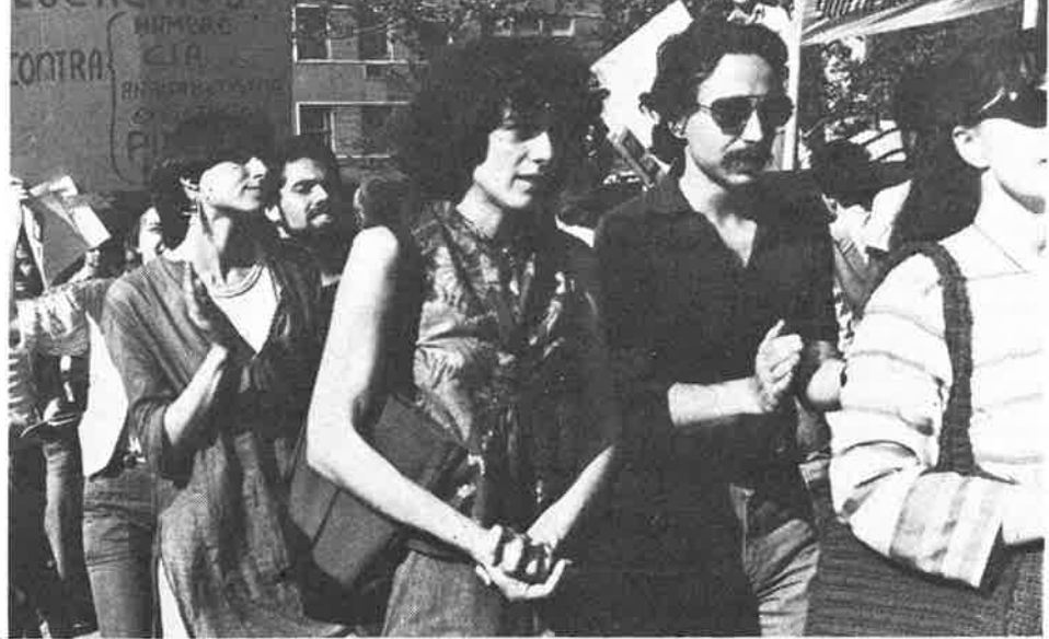
Más de 300 personas marcharon en Nueva York en solidaridad con los chilenos en huelga de hambre.

En Santiago más de 100 personas marcharon en protesta el 29 de mayo y el 3 de junio hubo una manifestación frente a la Corte Suprema, ambas bajo el riesgo de severa represión gubernamental. La huelga de hambre también fue llevada a