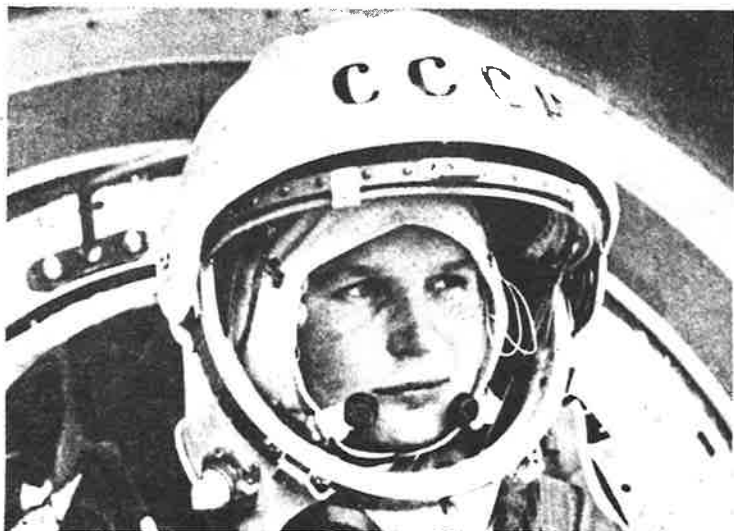
The world's first woman cosmonaut, Valentina Tereshkova. Tereshkova is not merely a heroic woman, she also represents the achievements of a socialist country. By uprooting capitalism the Russian Revolution struck a mortal blow against the foundations of women's oppression.