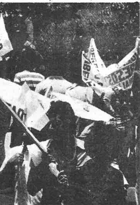
emand freedom for the four Nationalist