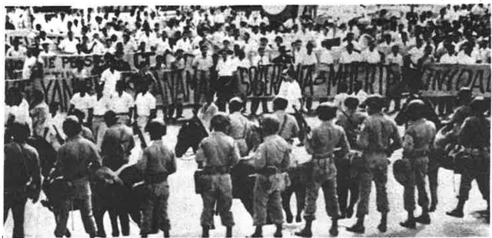
Efectivos de la Guardia Nacional panameña reprimen manifestación en 1964, con un saldo de 20 panameños y 4 gringos muertos.

Los tratados no entrarán en vigor hasta el mes de octubre de 1979, y el Canal no