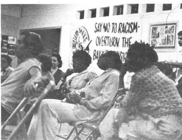
NEW YORK, July 7—The Women's Focus of the New York chapter of the National Committee to Overturn the Bakke Decision (NCOBD) held a meeting in the Bronx office of ASPIRA (a Latin student's organization). The NCOBD is continuing to organize many community activities against all forms of racism.