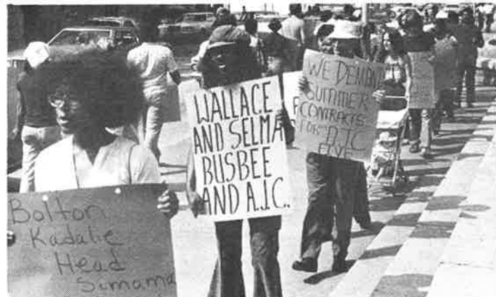
Demonstrators picket Georgia Gov. George Busbee's office in Atlanta on June 16 to protest racism in the Georgia University system.