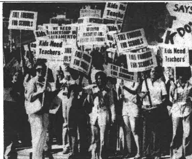
Parents and students rally in Los Angeles to protest education cutbacks due to the passing of Proposition 13.