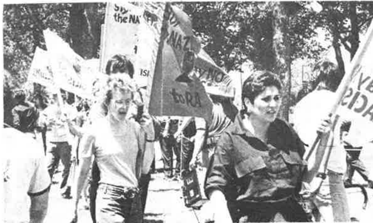
Despite protection from over 100 Milwaukee cops, a rally of Nazis fizzled when confronted with this militant, anti-racist demonstration.

But millions of people feel different. They hate the Nazis for their anti-Semitic and white supremacist filth. Recently a multi-national community in Chicago was able to close down a Nazi recruiting center passing itself off as a book store. Feelings run high that there is no place for Nazi garbage in Skokie, Chicago or any other city of this country.