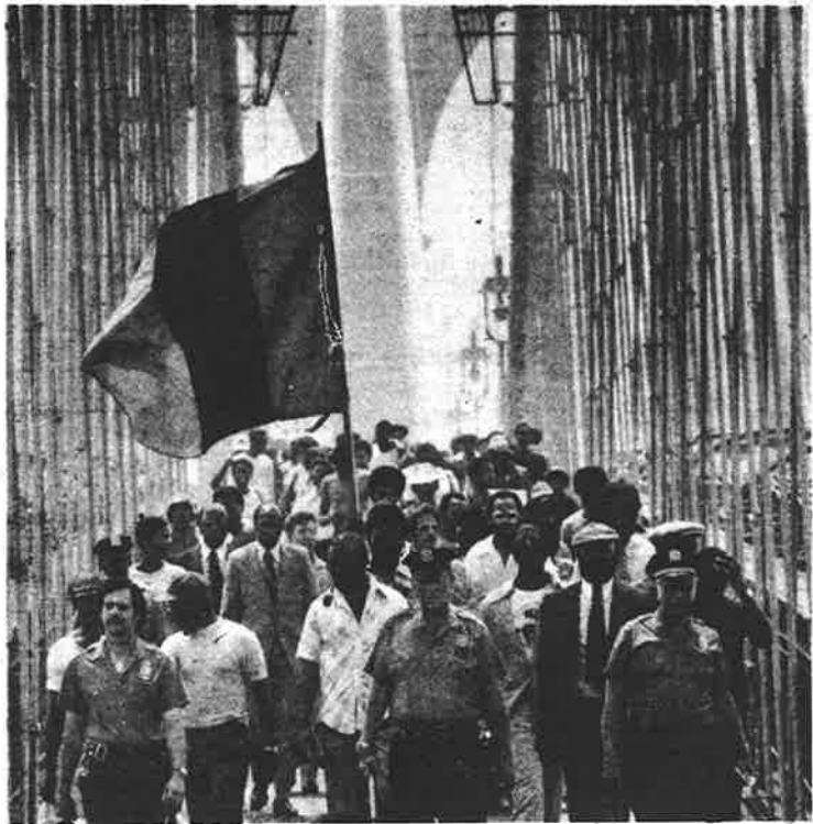
Under a Black liberation flag, angry marchers cross the Brooklyn Bridge to confront New York City Mayor Koch about a police gang murder of a Black businessman.