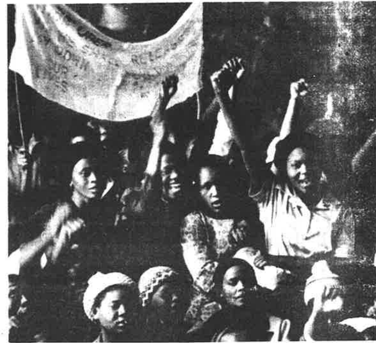
Soweto students at a memorial meeting last week: "Power is in our hands."

Over 1,000 people were killed in that rebellion which lasted over a month and included pitched