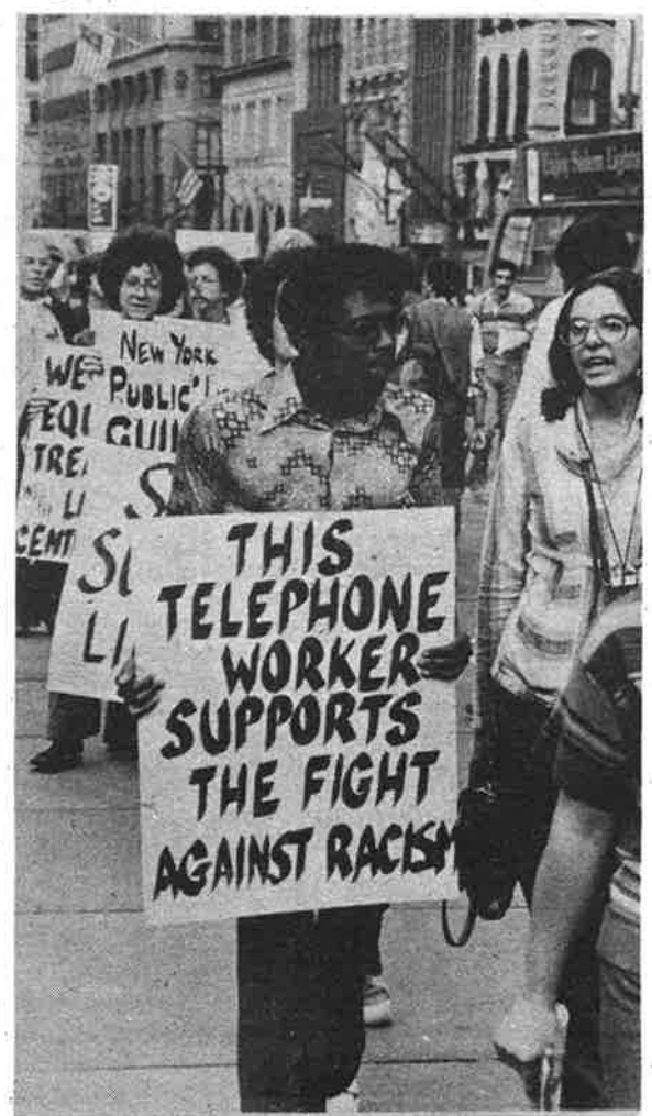
The Schomburg Library is being allowed to deteriorate [left] but the Citizens Coalition to Save the Schomburg is fighting this racist neglect [right].

ministration. On Nov. 20, twenty members of the Citizens Coalition displaying signs demanding an end to the racist treatment of the Schomburg by the NYPL and equal funding with Lincoln Center, conducted a massive leaflet distribution and demonstration at Lincoln Center library. So embarrassed was the