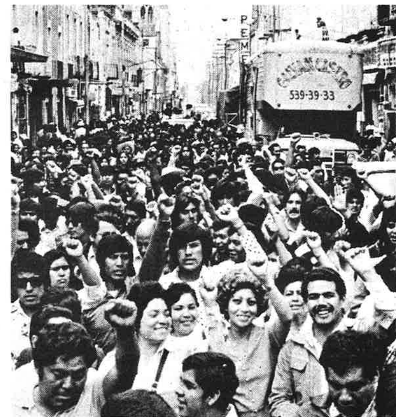
Mexico City: July electrical workers strike.

immigration authorities, there are already 5 million "illegal aliens" from Mexico either seeking or trying to maintain jobs within the U.S.