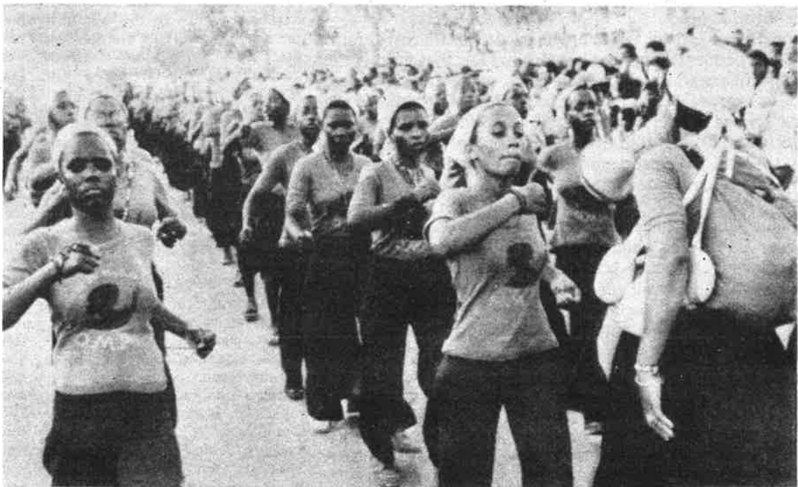
Angolan women march through the streets of Luanda on Nov. 11, 1975 to celebrate the first day of independence from Portugal.

Progressives everywhere will welcome the new revolutionary voice of the PRA at the forum provided by the UN.