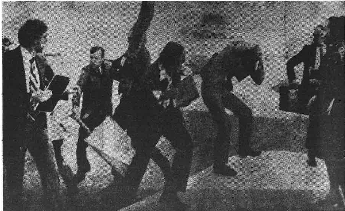
"Imperial Wizard" David Duke of the Ku Klux Klan [center] is clobbered by anti-racist picketers outside Camp Pendleton, Calif.

The League has also called for a full investigation of Klan activity at Camp Pendleton by the Congressional Black Caucus. All of this support and more will be necessary to free the Black marines, as the next step in the campaign to defeat the Klan at Pendleton.