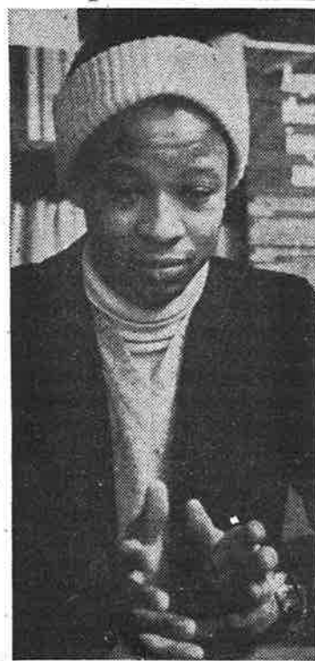
Tsietsi Mashinini, leader of the South African Students Movement, at a New York press conference.

Mashinini said he had supported the MPLA in Angola during the recent war there. "Because South African troops were fighting against Angola, I identified with the MPLA regime," he said. He also said that the walkout of Black athletes from the Olympics in Montreal had been a welcome show of solidarity. "It was a hard punch on the chin of the regime, and it made us smile at home," he said.