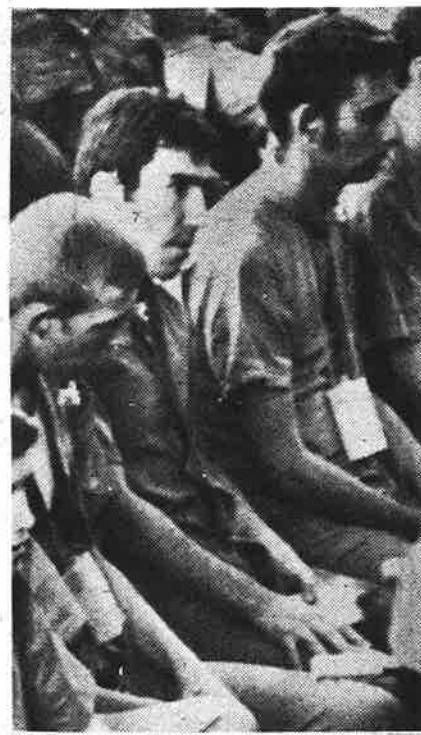
U.S. and British mercenaries on trial