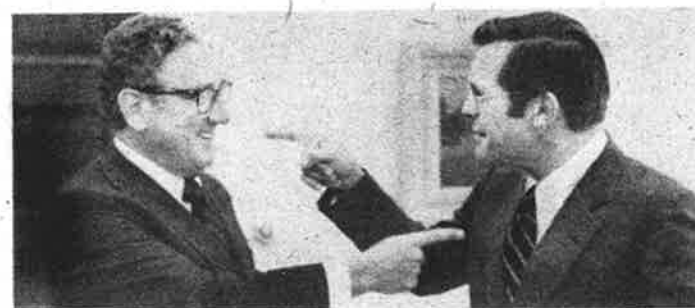
Kissinger with Defense Secretary Rumsfeld.

Kenya and Zaire are the two most important African states to take the road of neo-colonialism since formal separation from direct European rule. U.S. and British multi-national corporations either own outright or directly control all the critical areas of Kenya's economy. At present, over 3,000 "technical assistance personnel" from the imperialist countries, especially Great Britain, hold key positions in the major Kenyan ministries, including Planning, Home Affairs, the Legal and Judicial Departments, Commerce and Industry, and in the office of President Jomo Kenyatta. Up until now, neo-colonialist penetration has been most pronounced in Kenya's armed forces and security apparatus, which are equipped and trained by the English.