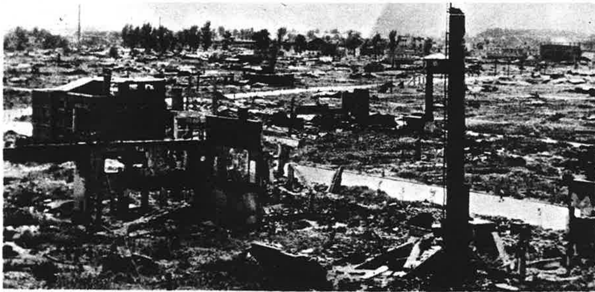
A part of the city of Pyongyang reduced to ashes by the bombings of the U.S. imperialists during the Korean war.