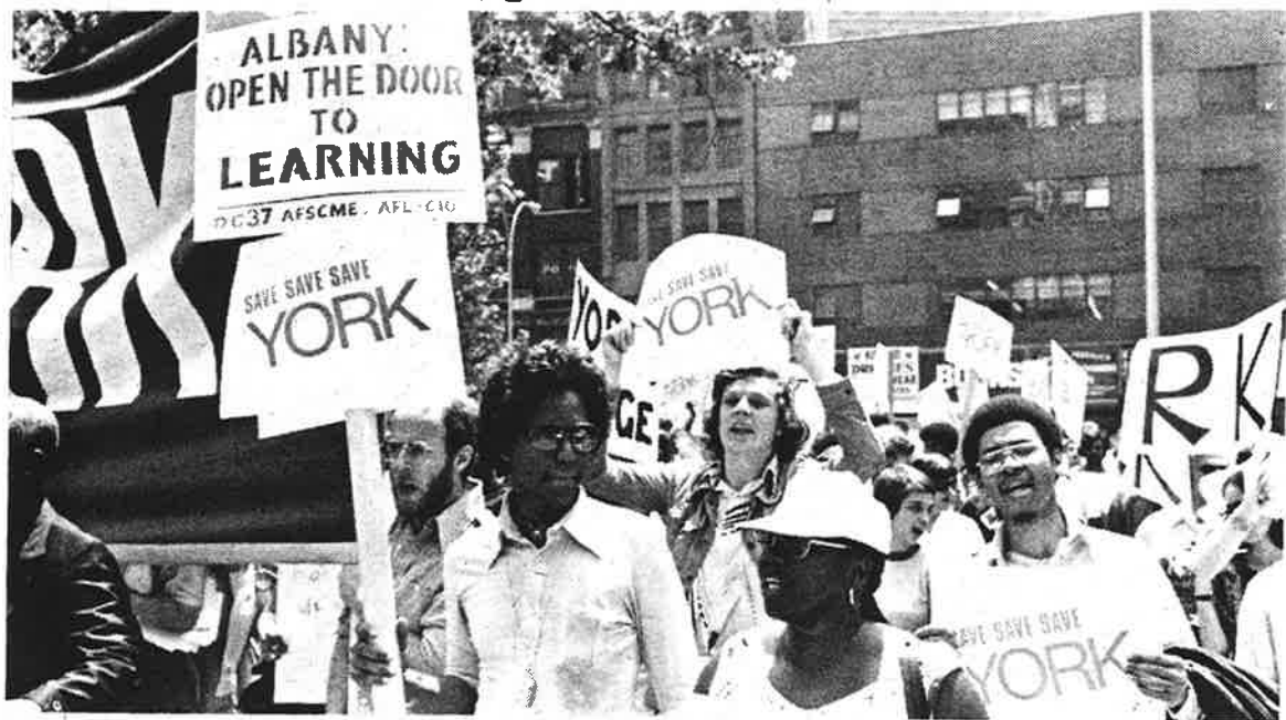
Marchers on way to Union Square from City Hall protest cutbacks in New York City's university system.

The writer teaches at Manhattan Community College of CUNY.