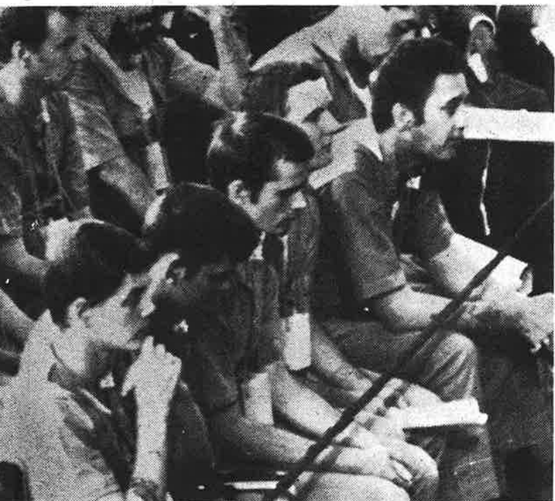
trial in Luanda for their crimes against the Angolan people.