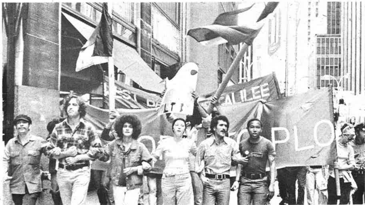
Demonstrators in New York City show pro-Zionist parade their support for Palestinian struggle.

All progressive people must condemn this campaign of terror against the Arab community of Southeast Dearborn. The right of the Arab people as an oppressed nationality to use any means they find necessary to counter these racist attacks must be defended.