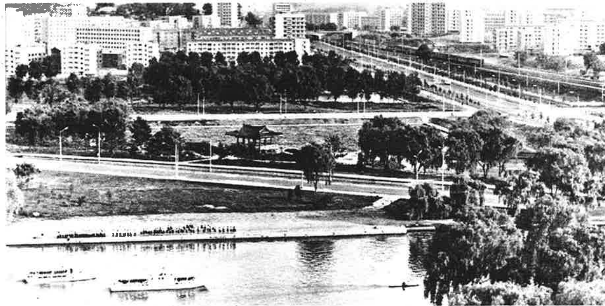
Today Pyongyang is a beacon of growth and development as the Democratic People's Republic of Korea prospers under socialist construction.

For more information, call (212) AL5-0352.