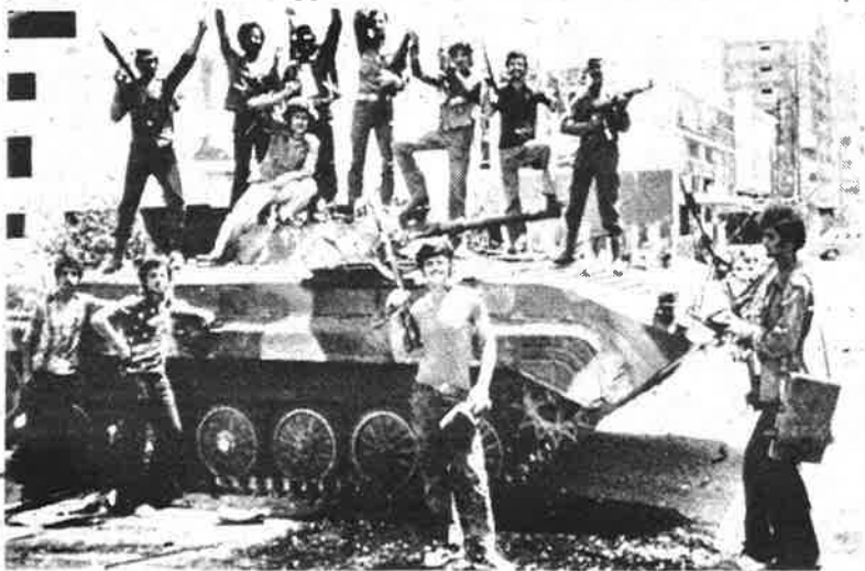
Lebanese leftists celebrate atop a captured Syrian tank. Together with the Palestinians, they are putting up a strong resistance to the treacherous Syrian invasion.

Behind the Syrian intervention looms the U.S., fearful of losing its control of Lebanon and fearful that a revolutionary Lebanon would inspire the rest of the Middle East to follow its example. "Without U.S. officials keeping channels of communication open between Israel and Syria, a war between them might have erupted," said the reactionary U.S. News & World Report on June 21. The aircraft carrier America and two escort frigates are stationed off the Lebanese coast, "as a sign of U.S. interest in the area," according to the same report.