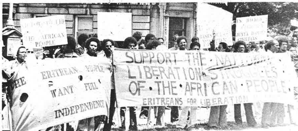
About 125 members and friends of Eritreans for Liberation in North America demonstrate outside the Ethiopian embassy after a march through downtown Washington, D.C., which stopped at the State Department.