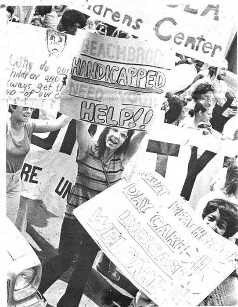
A Peoples Tribunal in New York will "bring together all those forces who are fighting the devastating cutbacks" as part of the build-up for July 4. Here, daycare workers fight back.

If you are interested in attending the demonstration with Workers World Party and Youth Against War & Fascism call (212) AL5 0352 in New York or any of the branches listed on page 10 of this paper.