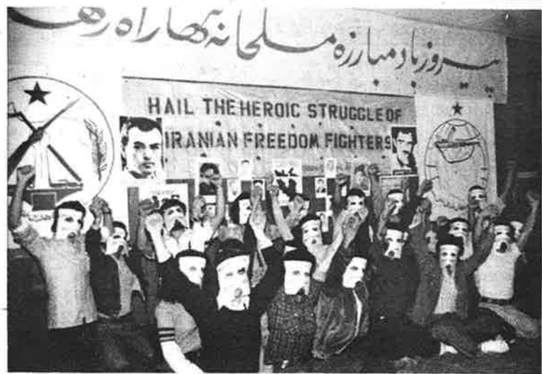
Iranian students in Chicago are on a hunger strike in protest of the repression in their country.

measures, they only arouse to greater intensity the hatred of the Iranian people toward the U.S.-supported regime of the Shah. As