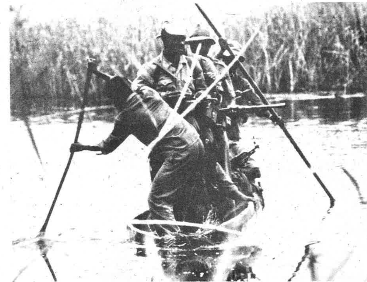
SWAPO guerrillas are intensifying their struggle for Namibia's freedom.