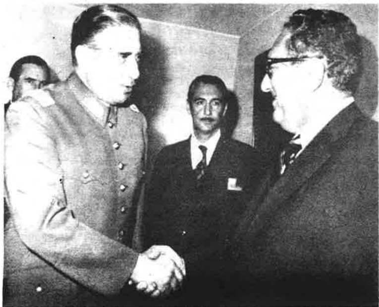
Pinochet has a friend. . . .