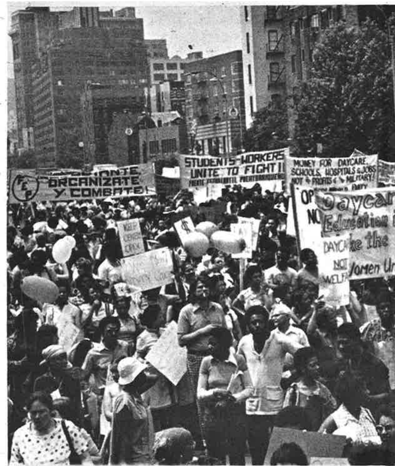
Over 7,000 parents, children, and workers march the 70 blocks decision to stop funds for 49 daycare centers and fire 1,500 workers plan for "austerity" among New Yorkers.

The June 19 conference will be taking place at the Trinity Lutheran Church on 164 W. 100th St., from 9 a.m. to 5 p.m.