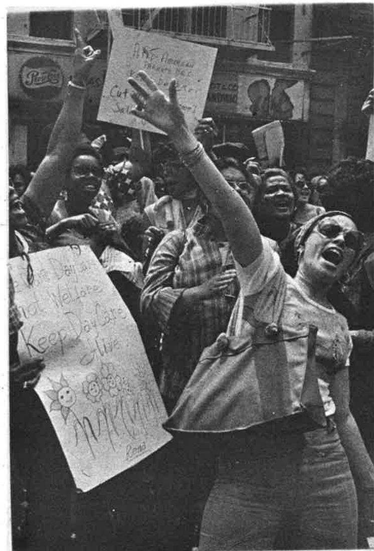
Some of the more than 7,000 supporters of the right to childcare and education at NYC rally.

Another demonstration is planned by the teachers' union, the Professional Staff Congress, to confront 500 Democratic politicians on Monday, June 14. They will be feasting on a $125-a-plate "picnic" at Rockefeller Center while CUNY remains closed for "lack of funds." Marchers will assemble at Manhattan Community College, 1633 Broadway at 50th Street at 5 p.m.