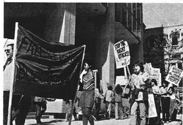
In Boston, where mobs initiated by racist politicians have beaten Black people openly, the East Boston Black Defendants are fighting for the right to defend their homes and families.

It was while the Black students were being brutalized by the police