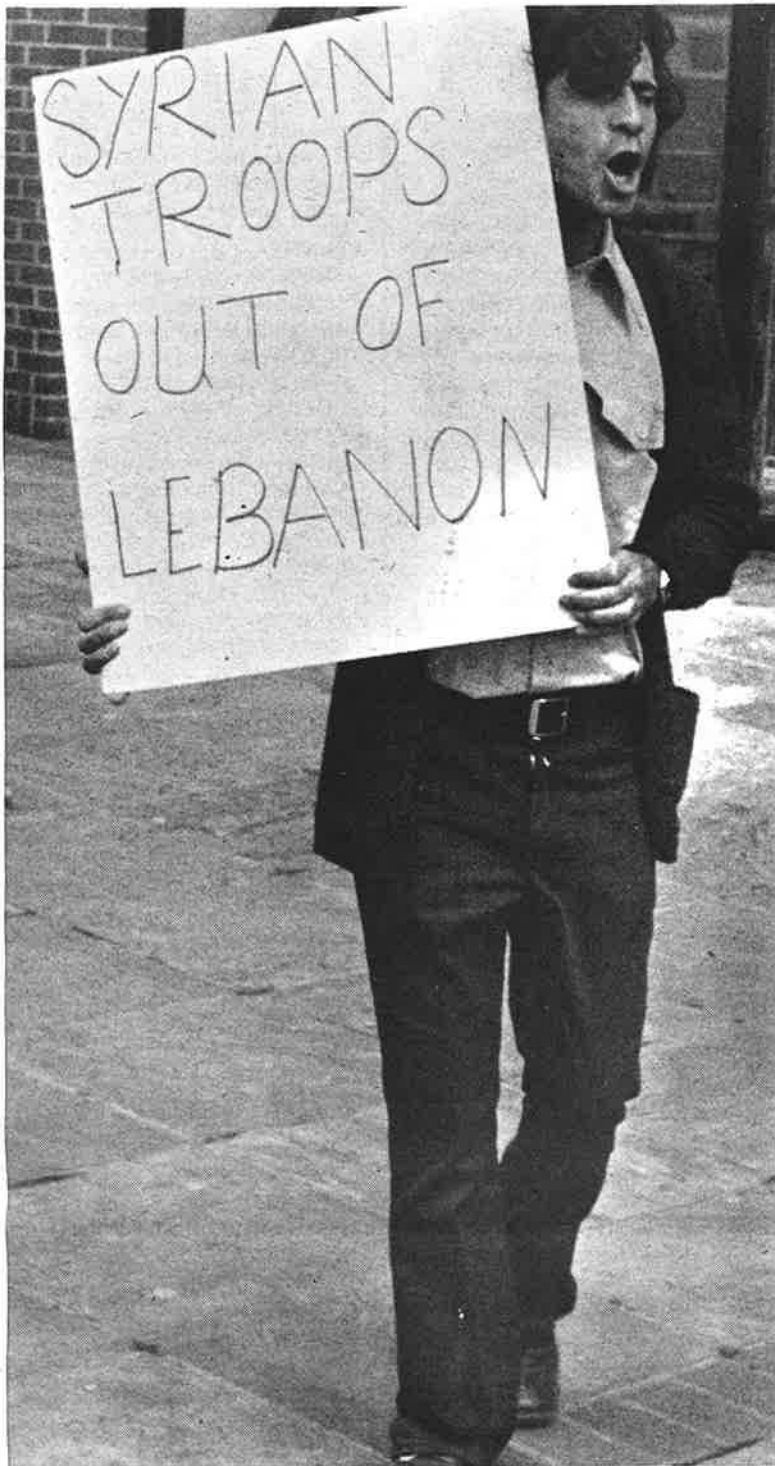
Arab student demonstrates at Syrian Mission to UN.

But every time Israeli jets bombed southern Lebanon to strike at the Palestinians, it was another reminder of the same military presence started by Eisenhower and Dulles in 1958. When in 1969 the Israelis invaded Lebanon and took over Beirut airport, with the connivance and encouragement of