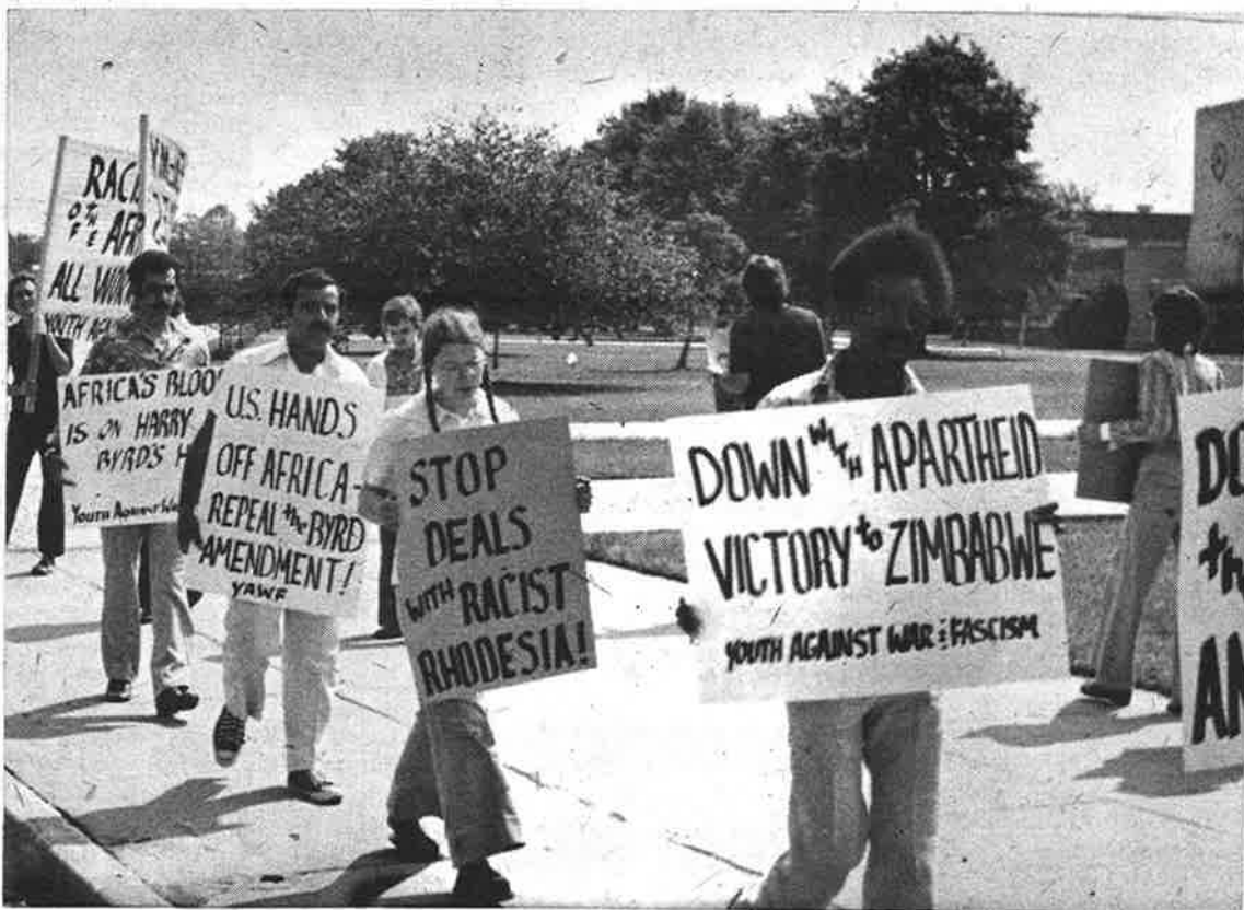
Demonstrators protest racist policies of multi-millionaire Virginia Senator Harry F. Byrd, an outspoken supporter of the racist regimes of South Africa and Rhodesia.

"I think all hell is going to break loose," says one U.S. official. "Didn't the Pentagon tell us that the Viet Cong could never fight the marines?"