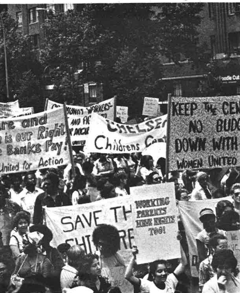
ks from City Hall to Governor Carey's office. The disastrous orkers as part of a $34 million cutback is another part of the WW