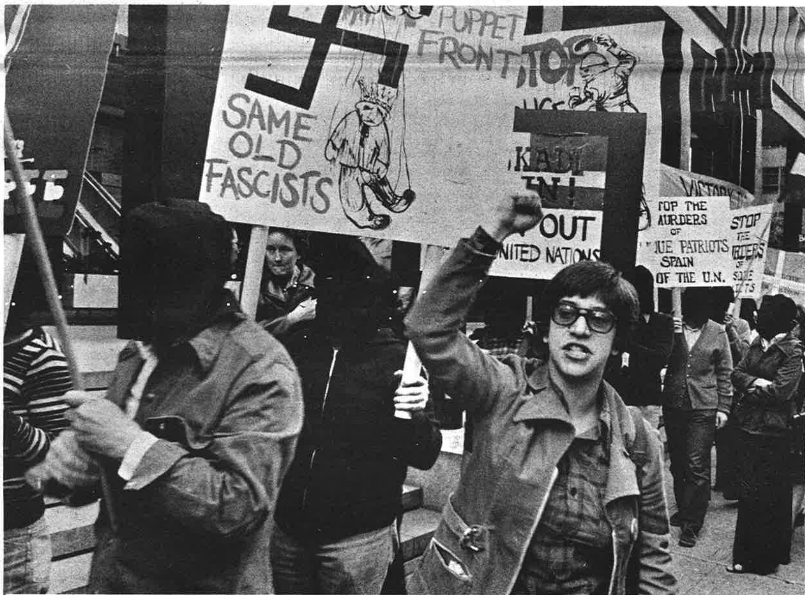
"Fascism in Spain—made in USA!" More than 350 Spaniards, Basques, Catalans, and Americans protest U.S. visit of Juan Carlos of Spain. Here, Basque contingent wear masks in order to protect their families at home from repression.

A demonstrator from Catalonia, where 4 million people are denied their right to self-determination, said, "The democracy that the U.S. newspapers have been talking about in Spain is not there. In Catalonia the basic freedoms of the