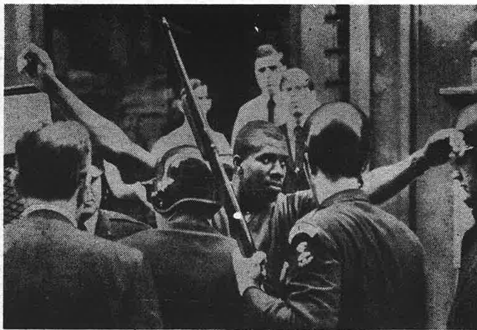
Shotgun-toting Baltimore cops frisk a Black prisoner.

A skeleton had been dug up in October and three months later, in January, three ex-Panthers were approached and offered a living wage, hotel accommodations, police protection and immunity from all criminal charges if they would testify that they had participated in the torture-murder of Anderson in July, along with other Baltimore Panthers, at the order of a white radical lawyer, Arthur Turco. If they failed to testify, they were told, they would be charged with mur-