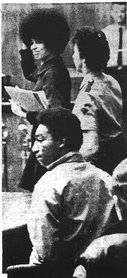
Angela Davis and Ruchell Magee in San Rafael court. Magee is strapped to the chair.