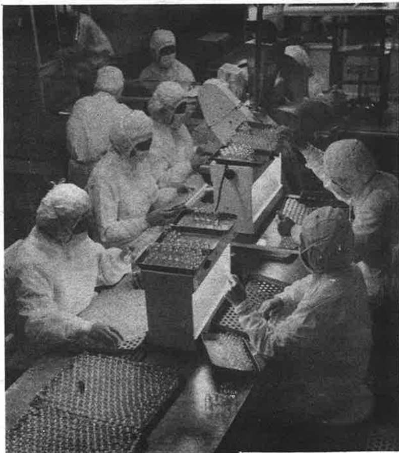
Medical research and production in Peoples China —for health, not profit.

It is obvious that if preventions and cures instead of palliatives for profit are found, these parasites would no longer be able to exploit the illnesses of people.