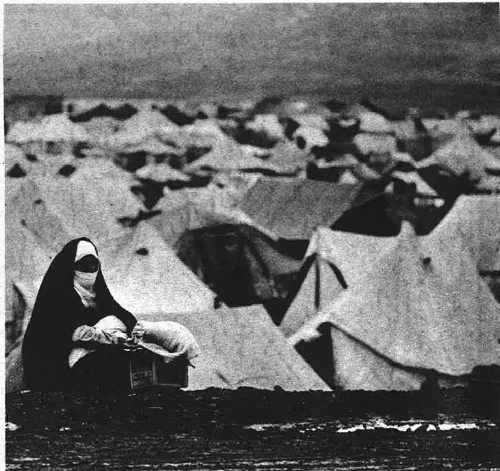
Millions of Palestinian people live, and die, in refugee camps such as this one.

a Jarring-made settlement, Washington knows that it must get full Soviet backing. And that is the very purpose of the current organized terror against Soviet personnel in the U.S.—to force the Arabs into a disastrous settlement. No amount of propaganda about "Soviet anti-Semitism" can hide this fact, especially from the Arab peoples, who remember as well as the Zionist and pro-Zionist hypocrites when it was all cheers for the Soviet Union, and no cries of anti-Semitism, when the Soviet