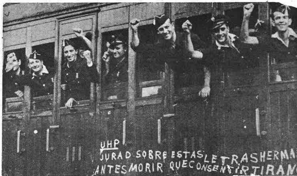
Spanish revolutionaries on their way to the front.

There is today a global revival of the class struggle as capitalism enters another grave crisis. Europe, where the development of the modern proletariat first gave birth to scientific socialism, is awakening from the sleep of exhaustion that followed the fascist triumphs. The struggles in Spain are an important part of this renaissance. The Spanish and Basque workers will have to