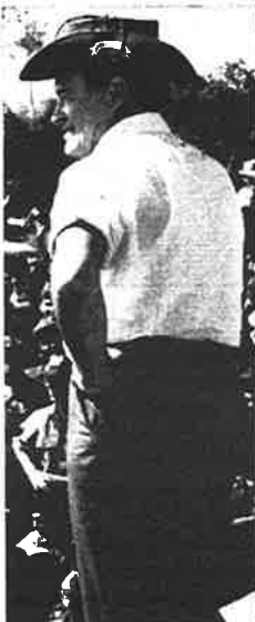
Peace symbol and boos greet Hope