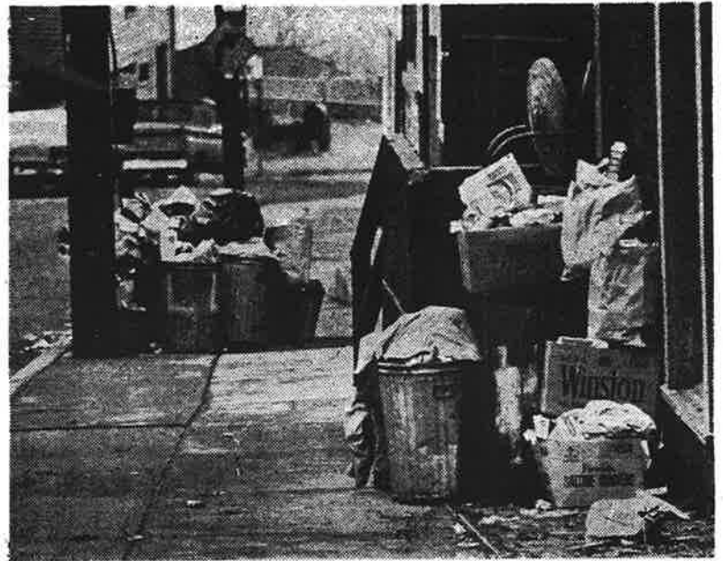
Cincinnati street during strike. The capitalists can't collect garbage without the workers.

The strike could have turned into a confrontation even more basic than the sanitation workers' strike in Memphis early in 1968. For example, the great proportion of Black workers among the strikers was actually emphasized by news reports and photos in the press in a fairly open campaign to whip up the white population against the strike. (This was not really successful in spite of the racist atmosphere in the town.)