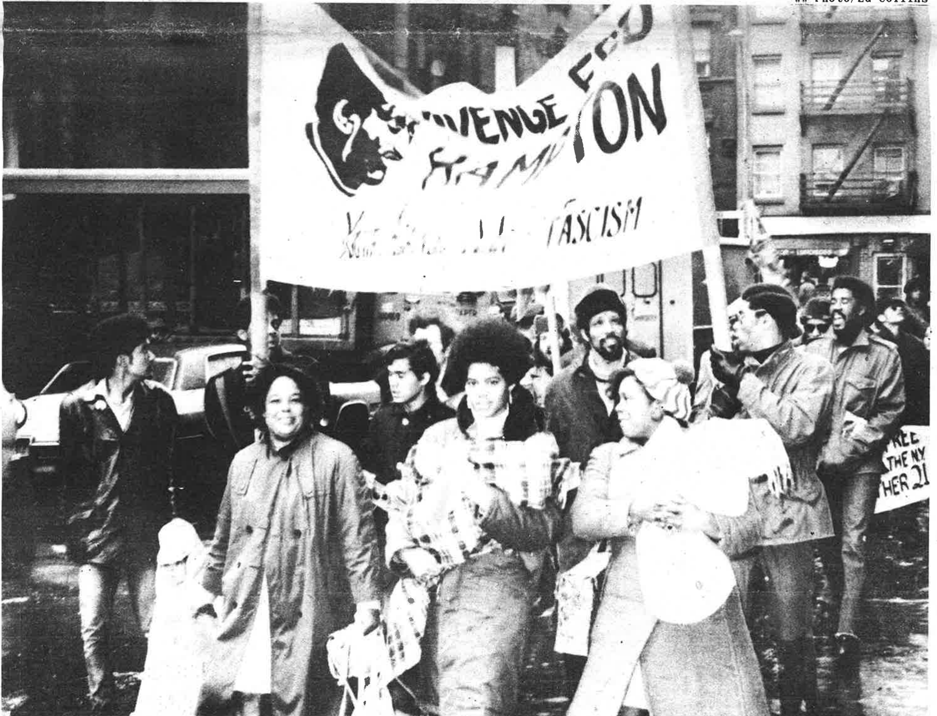
Families of the New York Panther 21 lead the massive demonstration that circled the Courthouse.