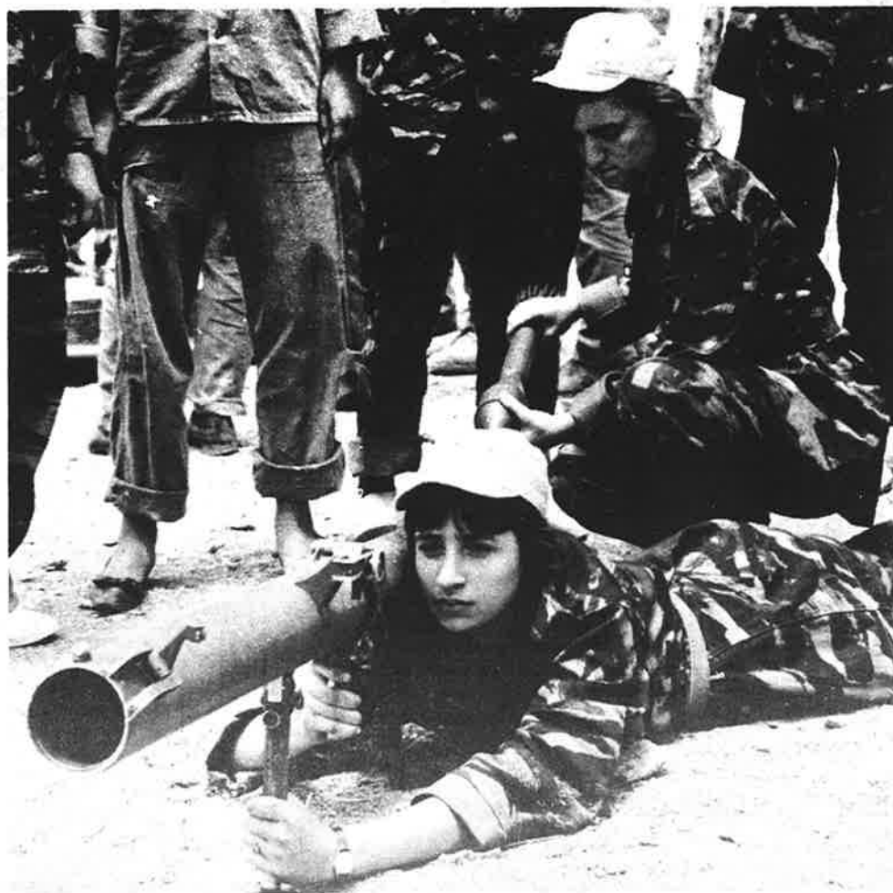
Arab women train to fight for their homeland.

And in light of this dramatic example, it appears that the most significant military aspect of the war, air power, is now being carefully reevaluated by the Arab nations, and in particular, the UAR. During the emergency Cairo meeting this past week of Arab