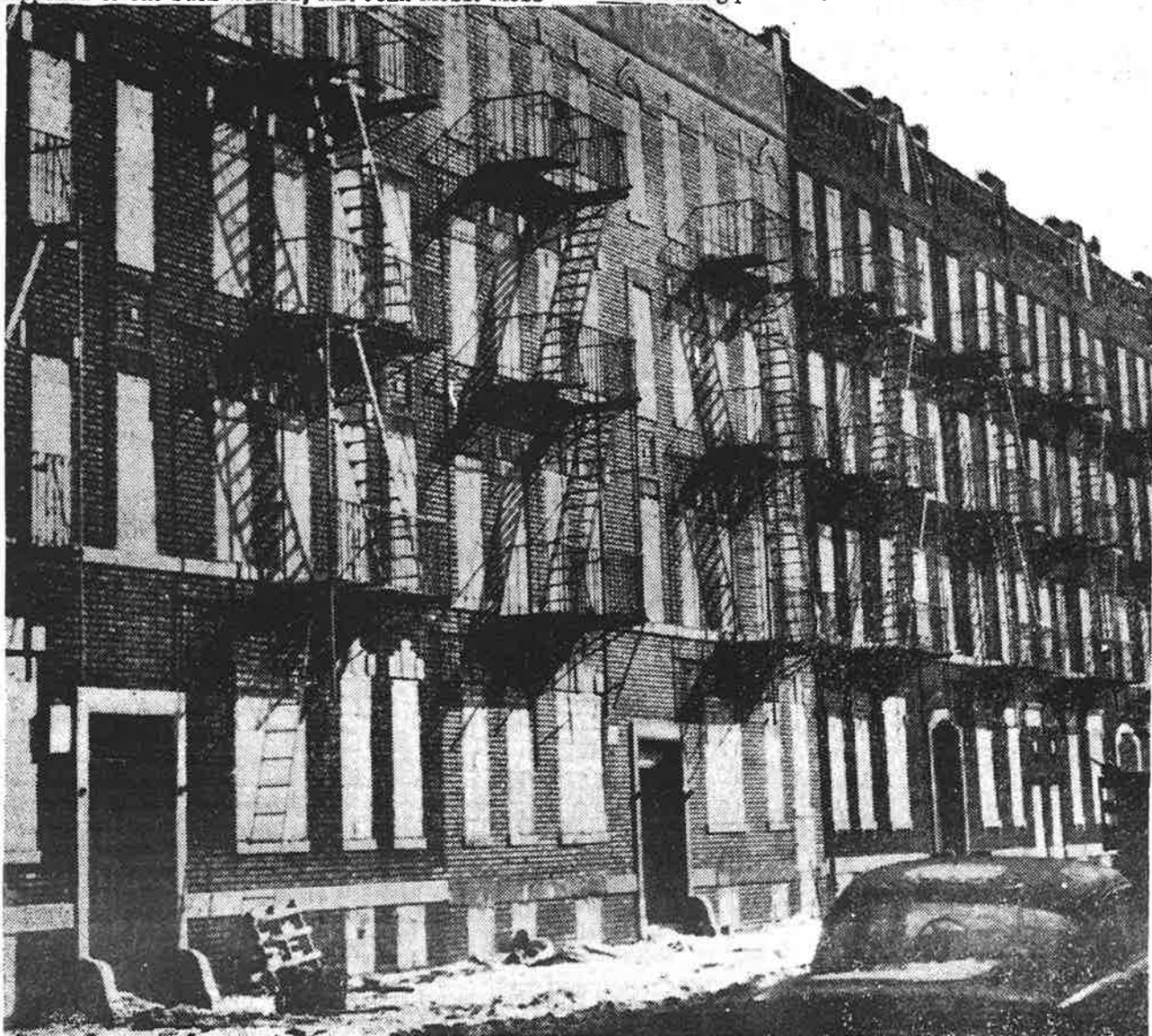
Abandoned buildings cost New York City 30,000 apartments a year. These boarded-up houses are in East New York off Blake Avenue.

The workers in America are beginning to solve the housing problem.