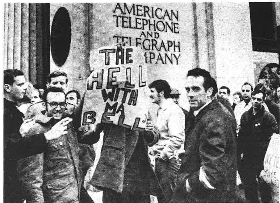
Telephone workers during November strike.

That night the company capitulated. The steward was reinstated with no