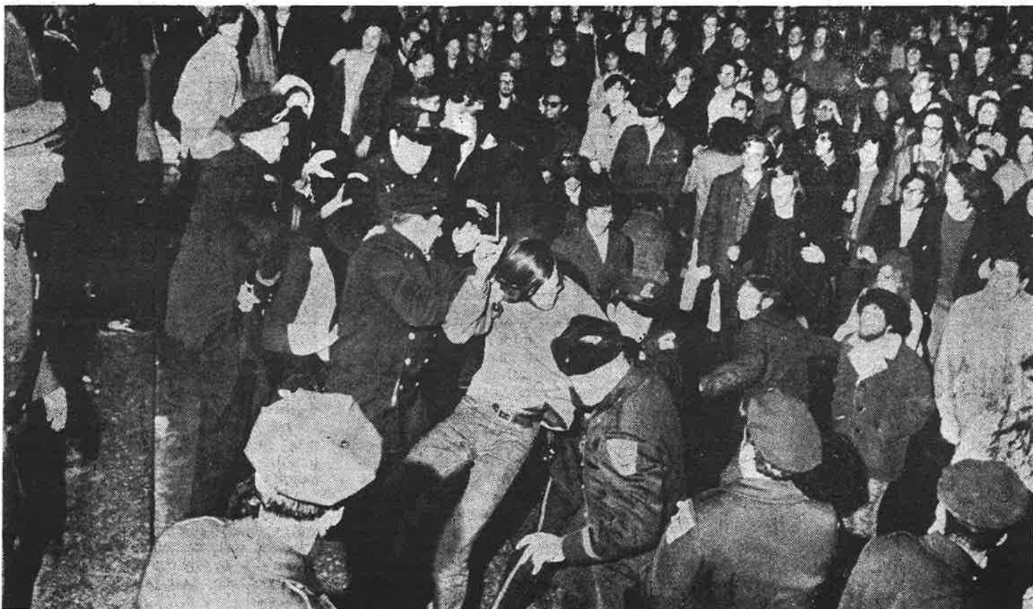
Cops arresting student just before the battle at Northeastern.

As the spirited demonstrators gathered in front of the building the sound of their chants was suddenly punctuated by the sound of shattering glass. For fifteen minutes the din of militant chants and bricks crashing through windows and bouncing off walls continued until not a window was left intact and the trophy cases and other fixtures inside were demolished. It was only then that the demonstrators finally dispersed.