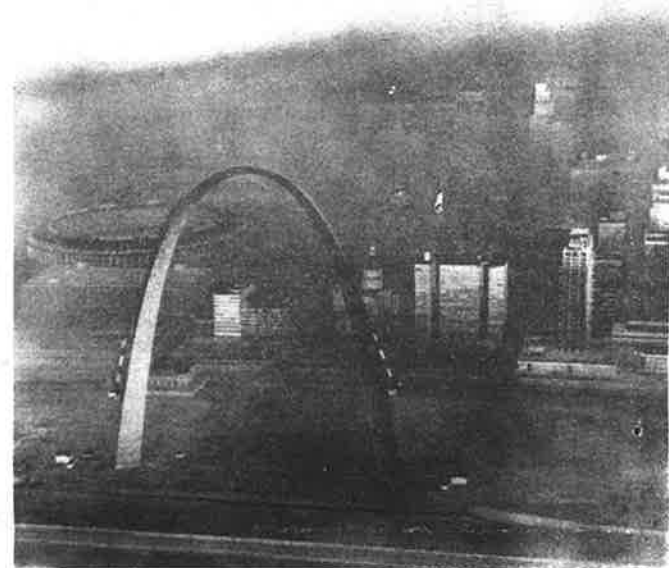
The New Yorker at left isn't kidding. Emphysema, the fastest growing cause of death, is caused by choking air pollution like that in St. Louis (above).

$750! This is like fining a drug pusher $5. The courts no more expect the drug pusher to stop polluting the bodies of ghetto dwellers because of that $5 fine than they expect the corporations to stop polluting the air and water because of a $750 fine.