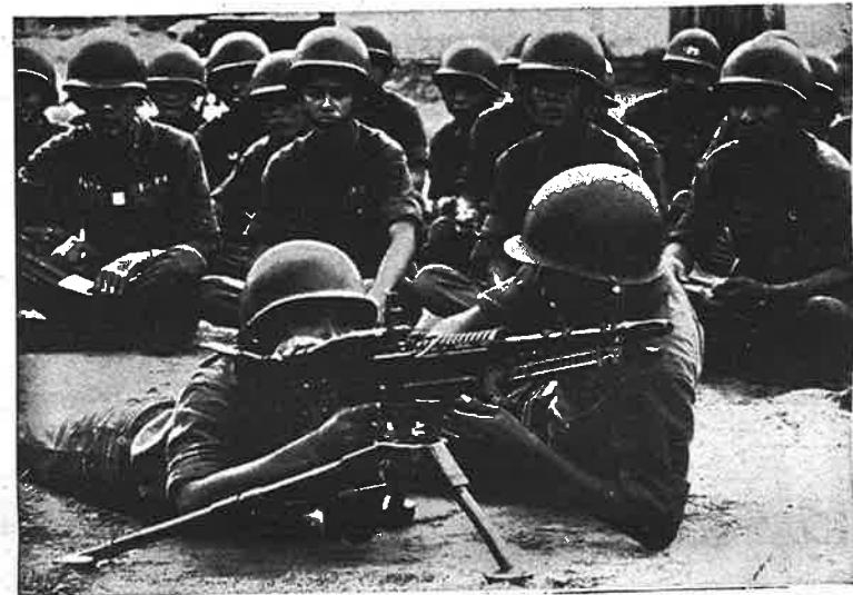
Vietnamese puppets training to "take over" the war from the U.S. Will they fight at all if the U.S. really leaves the Vietnamese to themselves?