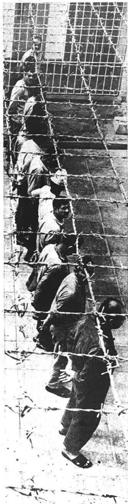
Arab guerrillas in an Israeli prison.

When Pompidou meets with Nixon this month in Washington, the discussion will surely not center on who is pro-Arab or who is pro-Israel, but on how the U.S. and France can best divide the oil riches and exploit the peoples of the Middle East.