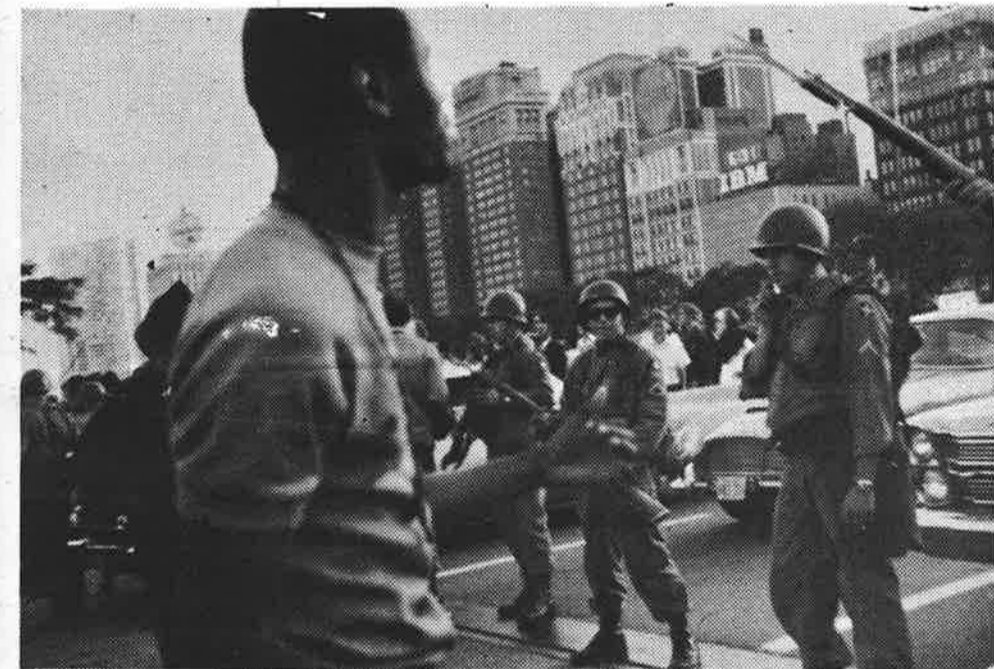
Lone Black youth defies armed guardsman

The liberals, on the other hand, must be condemned for coming to this rigged convention. They have only served as a democratic cover for the ruling class, who decided on a Nixon-Humphrey race long ago.