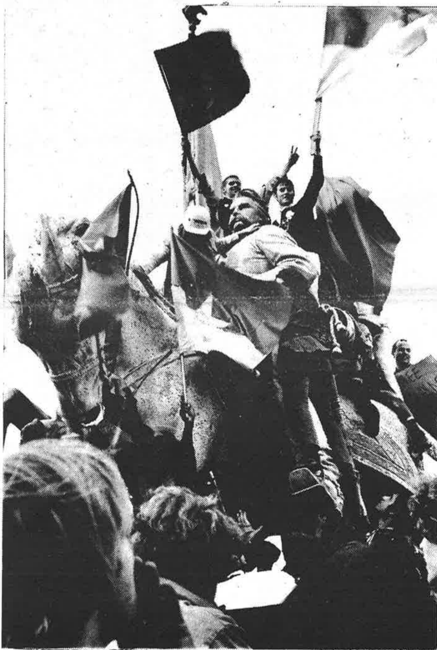
High point on Grant's statue, Grant Park, Chicago, when the Red Flag and NLF flags were raised in triumph.

members in the Longbinh Stockade who receive the anti-war union newspaper, The Bond. The ASU is currently trying to obtain first-hand information about the rebellion which has been closely censored by the military.