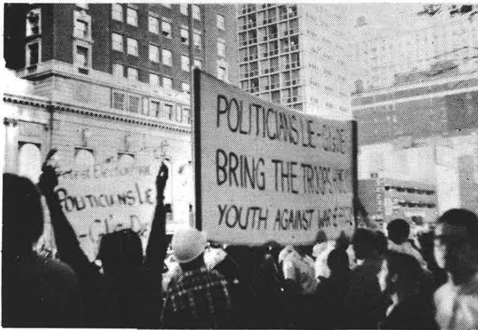
Confrontation at the Conrad Hilton

For that matter, the Chicago Police Department would never dare to "mar the image" of the entire Democratic Party unless it had received explicit orders from the party hierarchy to crack heads. The White House, the Pentagon, the Democratic National