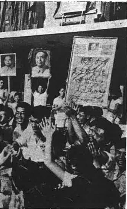
Chairman Mao Tse-tung

SEPT. 6 — The government of the People's Republic of China proclaimed today the all-out victory of the Proletarian Cultural Revolution in every one of China's 29 provinces, autonomous regions and special municipalities.