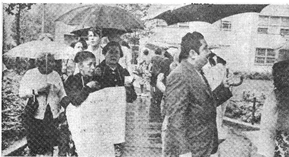
Puerto Rican and Black pickets in front of Masaryk Towers in New York demand right to rent vacant apartments. Twenty were arrested. MPI supported action.

And while cops love to talk about "crime in the streets" — which is their racist view of the struggle for Black liberation — they personally are deeply involved in narcotics pay-offs. Because of this involvement, the elimination of the business that leads to hundreds of deaths — of both addicts and victims of crimes by addicts trying to pay for their habits — is impossible.