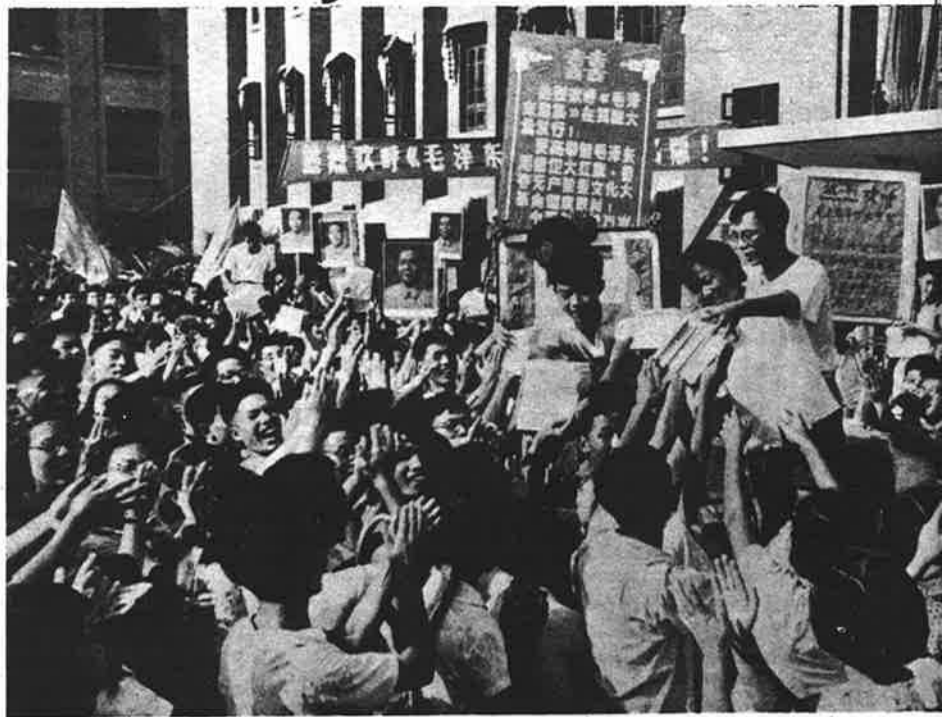
Workers at Textile Institute in Shanghai receive copies of works of