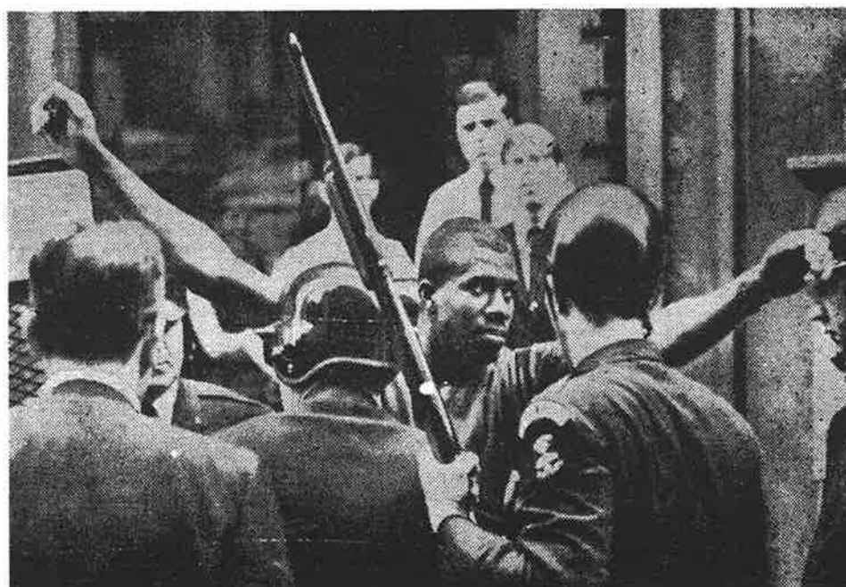
Cops searching homes of Afro-Americans in Baltimore.