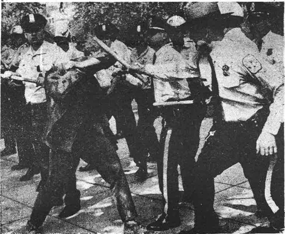
Washington cops beat a Mexican-American member of the Poor People's Campaign.