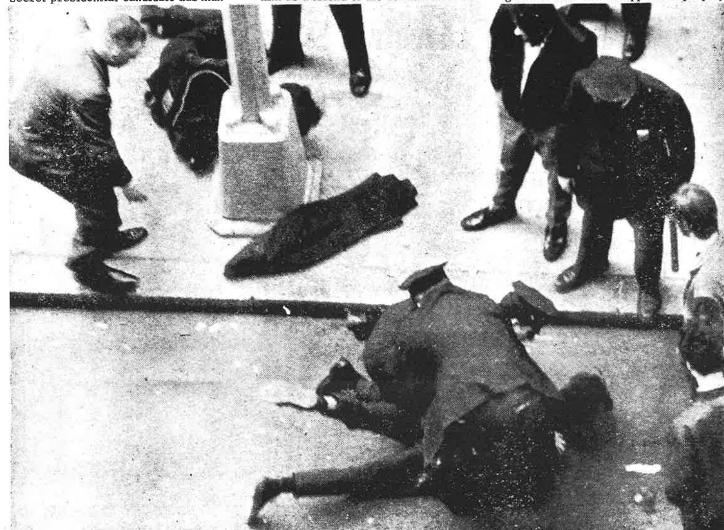
Lindsay's Cops Last Week: The "Crime" - Burning Nazi Flag!