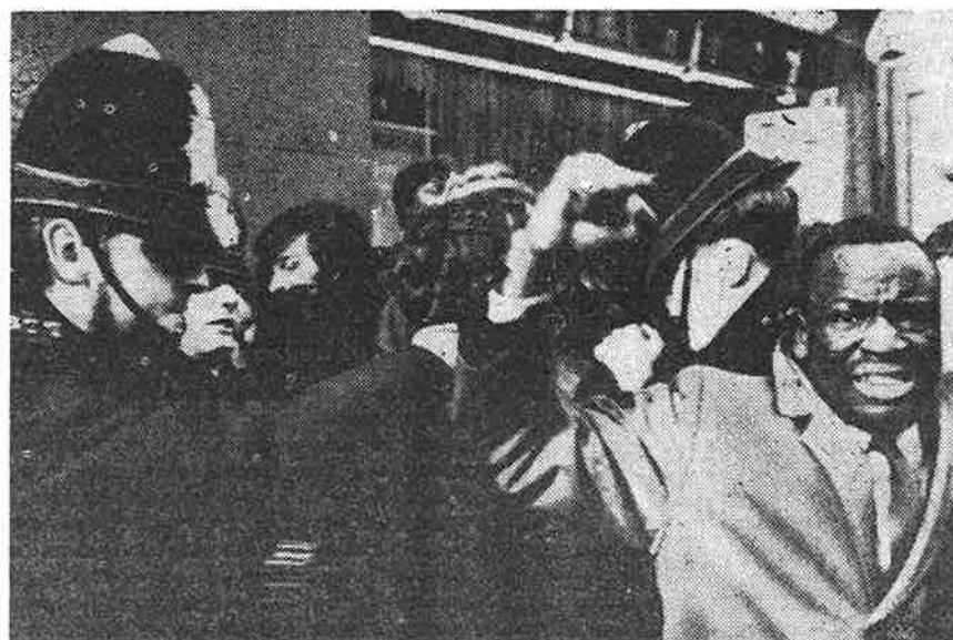
The British imperialists claim to be against white supremacist brother government in Rhodesia. Above, British cops club Africans in London protesting Smith government's execution of Africans.

The entire ruling class is behind the campaign and only differs on the way to put it over. This was clearly shown by the decisive vote for the bill, proposed by the Labor Party , to limit immigration of Asians last February. (Michael X, a Muslim, is now serving