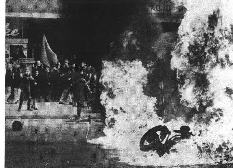
German students burn a cop's motorcycle in West Berlin during a militant demonstration against Axel Springer, neo-Nazi publisher in West Germany.

So the bankers and their government intend to do their damndest to make it a dismal spring for any "man in the street" who might just have the price of a "spending binge" for furniture, clothing or other "luxuries." Those articles of "necessity," like the Vietnam war, must be paid for, and those bankers — who are definitely not the "man in the street" — must be saved.