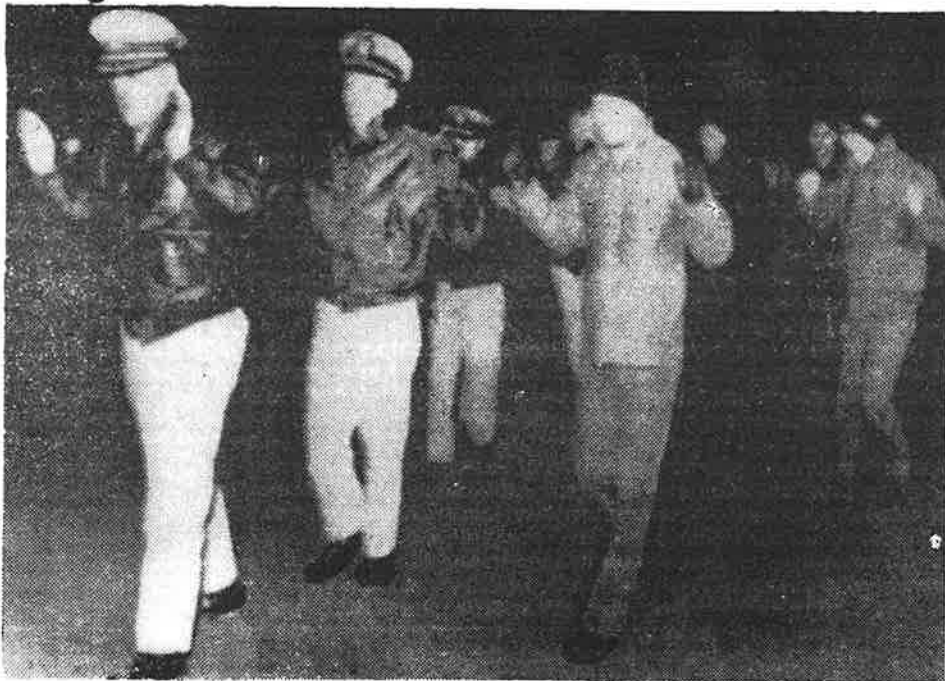
Members of the crew of the spy ship Pueblo, captured by North Koreans.