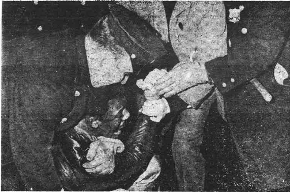
Police at work in front of Madison Square Garden.

NEW YORK, Feb. 16 — An angry, defiant crowd of Black people and progressive white youths demonstrated their feelings here tonight outside a track meet sponsored by the rich and bigoted New York Athletic Club at the new Madison Square Garden. A phalanx of meaty-faced, club-swinging cops guarded the main entrance for their masters.