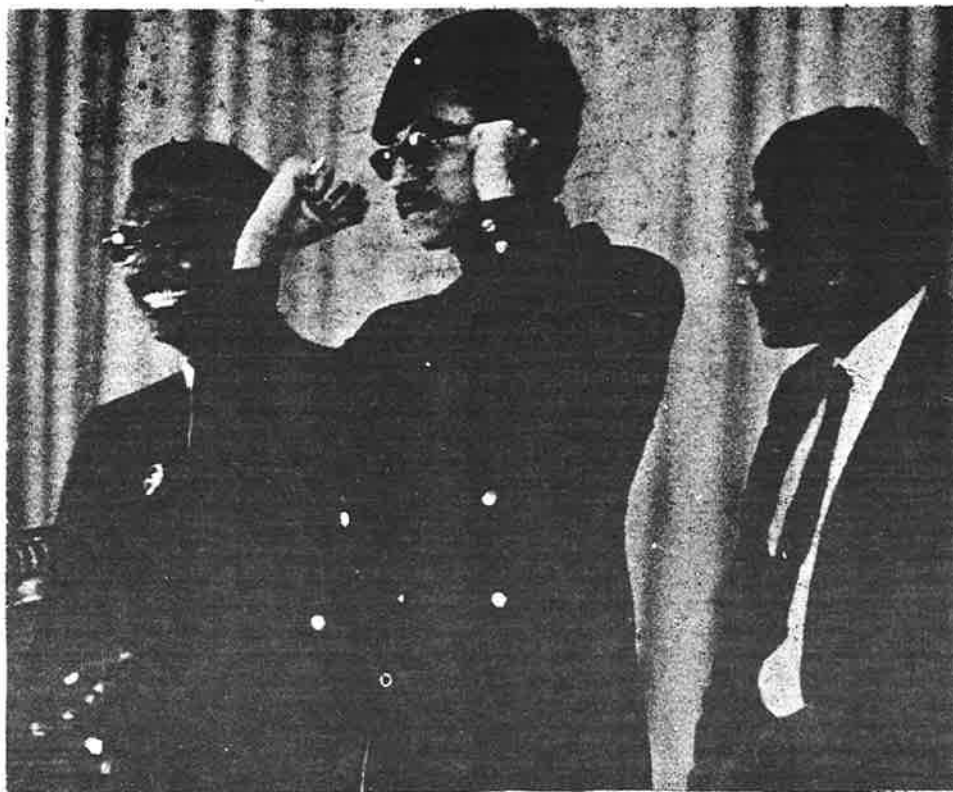
Prime Minister Carmichael, Minister of Justice Rap Brown and Foreign Minister James Forman pledging to set Huey Newton free. Defense Minister Newton is in jail, framed-up on a murder charge.

3.) Funds are needed for the H. Rap Brown Bail Fund. Send contributions