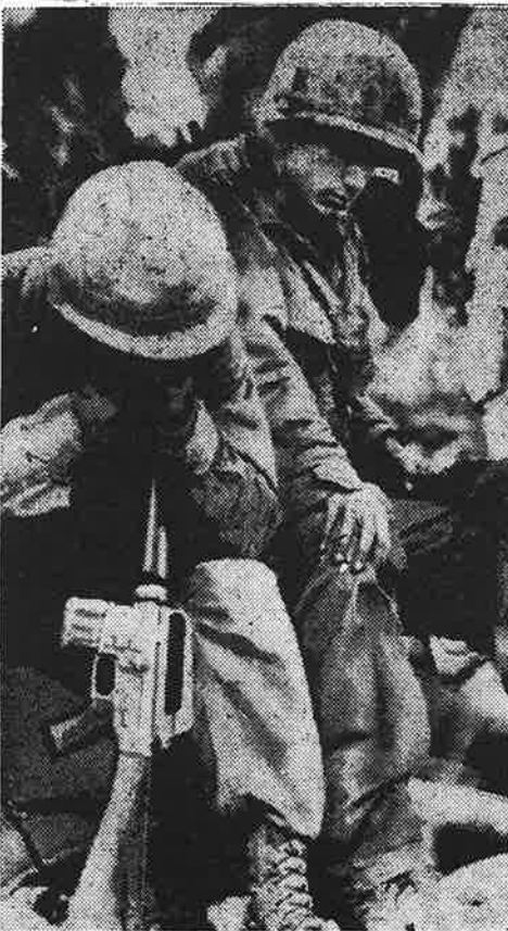
GIs after battle; How many more to die?

"These 34-A operations consisted of South Vietnamese patrol craft, the craft supplied by the United States, and with United States-trained crews, bombarding for the first time North Vietnamese shore installations. This clearly shows the Navy had knowledge