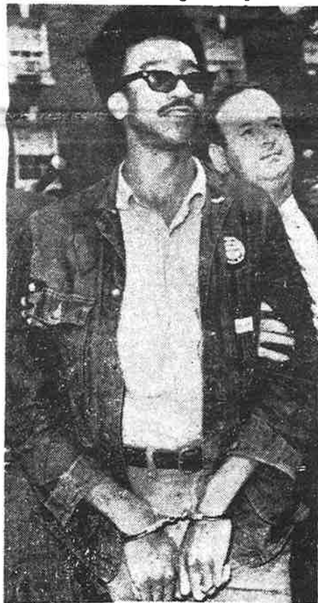
H. Rap Brown

—While the murderers of Black people go uncaught and unhung.