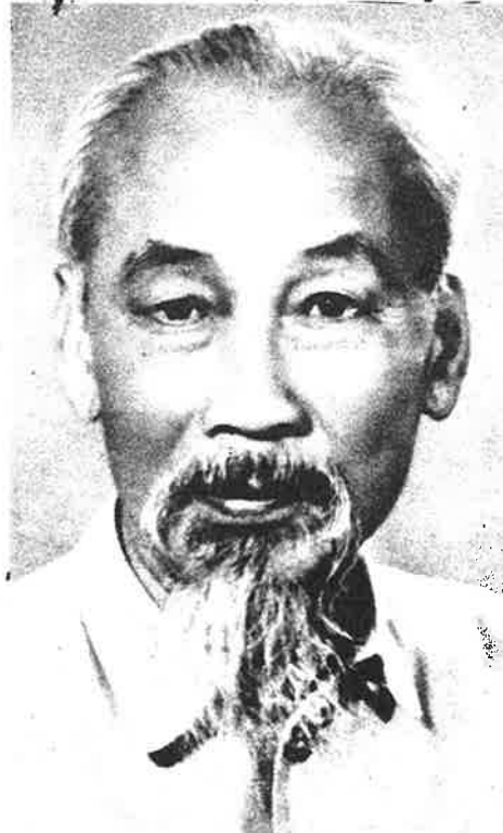
President HO CHI MINH

al salvation, i.e. to unite the entire people, resolutely defeat the U.S. imperialists' war of aggression, overthrow the puppet administration, establish a broad national and democratic coalition administration, build an independent democratic, peaceful, neutral and prosperous South Vietnam, and proceed towards the peaceful reunification of the Fatherland.