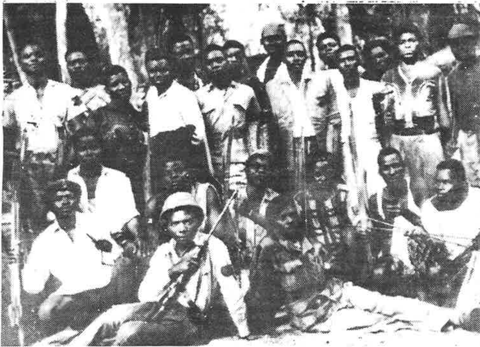
VALIANT FREEDOM FIGHTERS of Congo-Kinshasa continue the struggle in which Lumumba died. Shown at one of their bases in Kwilu.