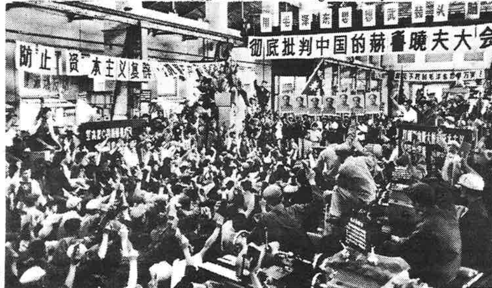
Workers discussing Cultural Revolution in Shanghai factory

The Chinese revolution and the great masses of China are themselves glorified by the campaign to glorify the night-soil collectors. It is one of the most admirable and heroic campaigns of history — a campaign that imperialist society could not even undertake, much less bring to victory.