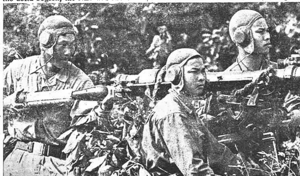
South Vietnamese Liberation Forces gunners prepare to fire a recoilless rifle. These accurate and destructive weapons are ideally suited to guerrilla warfare.

On January 6 there were wide-ranging attacks, including one on the vacation resort of Dalat northeast of Saigon.