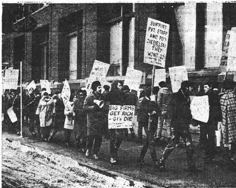
'Milwaukee youth march at induction center.