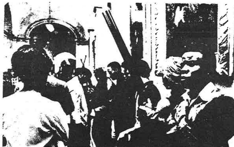
Members of the Black Panther Party for Self Defense as they paraded through the California state capital last May to dramatize the right of Black people to bear arms.

"Our own experience with the same Oakland police strengthens our conviction that Huey P. Newton is a victim of police assault and is now being held as a political prisoner."