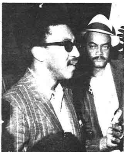
H. Rap Brown

Rap Brown Says, "We'll Do Anything to Free LeRoi Jones"; CORE to Test Right to Bear Arms