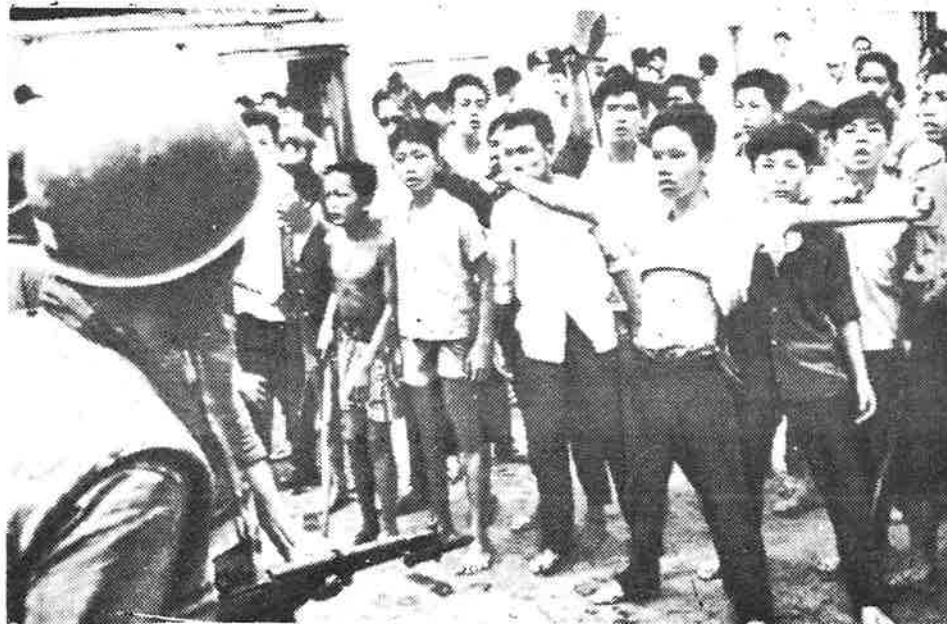
Unarmed youths face guns and bayonets of puppet troops during one of the first large Saigon demonstrations against U.S. imperialist occupation.

paid soldiers to vote twice for them, their poor showing at the polls was a clear repudiation of the U.S. and the war.