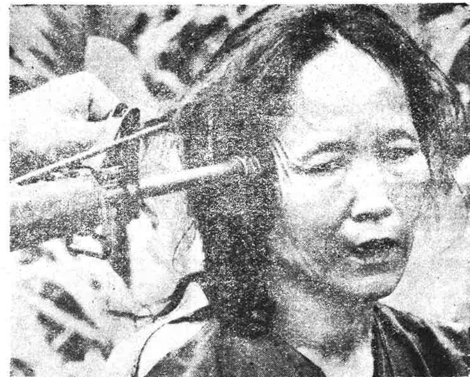
(The following is the New York Post caption, Nov. 9) Woman Viet Cong suspect is questioned while U. S. paratrooper presses his M16 rifle against her head in village near Tam Ky, South Vietnam.

Psychiatrists say that these unfortunate cops get that way because they "feel unloved."