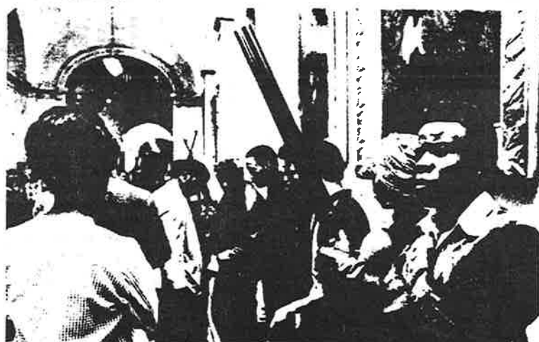
Members of the Black Panther Party for Self Defense as they paraded through the California state capital last May to dramatize the right of Black people to bear arms.

"Our own experience with the same Oakland police strengthens our conviction that Huey P. Newton is a victim of police assault and is now being held as a political prisoner."