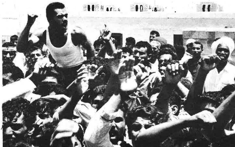
Palestinian Arabs demonstrating against U. S. — Israeli aggression on Sept. 28.

"The Palestine solution will be one thing if our role is limited to recommending what Great Britain, which is on top, is to carry out. It can be quite a different solution.... We must be present in the Middle East—present somewhere, for example, at the port of Haifa (now in Israel—ed.)—exercising not only influence from the distance of Washington, but influence radiating from some local point of actual power."