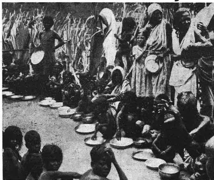
Indian women in West Bengal, where starvation is rampant, waiting for their food ration.

Similar deals were made with the 550 princes whose states were then incorporated into the Indian union. State guarantees for the privileges and privy purses of these reactionary tyrants were written into the Constitution. Income and lands are tax free; princes must be addressed by their titles and are allowed to fly their flags; they have the right to have their own palace guards; free medical service and telegraph service are guaranteed; they are exempt from import duties; no legal