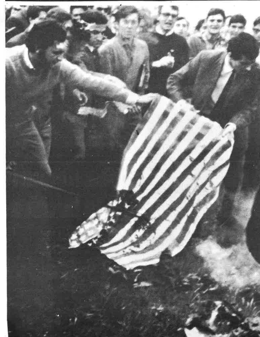
Spanish students in Madrid burn the U.S. flag in a demonstration on August 21, to protest U.S. imperialist aggression against Vietnam.