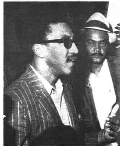
H. Rap Brown