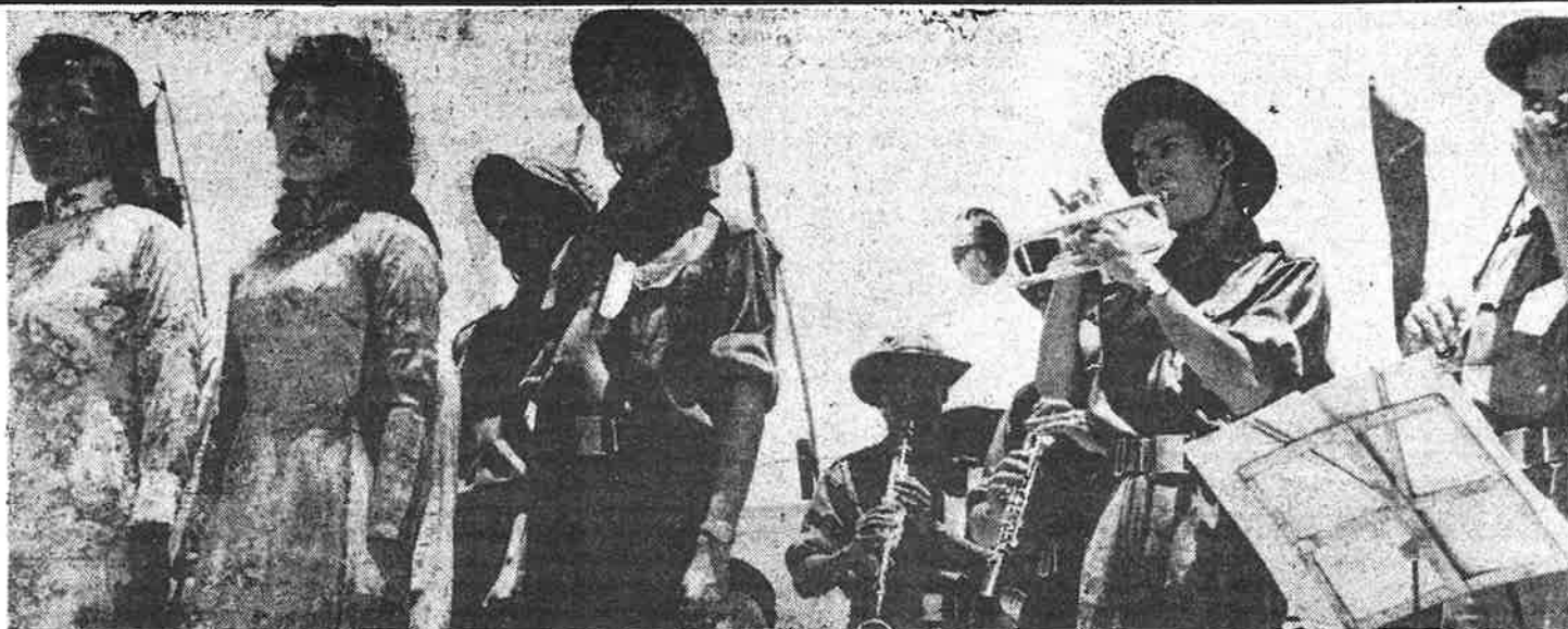
Vietnamese liberation fighters playing for the Latin American Solidarity Conference in Havana.

The mere fact that this conference could be successfully held 90 miles from the shores of the imperialist U.S.A. and in defiance of Washington, marks it as an achievement for the oppressed people everywhere.