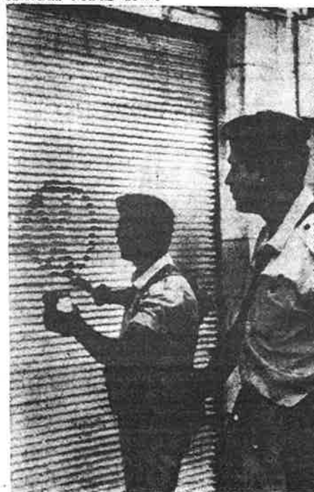
Israeli soldiers trying to intimidate Arabs by painting X's at random on doors of shops on strike.

It's a trial balloon that should float over the bases in Vietnam and the training camps of the United States with all the glamor and fun of a lead coffin.