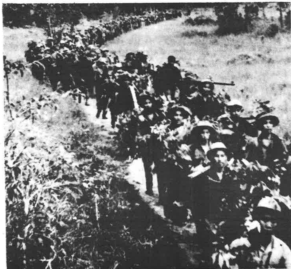
A unit of the South Vietnamese Liberation Army leaving for the front.

righteous, so virtuous and so holy as an imperialist war that can be won. Conversely, there is nothing like defeat to bring every variety of political servant of the ruling class crawling out of the woodwork to preach the immorality of a particular war to their masters.