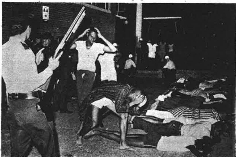
Police terrorize students after pouring hail of bullets into TSU dorm.

Observers noted that the terrible racist terror inflicted on the TSU students was indicative of the racist authorities' growing fear of the militancy of the Afro-American freedom struggle. It was particularly noted that this was the first time during three years of rebellions and repressions in the ghettos and on the campuses that a cop was killed.