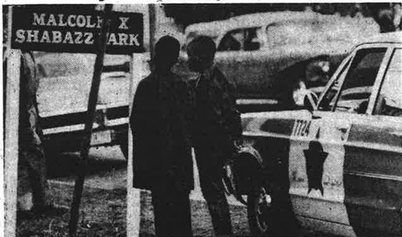
Cops arrested 30 in Chicago last Sunday, when the Afro-American Students' Association put up a sign renaming a city park (shown above). The police had attacked their meeting during an internal dispute, clubbed heads and wounded ten.