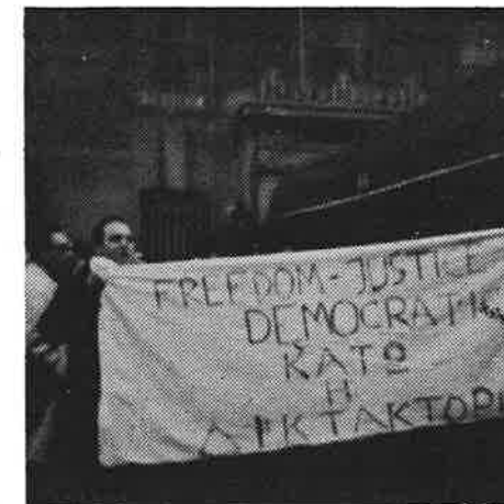
Several hundred picketed the Greek Mission to the United Nations last Sunday, demanding removal of fascists and end of the monarchy.

The semi-democracy the U.S. has recently permitted has now been snuffed out in the name of "avoiding bloodshed"