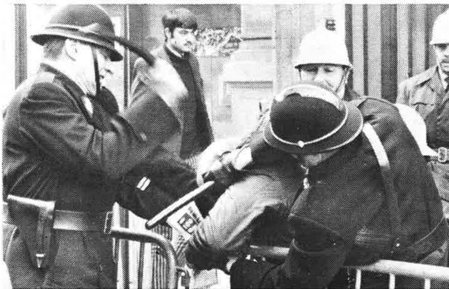
Belgian cops slugging one of many citizens who hooted Humphrey.

But the change in demonstrators does not really mean Humphrey has changed. Although his ADA connections made him a target of the extreme right wing, Humphrey has always been a loyal servant of the ruling class. And his work as travelling salesman for the war proves it.