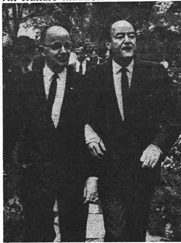
Humphrey strolls with Maddox and assures him there's room for him under "Democratic" roof.