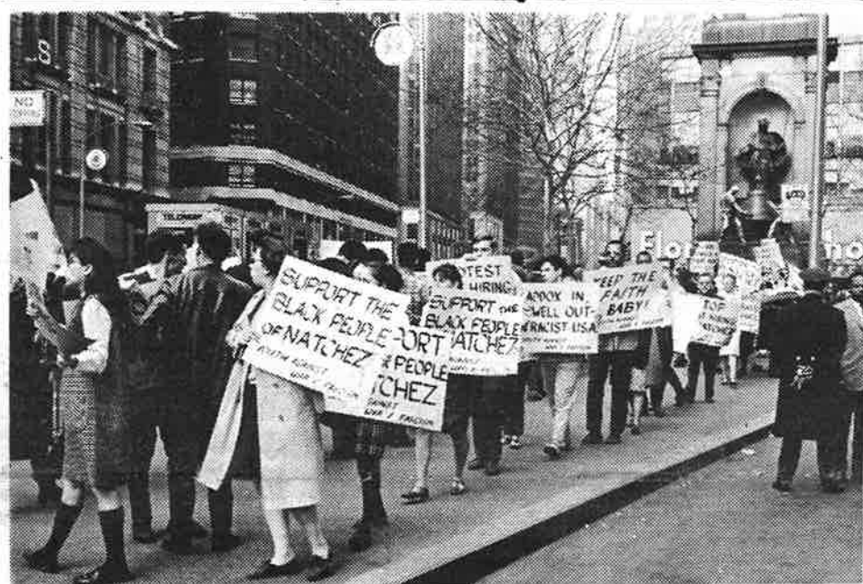
Protest in Herald Square, N.Y. Last Week. See Story Below.