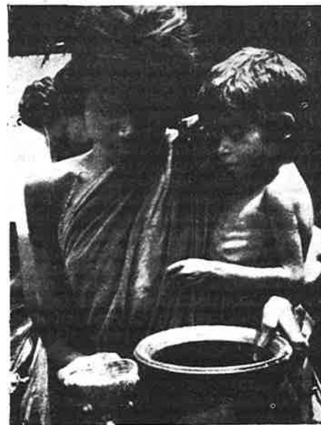
India: the bowl is empty

Two weeks ago, the left wing CP, which has been identified with the Chinese Communist Party in the past, won 52 of the 61 seats for which it ran, in the Kerala state assembly and has the decisive support of the masses in the coalition government to be formed shortly. Of the 133 seats in the Kerala