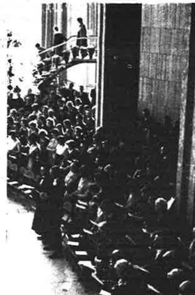
Time-Life workers at memorial for Luce — on company time. Nelson Rockefeller mourned on N. Y. State taxpayers' time.

The original $86,000 for Time was financed by Henry P. Davison of J.P. Morgan and Company, Dwight W. Morrow of J.P. Morgan and Company, Harvey Firestone, E. Roland Harriman