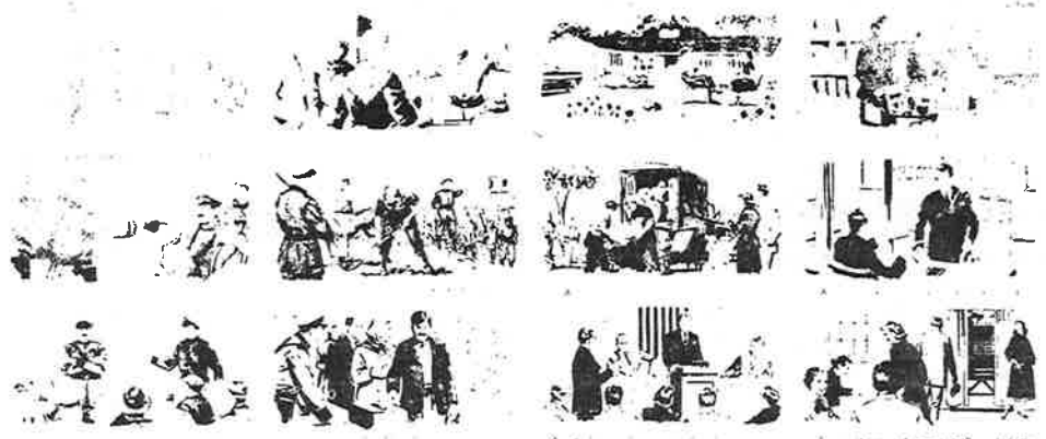
Two Pages From an "Impartial" U.S. Schoolbook

Words can be misleading. The peace movement through the advocacy of negotiations in Vietnam has harmed the cause it purports to promote. We must side with the Vietnamese who defend every value which the peace movement has espoused abstractly. The end of the war in Vietnam will depend on our capacity to speak and act clearly, alerting people to its origins and motive force. When people in Britain and America oppose Johnson effectively, then and only then will the war end.