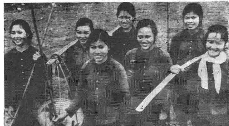
Seven girls of Ne Village in North Vietnam. They are growers of water lentils and preparers of green manure in the Minh Duc Cooperative. They are also in the militia and practice target training to defend their country.