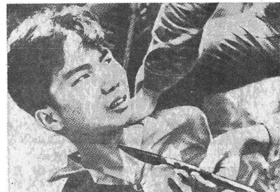
Under the caption, "Red Guerrilla Decides to Talk," the New York Journal American explained that "the interrogator has made a persuasive point with (the guerrilla's) own captured spear. He told where fellow Reds had hidden a cache of Chinese grenades."—Too bad he didn't have a grenade himself, instead of a spear!

and the First National City Bank crowd control a majority of the Chilean mines, and that means they control the lives (and deaths) of the mineworkers. Like the French company, they are more concerned with profit than preserving workers' lives. If a "natural disaster" should strike one of their mines and "a few broken boards protruding from the sticky red mud, half-buried utensils and